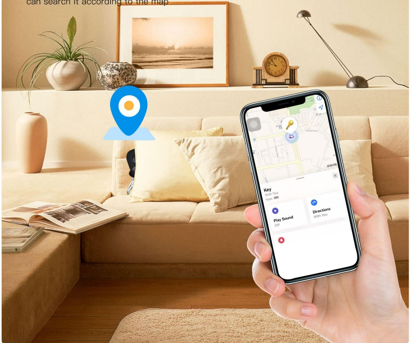
Figure 3: Using the Find My app to locate items nearby.

App will record the location of the product and you can search it according to the map