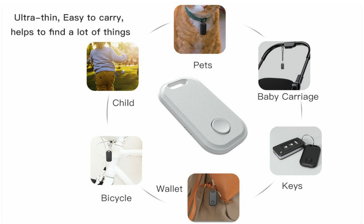
Figure 4: Global tracking of items using the Find My network.