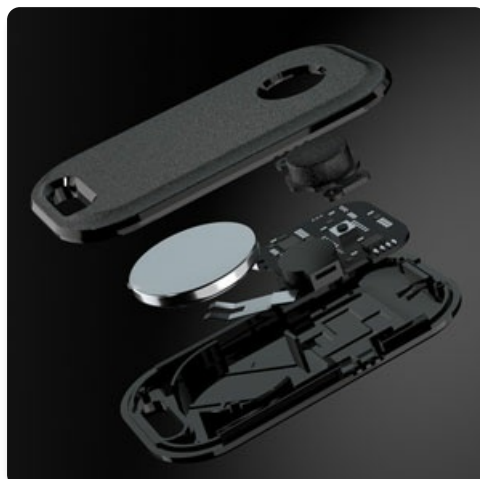
Figure 6: Tracker dimensions and battery type.