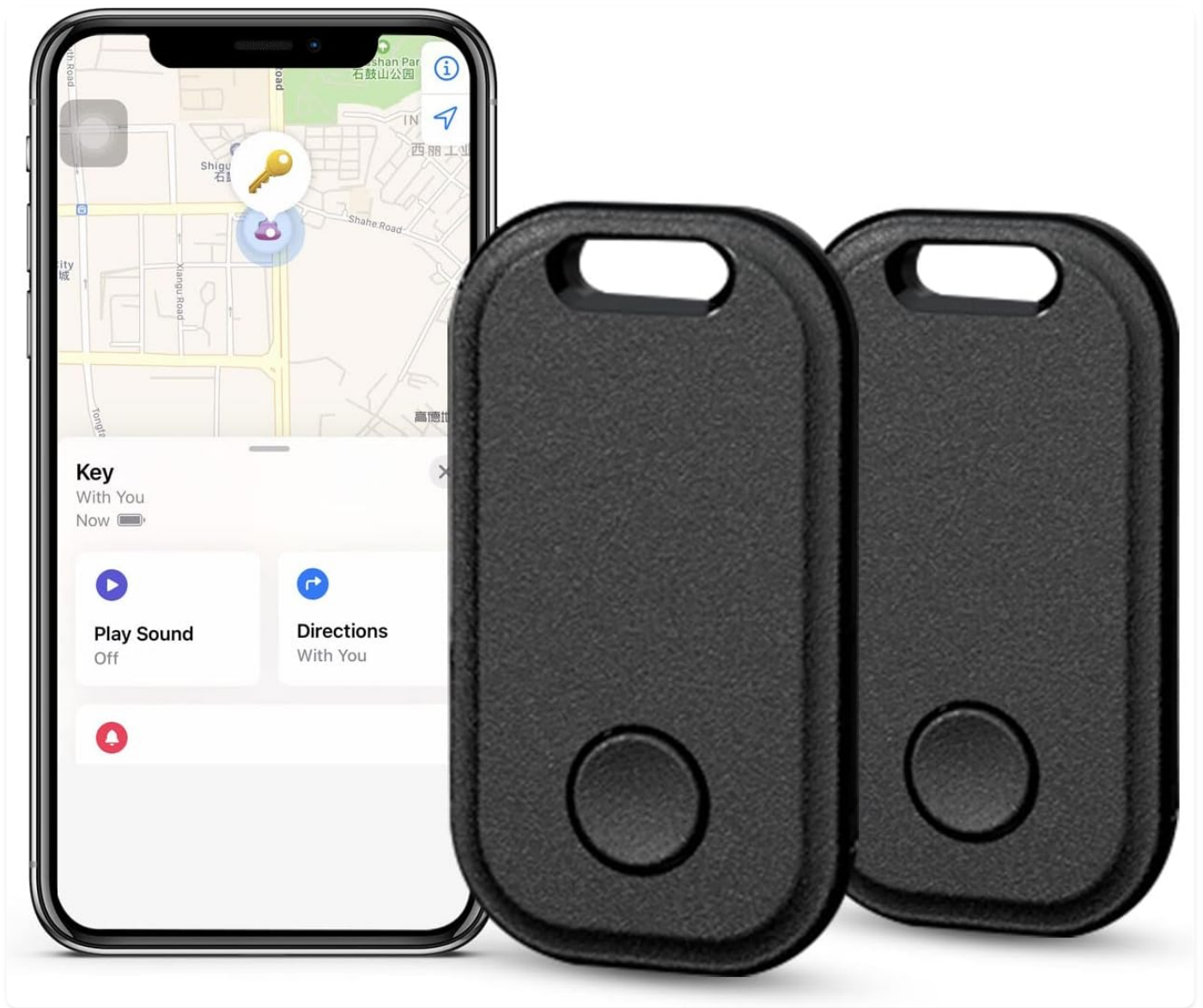
Figure 1: AIYATO Smart Bluetooth Trackers with iPhone displaying Find My app.