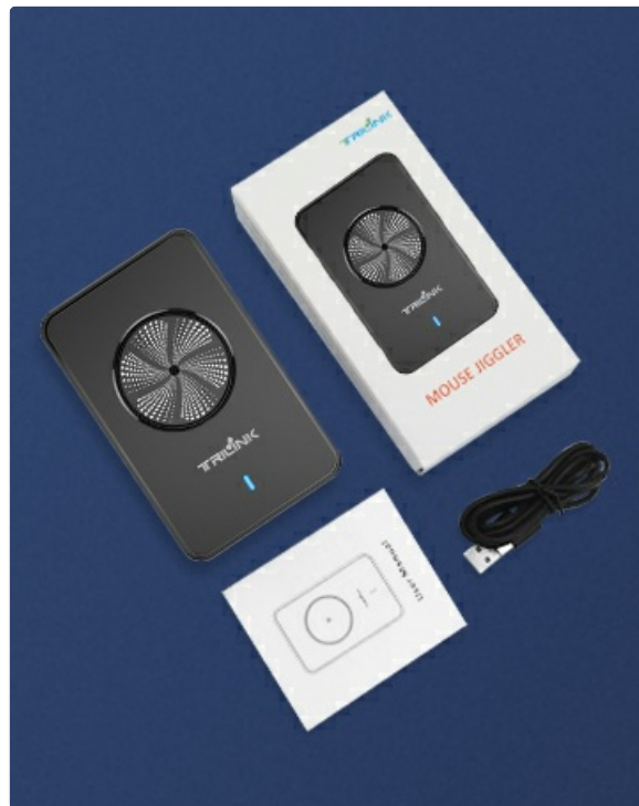
Image Description: An image showing the TRILINK Mouse Jiggler, its USB power cable, and the user manual, all neatly arranged as they would appear in the product packaging.