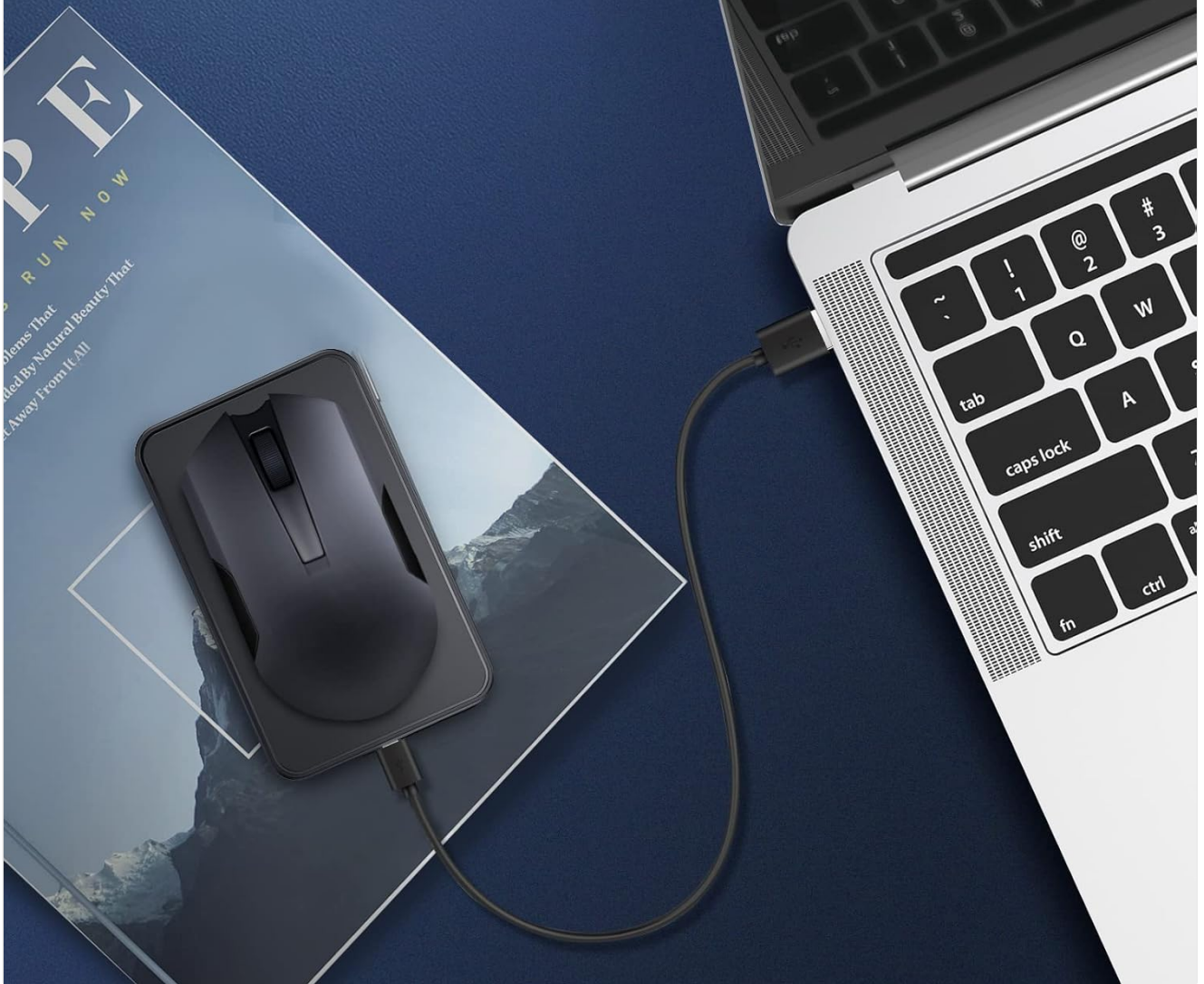
Image Description: A laptop displaying an active screen, with the TRILINK Mouse Jiggler and a mouse positioned next to it, illustrating its function of keeping the computer awake.