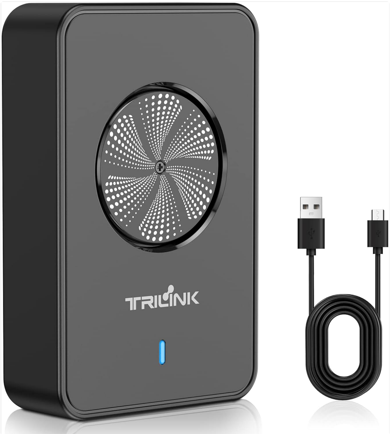
Image Description: The TRILINK Undetectable Mechanical Mouse Jiggler, a compact black rectangular device, is displayed alongside its USB power cable. The device features a circular patterned area on its top surface and a small blue indicator light on the front.