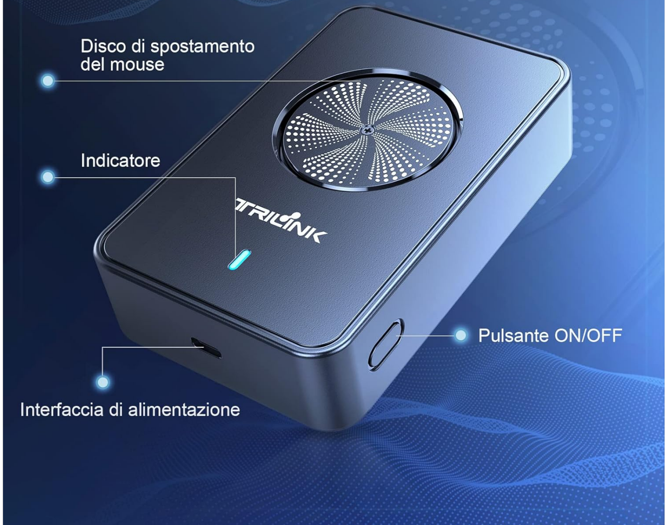
Image Description: A close-up view of the TRILINK Mouse Jiggler, highlighting its key components. Labels point to the mouse movement disk, the indicator light, the ON/OFF button, and the power interface.