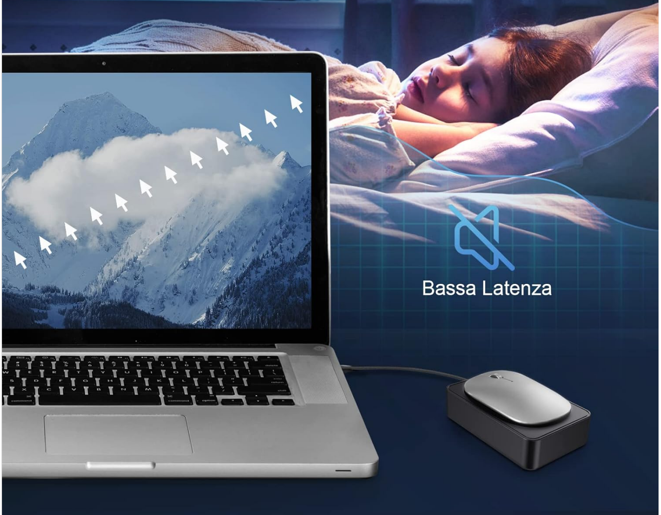
Image Description: A laptop screen displaying a serene mountain landscape, with the TRILINK Mouse Jiggler and a mouse positioned next to it. A graphic indicates "Bassa Latenza" (Low Latency) and a silent operation icon, suggesting quiet performance even while a person sleeps in the background.

Mantiene un ambiente silenzioso durante il funzionamento del dispositivo