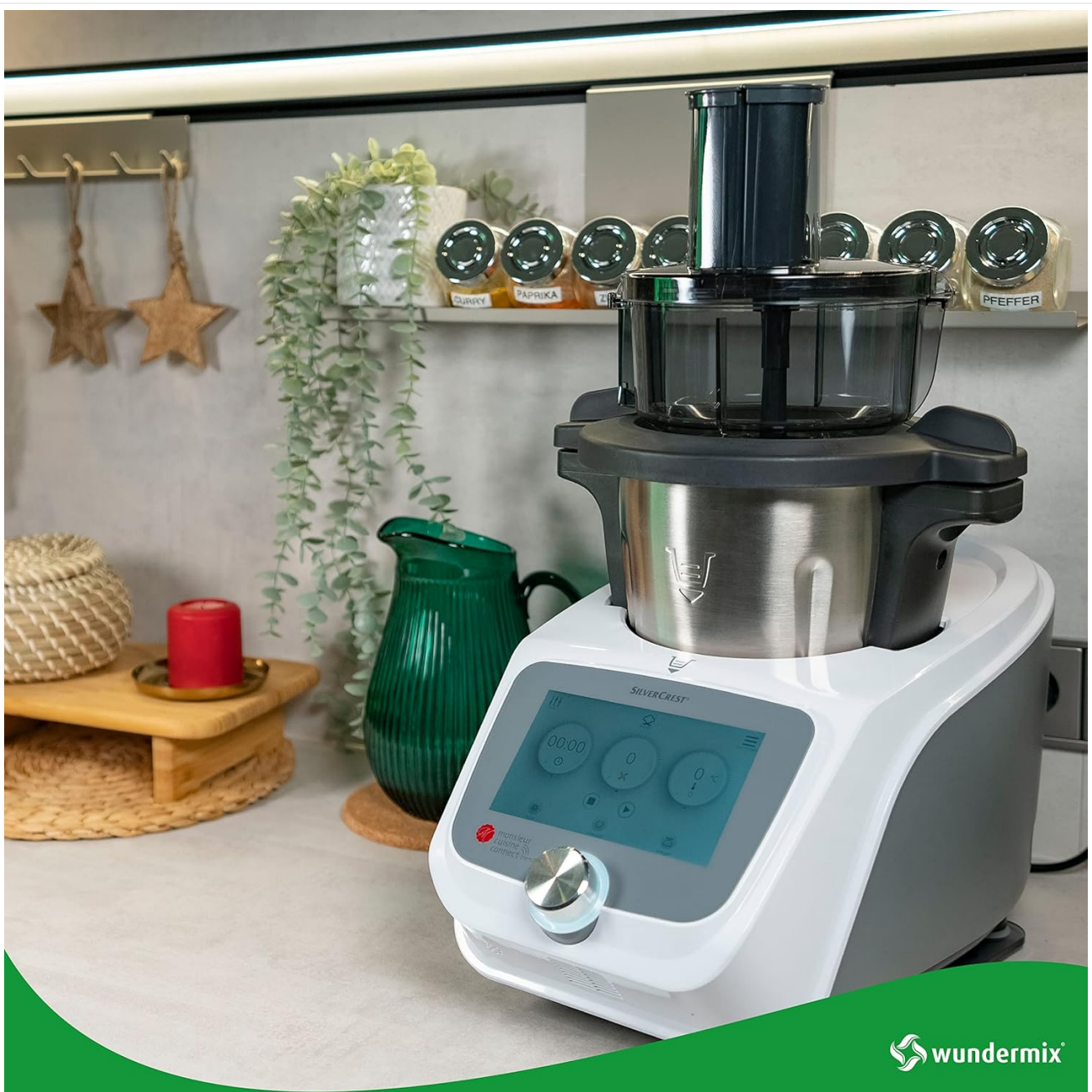
Figure 4: WunderSlicer correctly attached to a Monsieur Cuisine food processor.