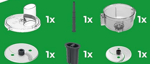
Figure 1: WunderSlicer components and approximate dimensions (22 cm width, 24.5 cm height).