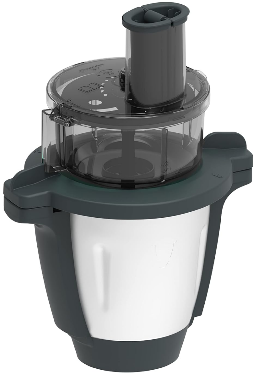
Figure 3: Fully assembled WunderSlicer.