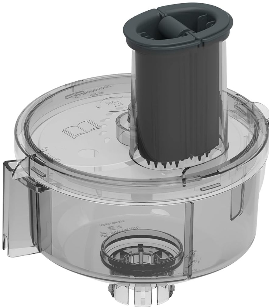
Figure 2: Detailed view of the transparent lid and food pusher.