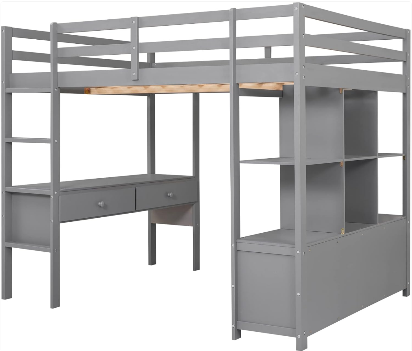
Image 5.2: Detail view of the storage shelves with their integrated drawers.