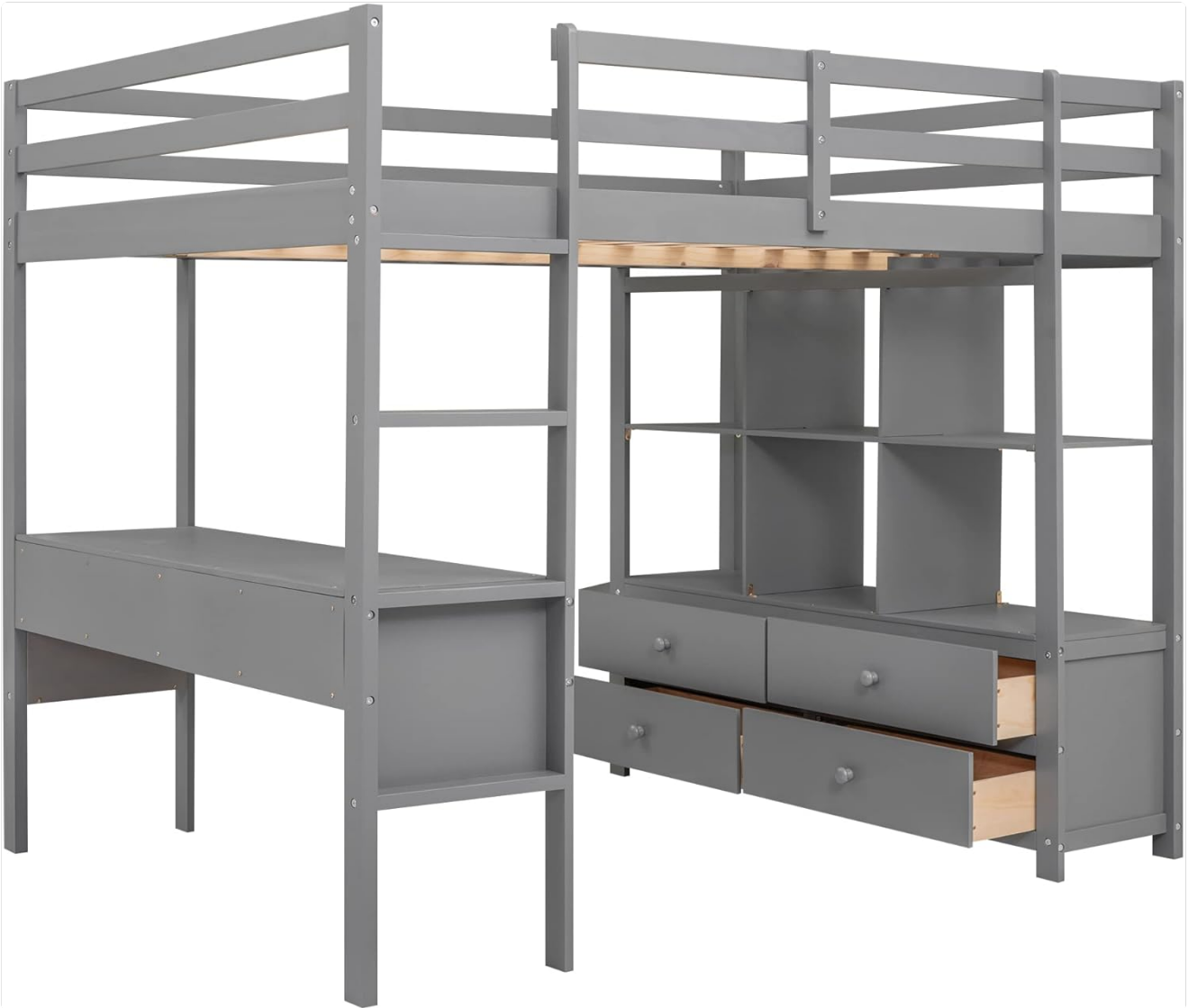
Image 5.1: Detail view of the built-in desk with its two pull-out drawers.