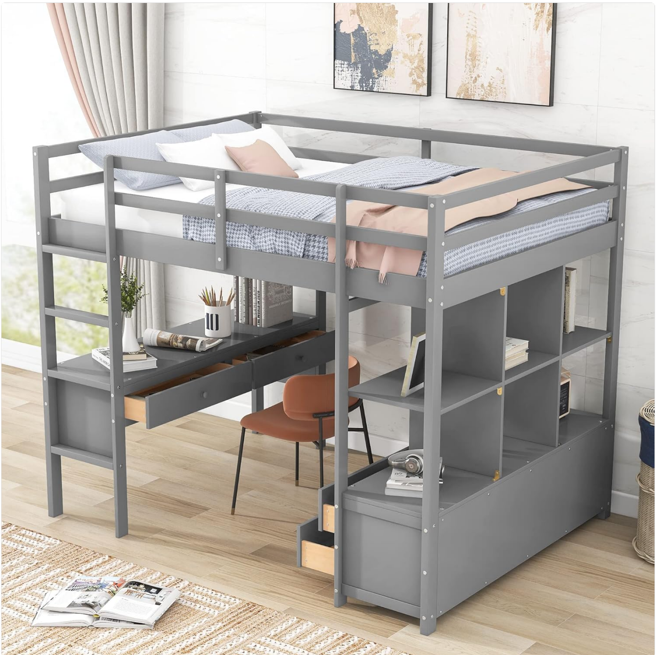
Image 1.1: Fully assembled Merax Full Size Loft Bed, showcasing the integrated desk and storage shelves.