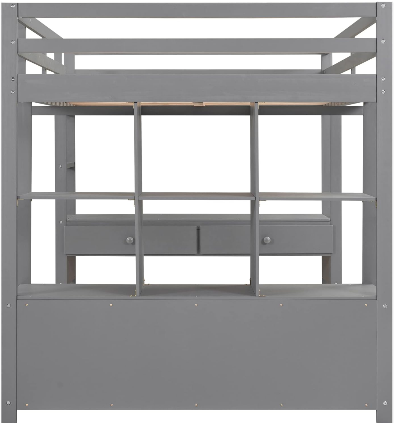
Image 4.1: Front view of the assembled loft bed, showing the integrated desk and storage unit.