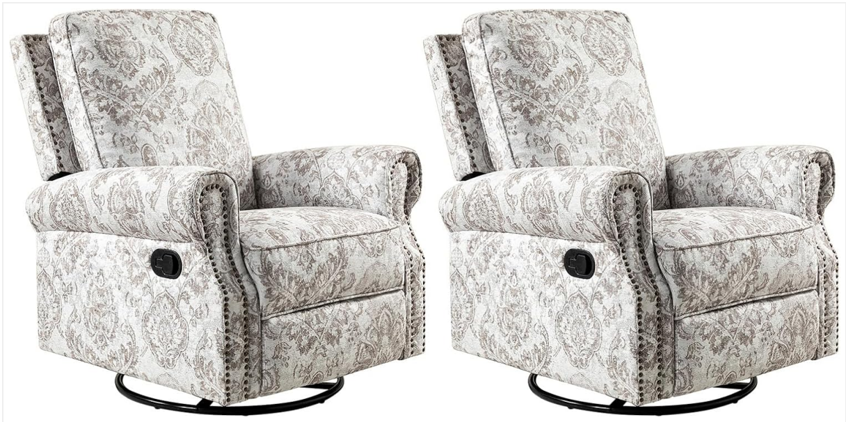
Image: Two HULALA HOME Charles Swivel Rocker Recliners.