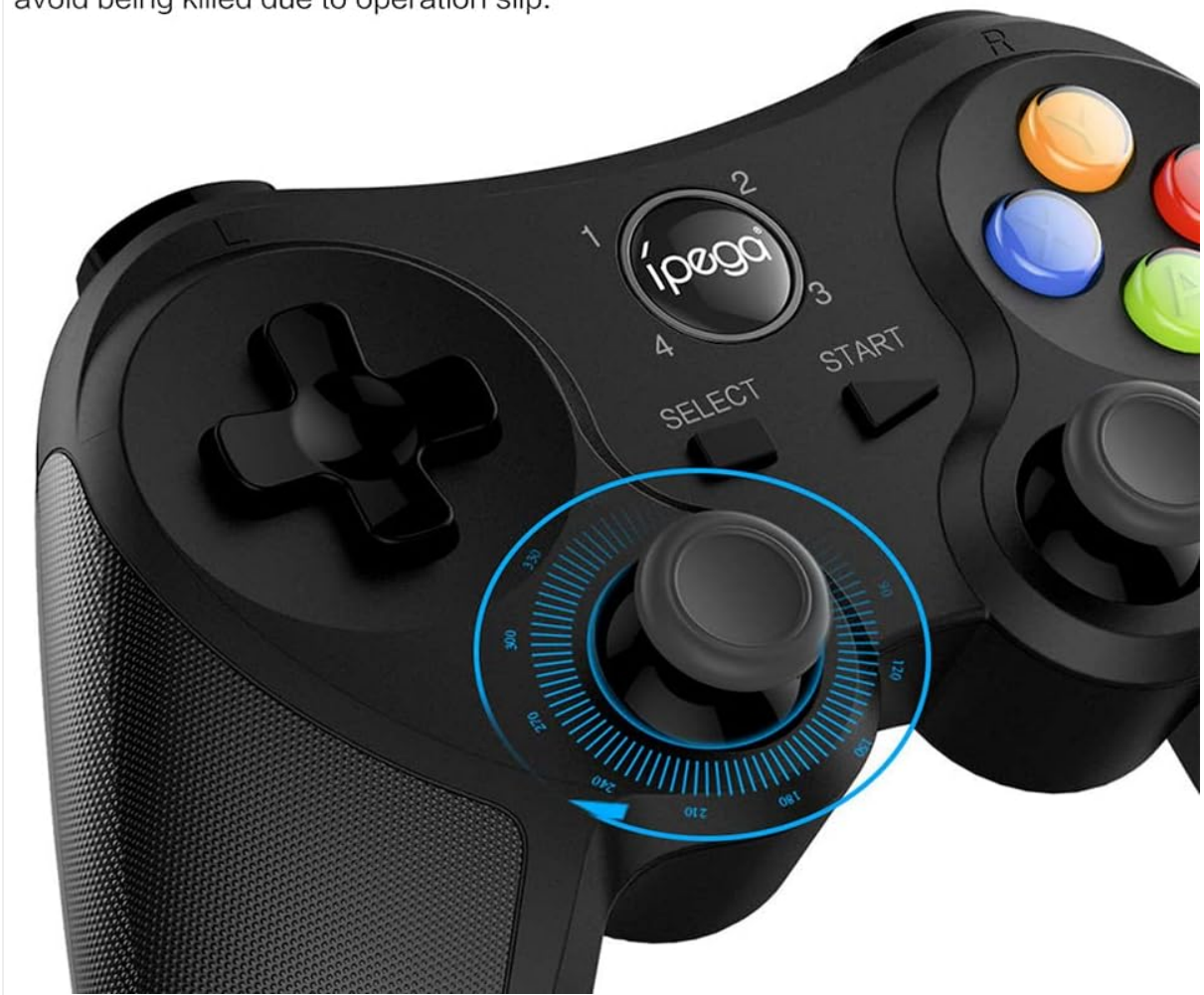
Figure 4.3: The high-accuracy joystick, featuring 360-degree movement and an anti-slip texture for enhanced control.

360 degree high sensibility & accuracy joystick, with anti-slip texture, avoid being killed due to operation slip.