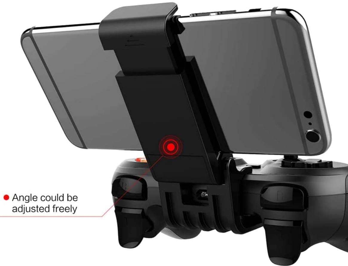
Figure 4.2: The adjustable phone holder, designed to securely hold smartphones between 4 and 5.5 inches. The angle can be freely adjusted for user comfort.

Support 4–5.5 inch cellphone, angle could be adjusted freely, playing at any time anywhere.