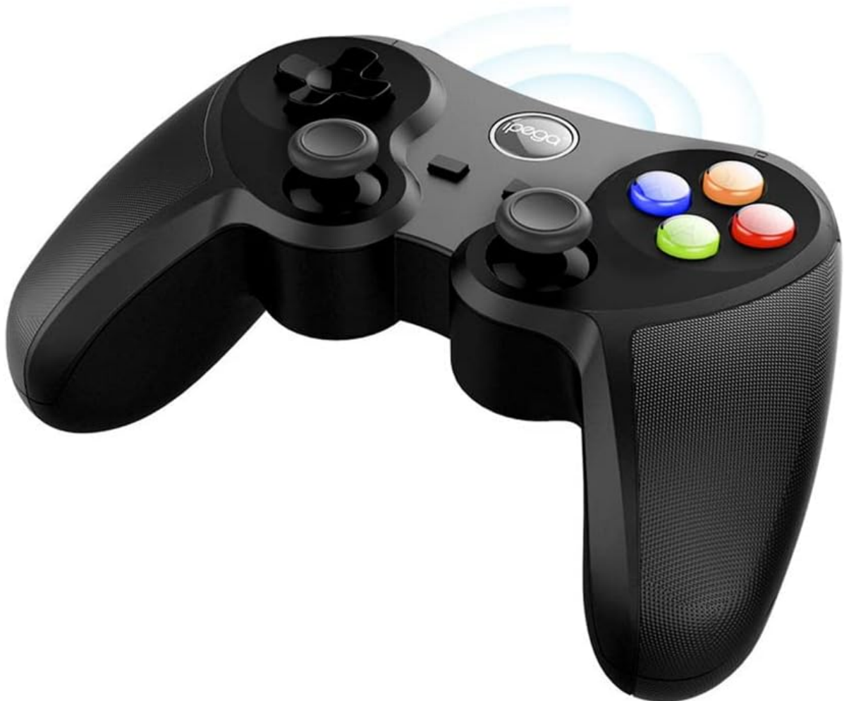
Figure 4.6: The gamepad utilizes Bluetooth technology for wireless connectivity, offering a stable connection up to 8 meters.