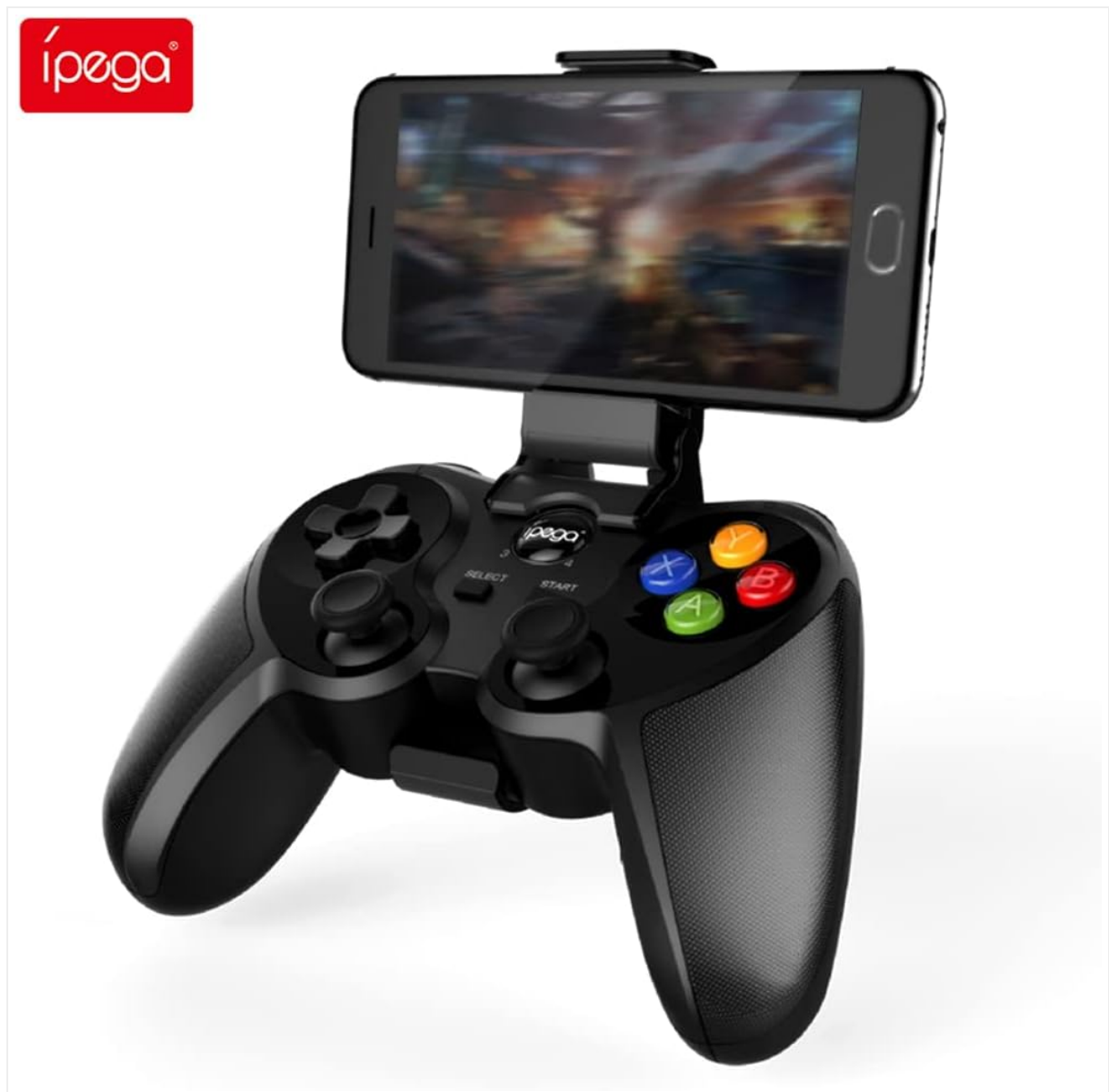
Figure 4.1: Graflosoa PG-9078 Wireless Gamepad with a smartphone mounted in the integrated holder.

Familiarize yourself with the components and features of your PG-9078 gamepad.