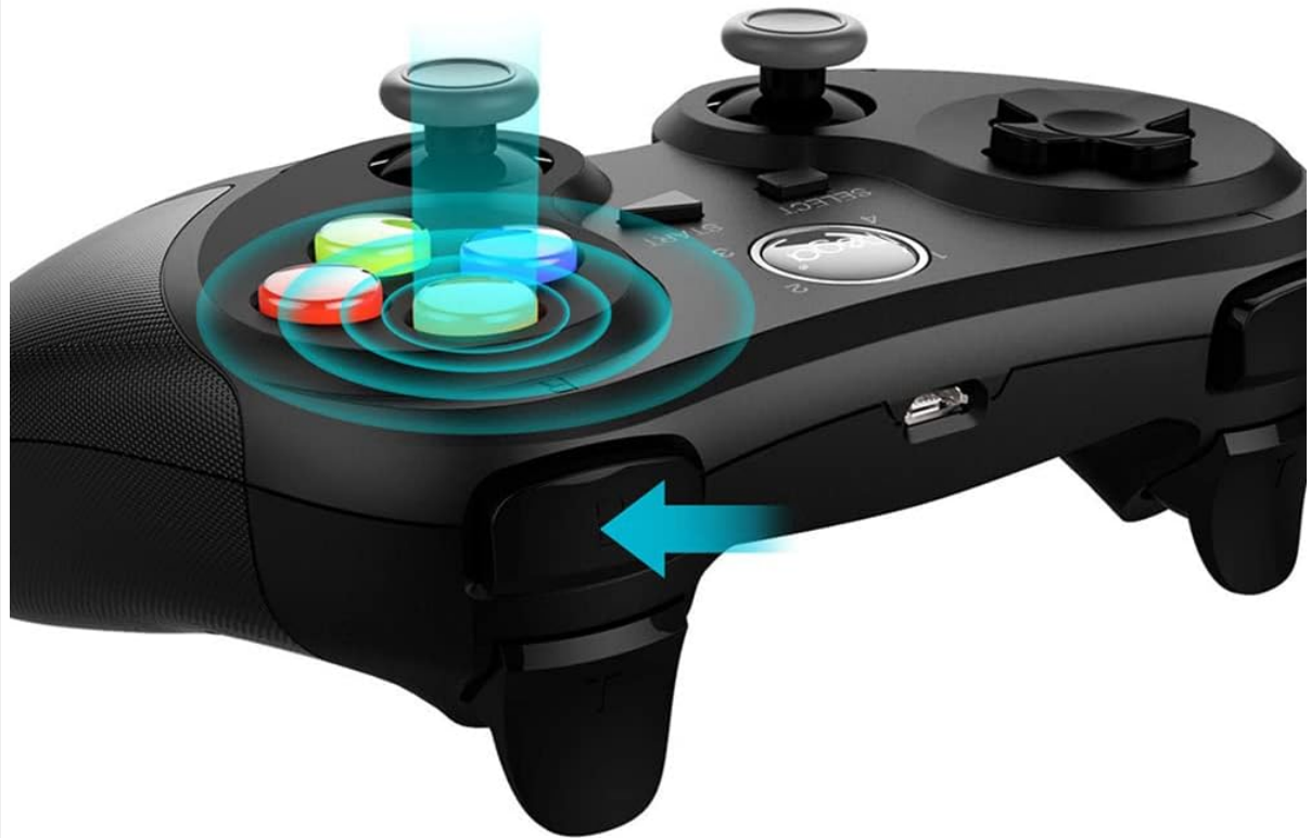
Figure 4.4: The highly sensitive and responsive face buttons and shoulder buttons, designed for quick input.

Top bottom respond speed, no matter click or combination key click, gamepad can respond quickly.