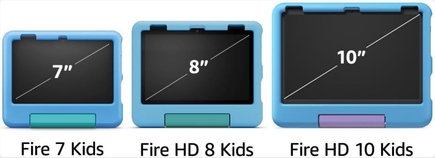
Figure 6: Size Comparison of Fire Kids Tablets.

The Amazon Fire 7 Kids tablet comes with a 2-year worry-free guarantee. If the device breaks, Amazon will replace it for free within 2 years of purchase. This guarantee covers accidental damage.