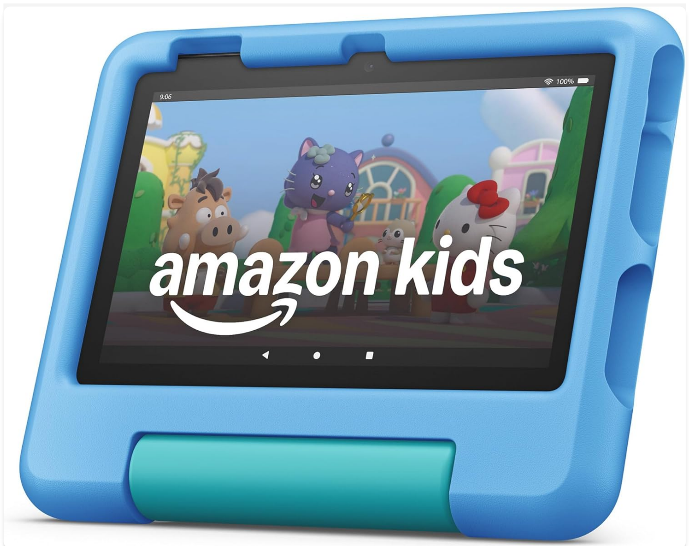
Figure 2: Amazon Kids+ Interface.