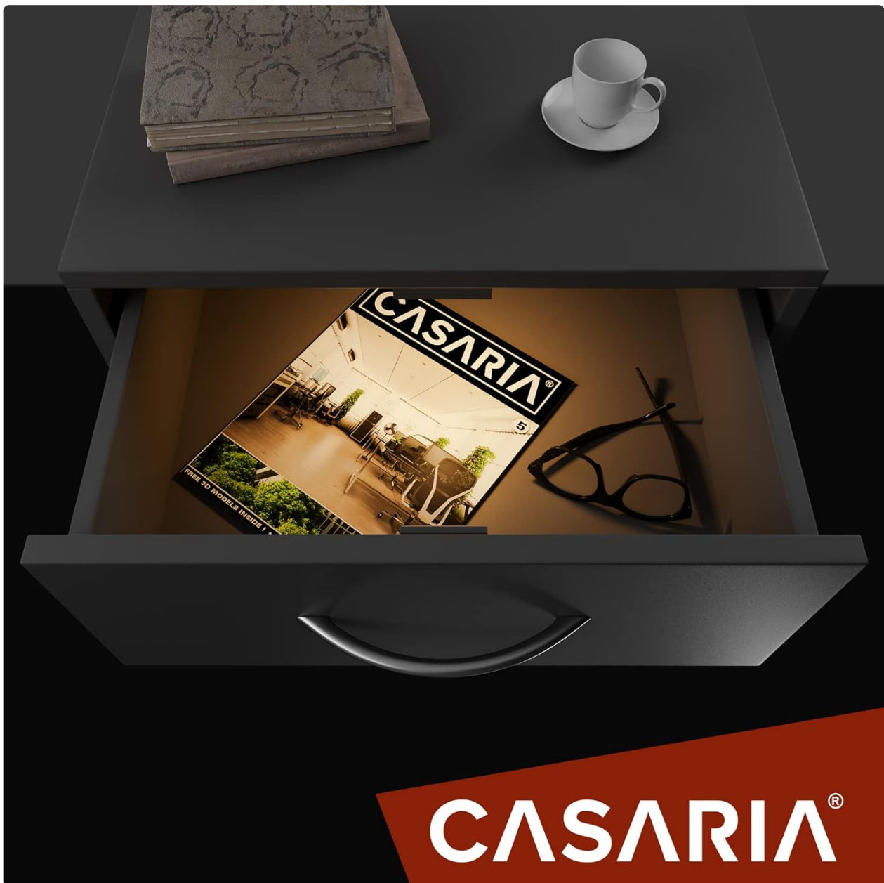
Image: Interior view of an open drawer, illustrating the storage capacity and the area where LED lighting would activate.

If your model includes LED drawer lighting, it operates automatically. A distance sensor detects when the drawer is opened and illuminates the interior. The light will turn off when the drawer is closed. Ensure batteries (not included) are correctly installed if your model requires them.