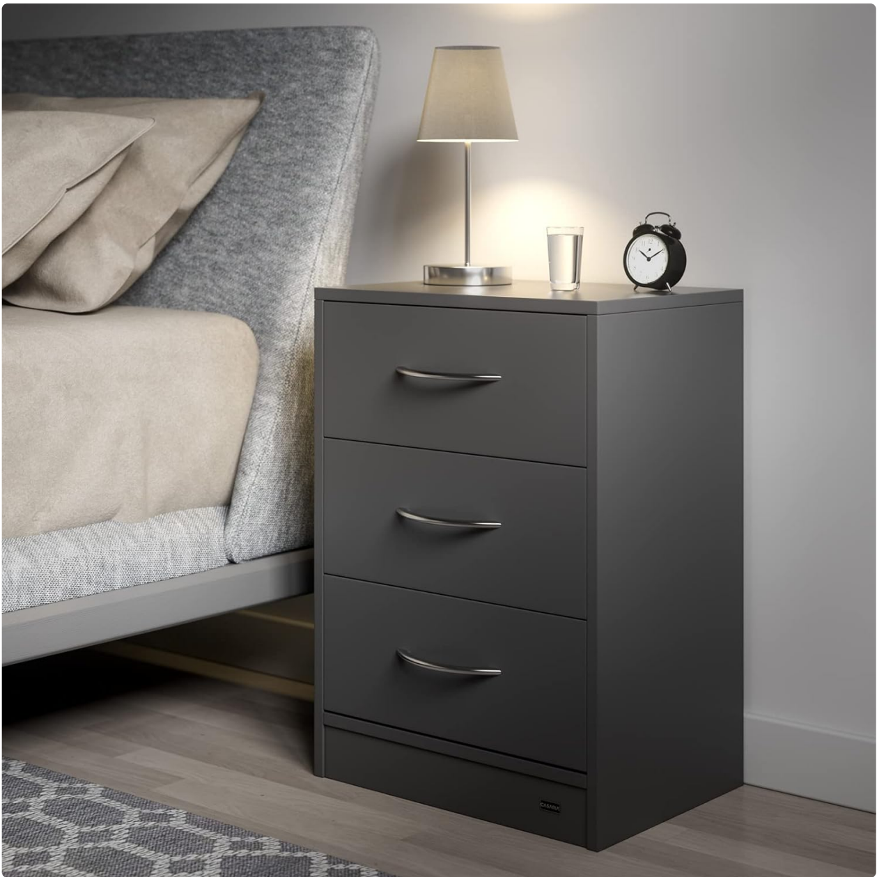
Image: A single Casaria Eloise bedside table positioned beside a bed, demonstrating its integration into a bedroom environment.