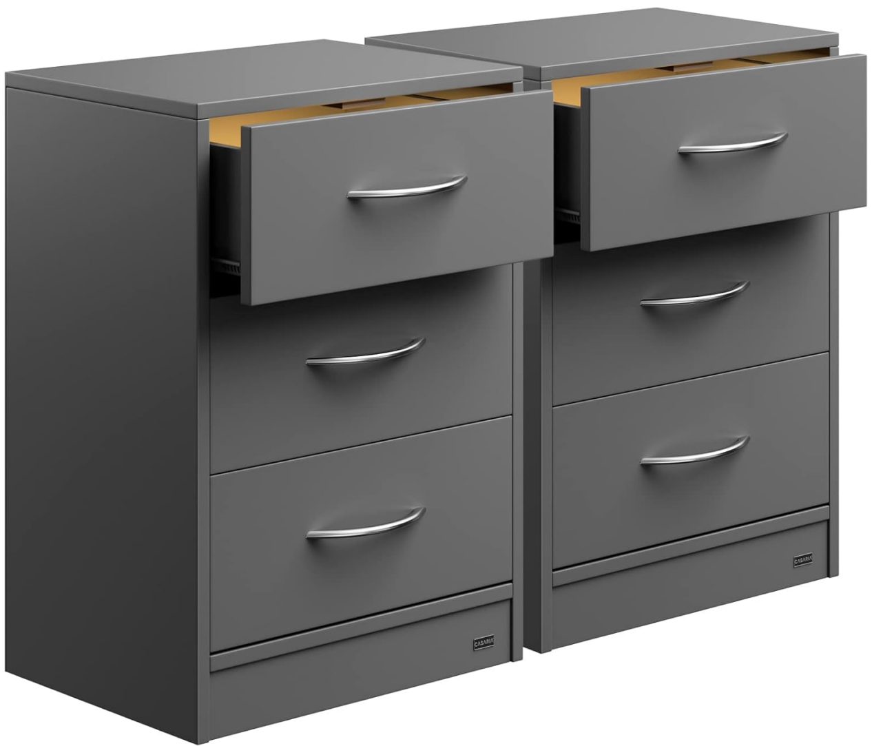
Image: Two Casaria Eloise bedside tables with drawers partially open, illustrating the product's design and storage capacity.