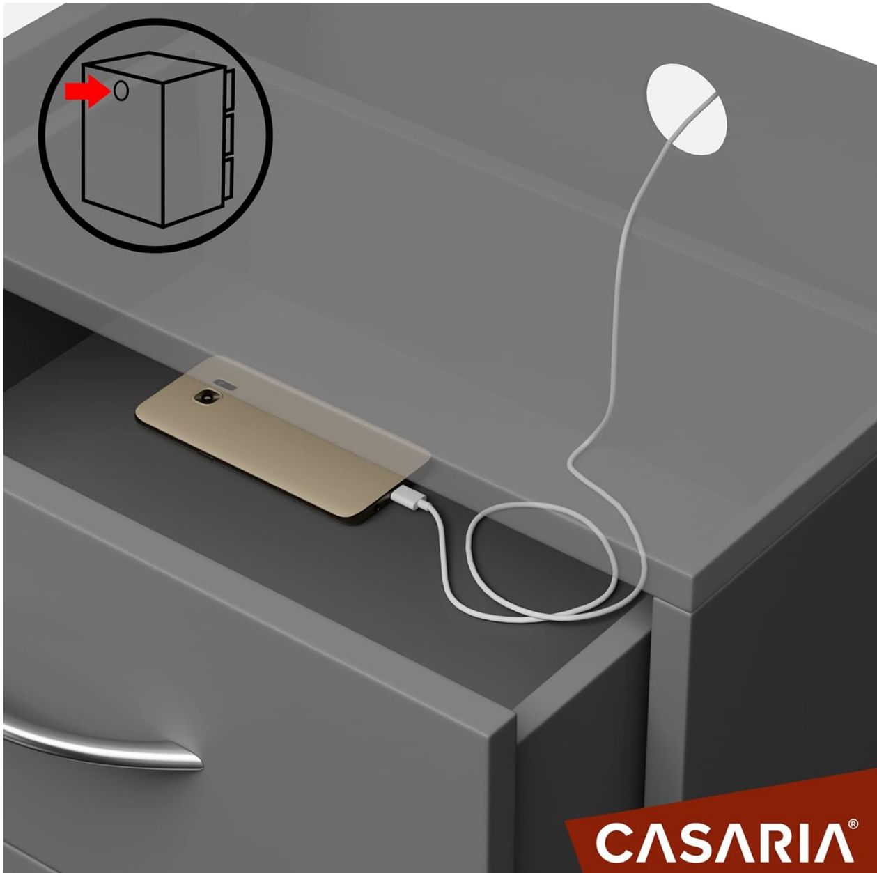
Image: Detailed view of the cable grommet, demonstrating how a charging cable can be discreetly managed.

The bedside table features an integrated cable grommet located at the back. This allows you to route charging cables for electronic devices, such as smartphones, from the top surface or inside a drawer, keeping cables tidy and out of sight.