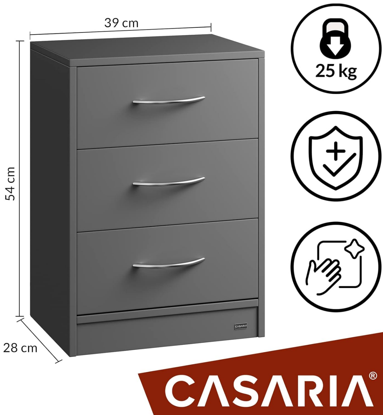
Image: Visual representation of the bedside table's dimensions and key features like load capacity and ease of cleaning.