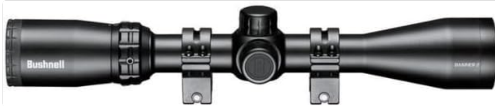
Figure 2: Riflescope with Mounting Rings

The Banner 2 riflescope is designed for use with Weaver/Picatinny mounts. Ensure the scope is mounted securely to your rifle, allowing for proper eye relief to prevent injury from recoil. Always verify that the firearm is clear and safe before beginning any mounting procedures.