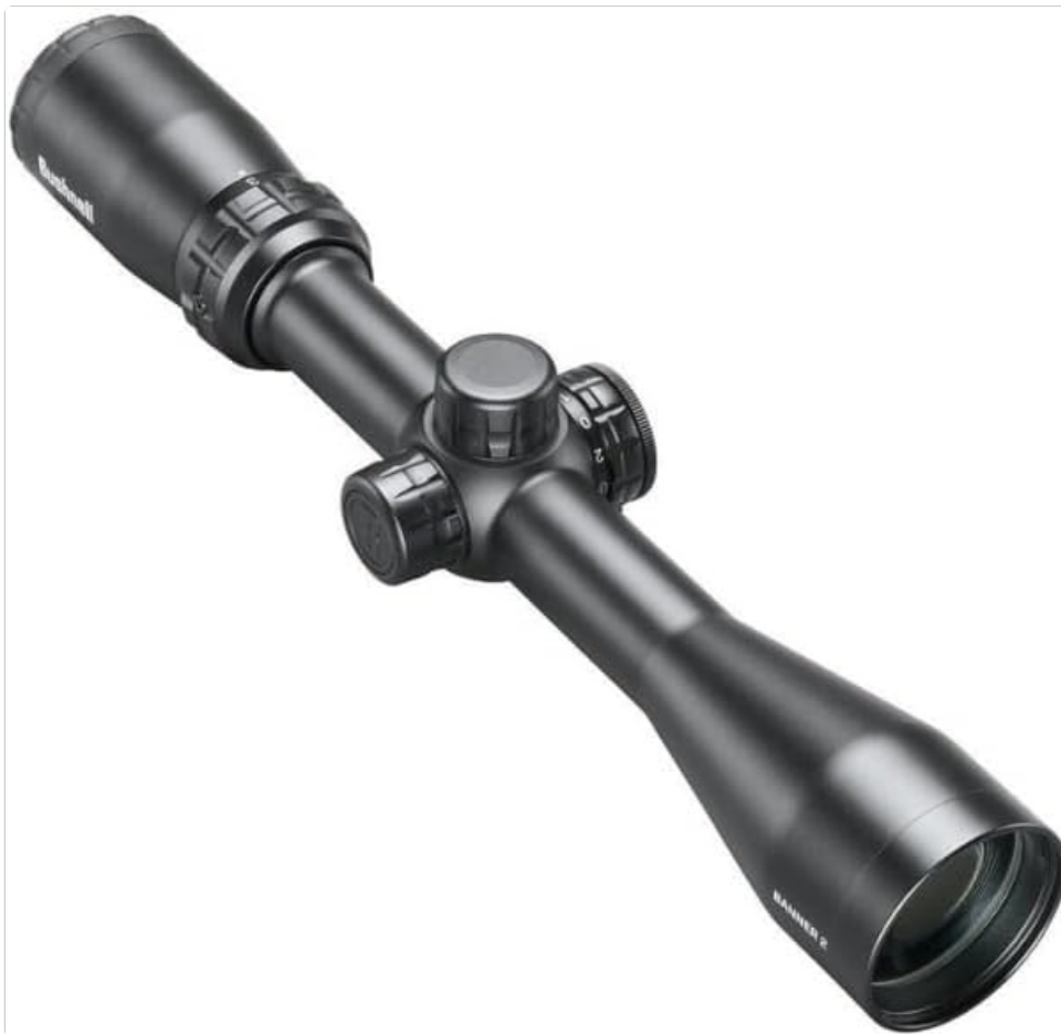
Figure 3: Riflescope Adjustment Turrets

The illuminated reticle enhances visibility in low-light conditions. To activate or adjust the illumination, locate the control knob on the side of the scope. Rotate the knob to cycle through brightness settings. Ensure the battery is properly installed (refer to maintenance section for battery replacement).