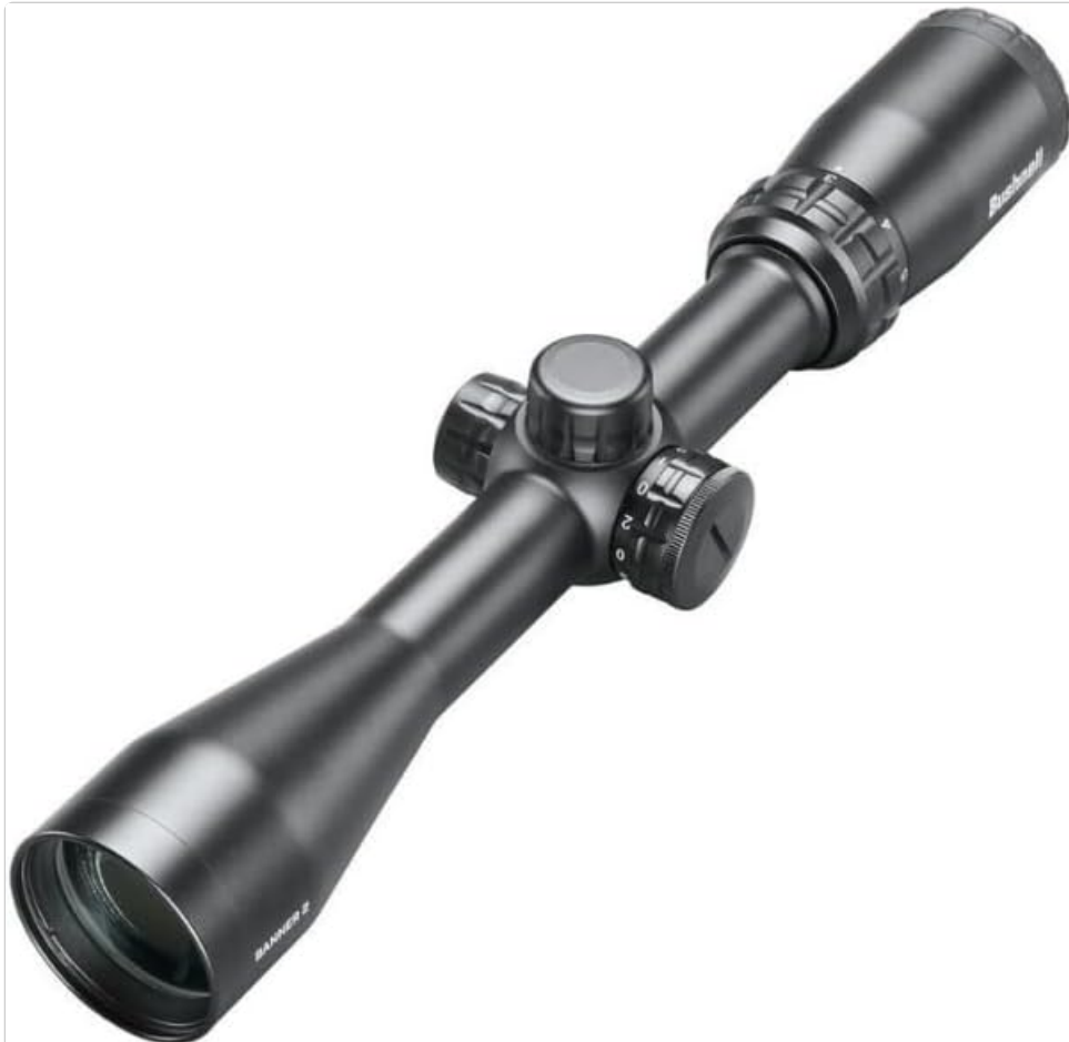
Figure 1: Bushnell Banner 2 Hunting Riflescope (3-9x40 Illuminated)

The Bushnell Banner 2 Hunting Riflescope is engineered for superior optical performance, especially in low-light conditions. This 3-9x40 illuminated model features a DOA Quick Ballistic Reticle designed for precise aiming at various distances. Its robust construction ensures reliability in demanding outdoor environments. This manual provides essential information for the proper setup, operation, maintenance, and care of your riflescope.