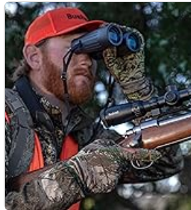
Figure 6: Bushnell Lifetime Ironclad Warranty

Bushnell products are engineered to deliver to your expectation and manufactured to withstand the rigors of the outdoors for the lifetime of the product. The Bushnell Banner 2 Riflescope is covered by the Bushnell Lifetime Ironclad Warranty.