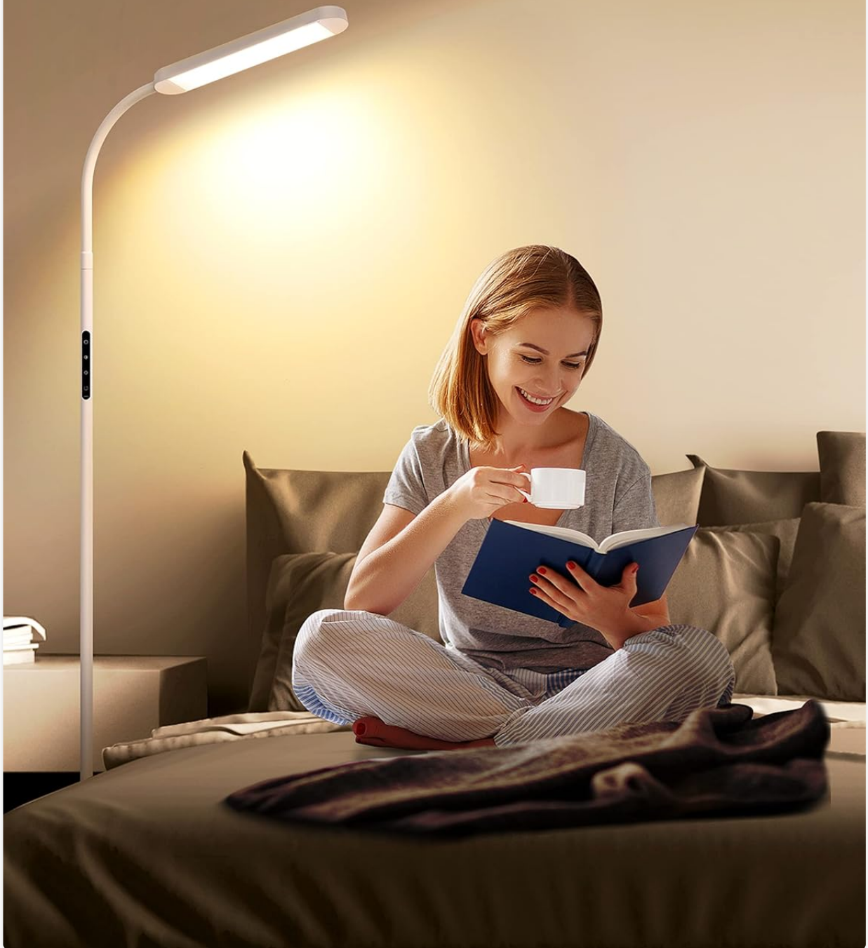
Figure 9: Eye-caring light for reading.