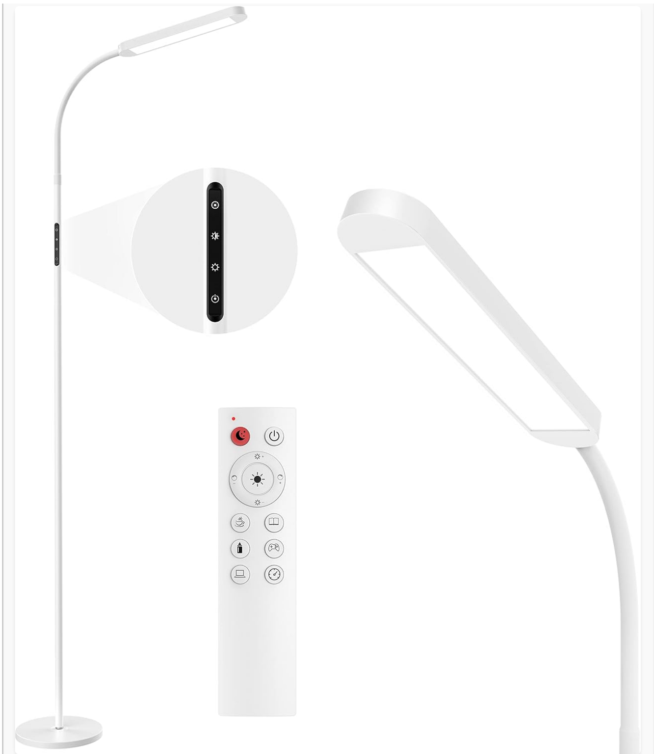
Figure 1: MediAcous LED Floor Lamp (Model ME-FL01) with remote control.