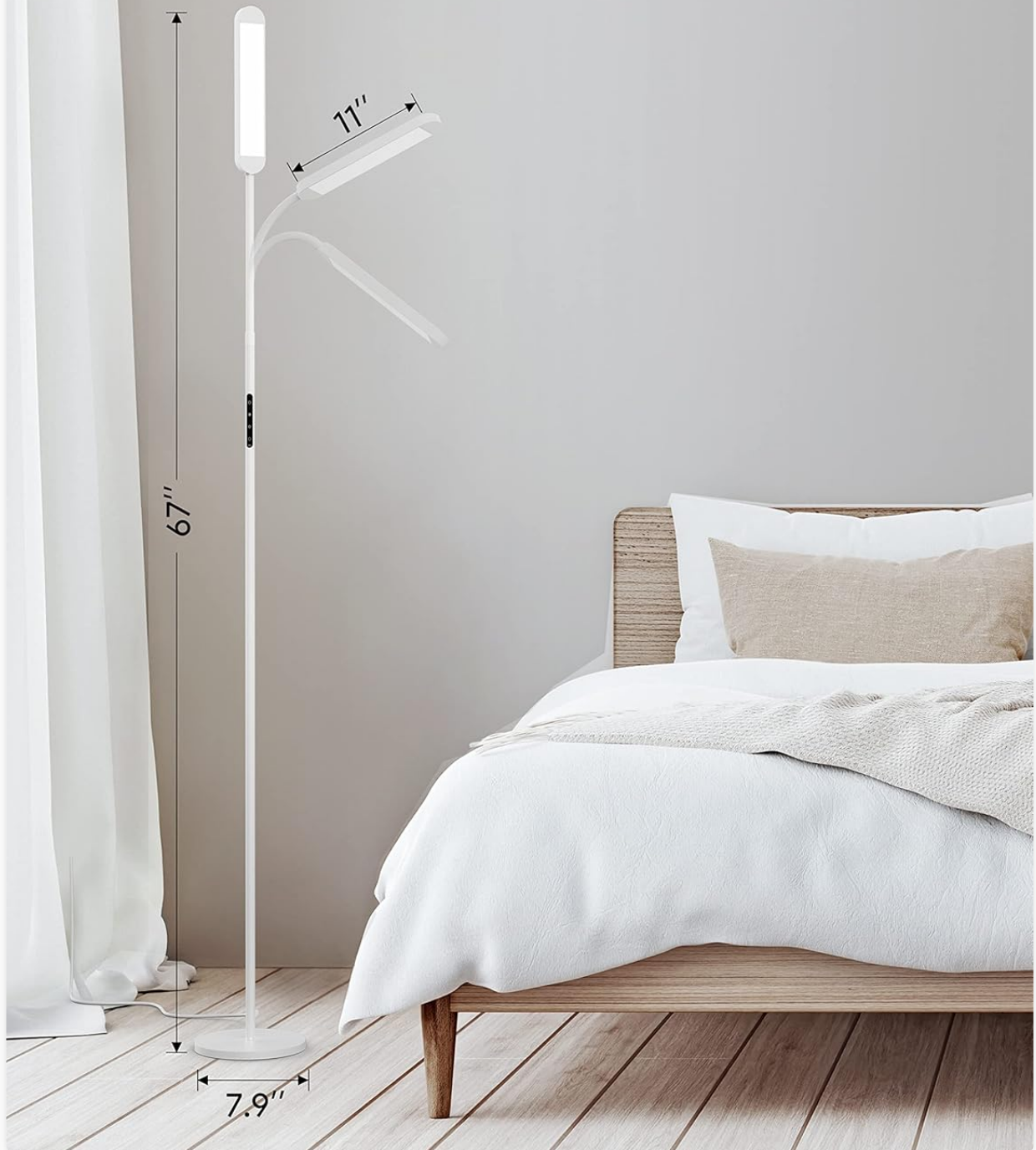
Figure 4: Demonstrating the adjustable gooseneck.