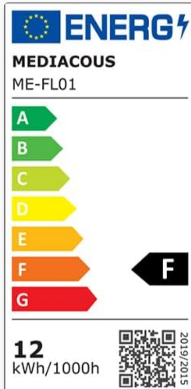
Figure 10: EU Energy Label.