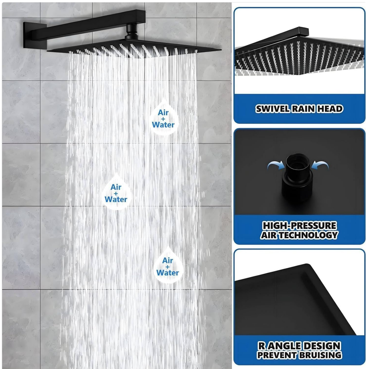
Image: The 12-inch rain shower head demonstrating water flow with air infusion technology, highlighting its swivel capability and R-angle design.