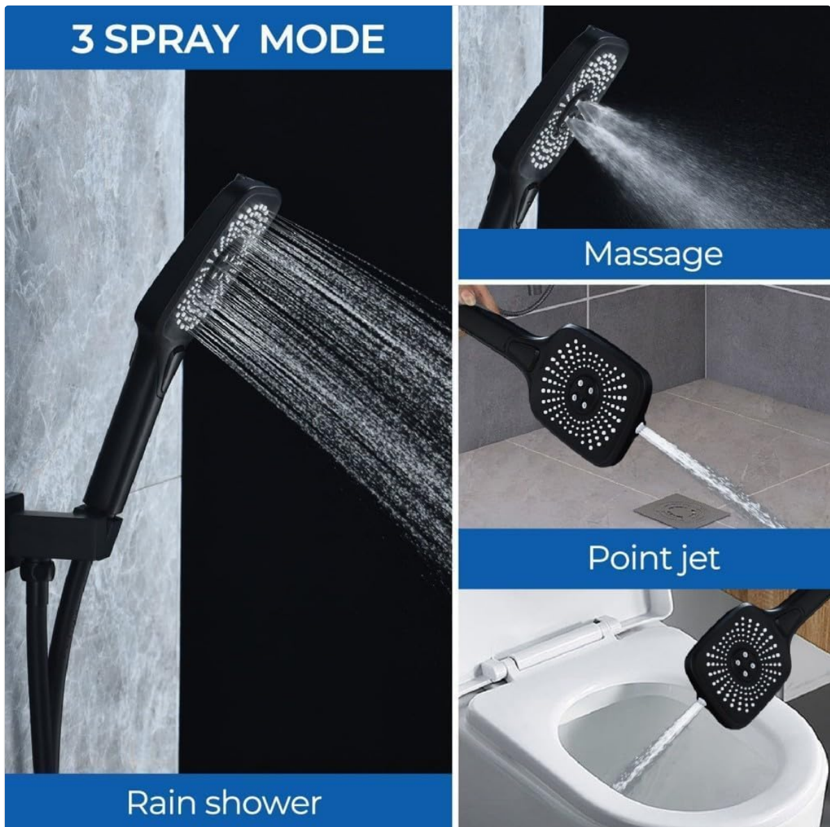
Image: The handheld sprayer showcasing its three distinct spray patterns: Rain shower, Massage, and Point jet for versatile use.