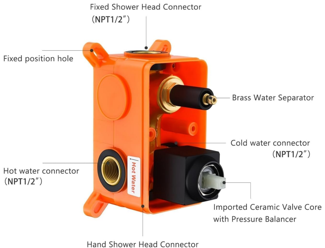
Image: Detailed view of the pressure-balanced rough-in valve, showing hot water, cold water, fixed shower head, and hand shower head connectors, along with the imported ceramic valve core.

no sudden temperature changes from toilet flushing or running appliances