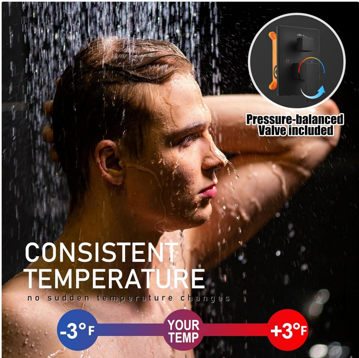
Image: Visual representation of the pressure-balanced valve's function, ensuring consistent water temperature and preventing sudden changes.