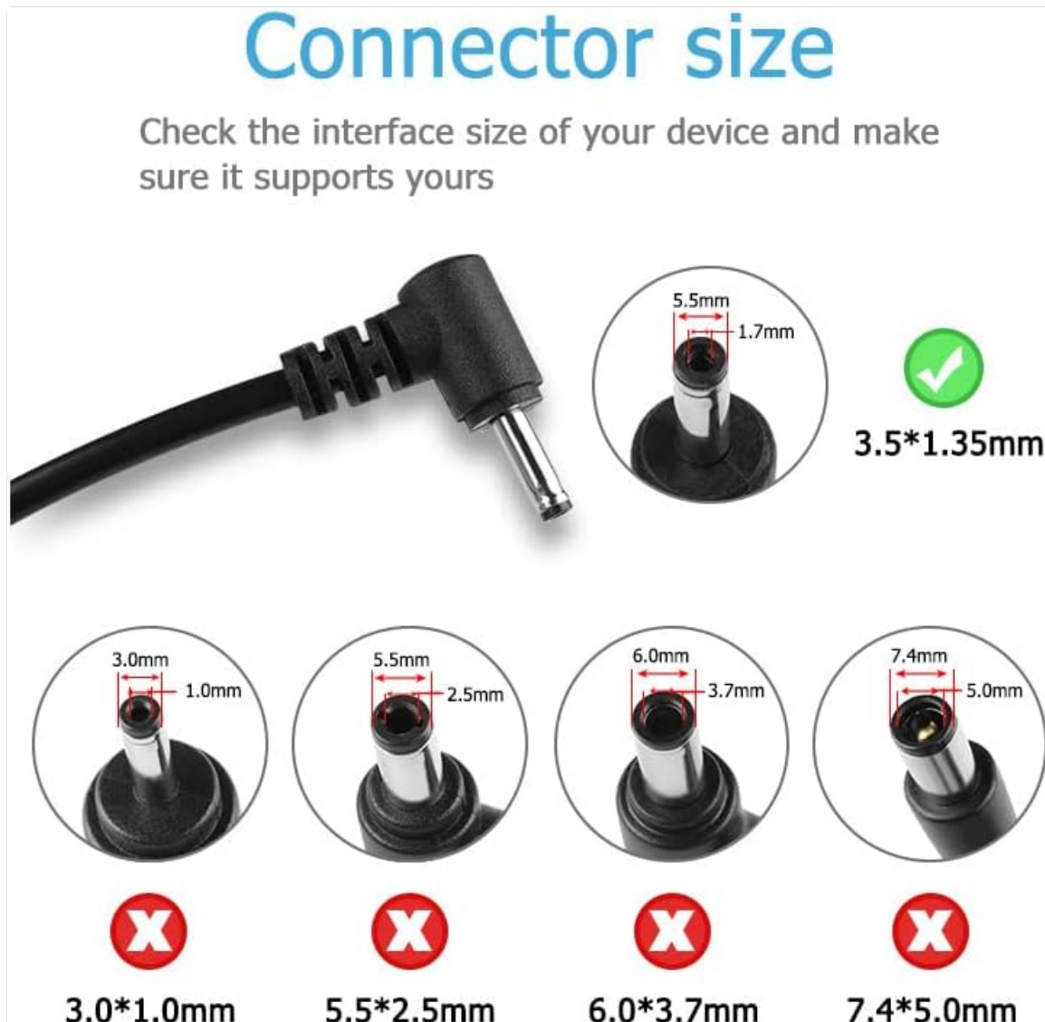
Image 3.1: Visual guide for verifying the correct connector size (3.5mm x 1.35mm).

The charger features a 3.5mm x 1.35mm barrel connector. It is crucial to confirm that this matches your device's power input port to ensure proper connection and prevent damage.