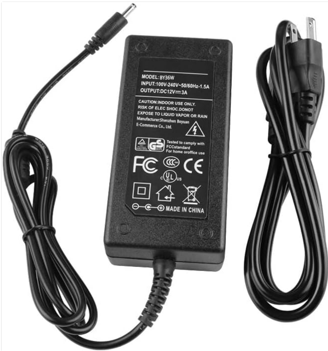
Image 1.1: The 12V 3A 36W laptop charger and its accompanying power cord.