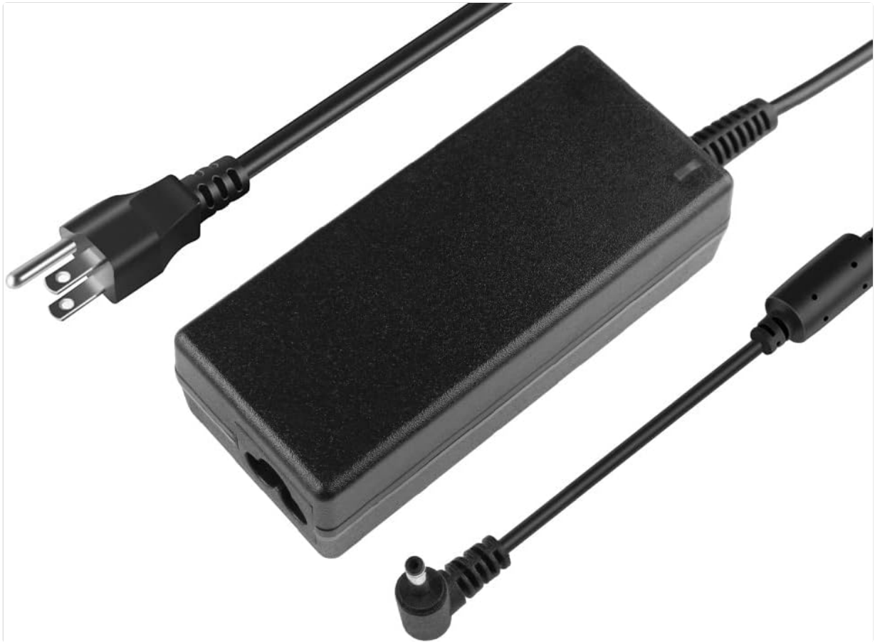
Image 1.2: A top-down view of the charger unit, showing the input and output cables.