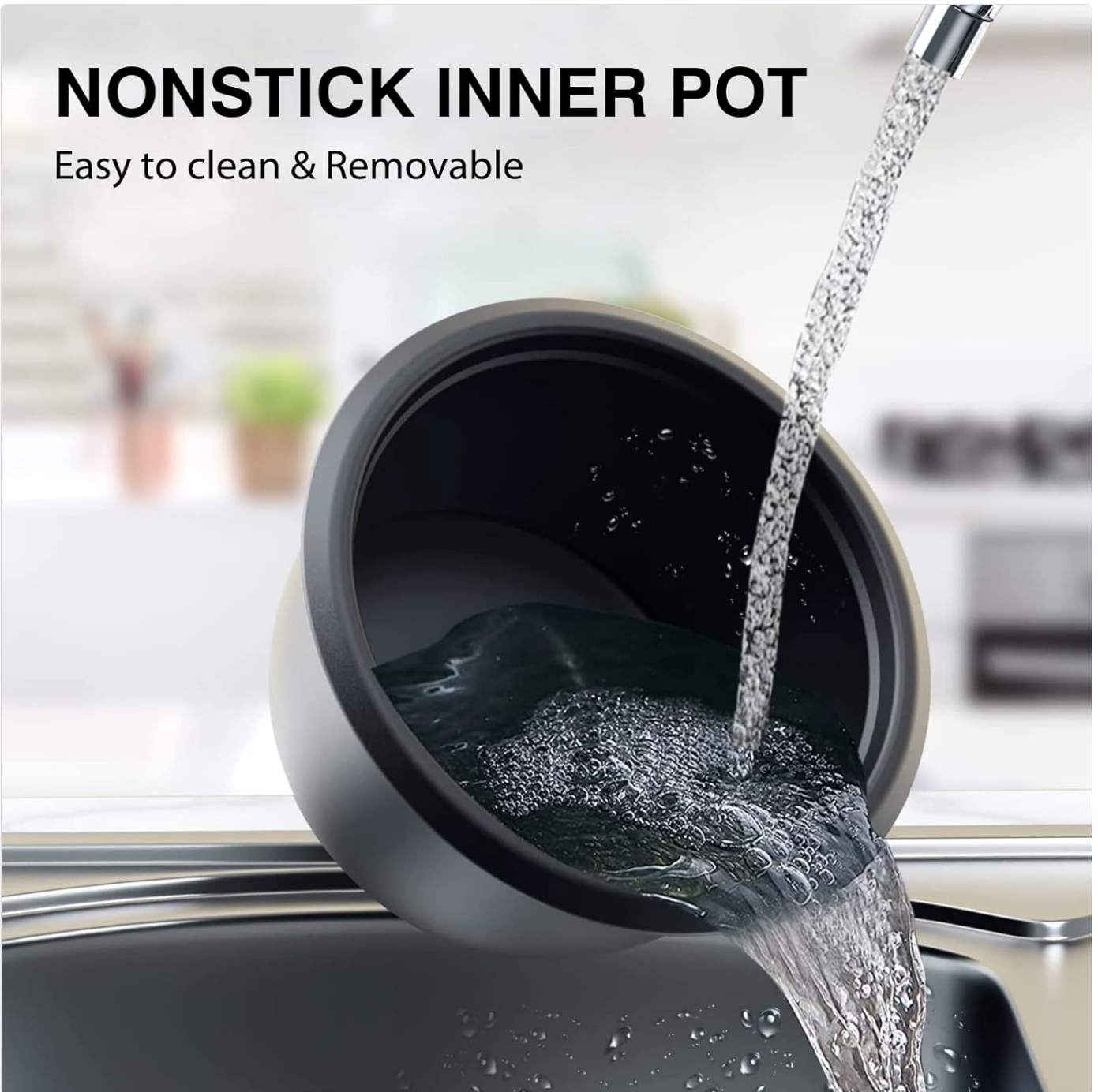
Figure 6.2: Cleaning the Non-Stick Inner Pot