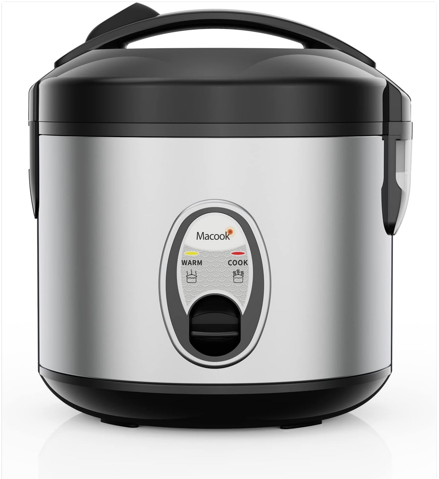
Figure 1.1: Macook Small Rice Cooker

The Macook rice cooker features smart cooking technology for consistent results, an automatic keep warm function, and a durable non-stick inner pot for easy cleaning. It is suitable for cooking rice, grains, soups, and stews, and includes a steamer insert for vegetables and other foods.