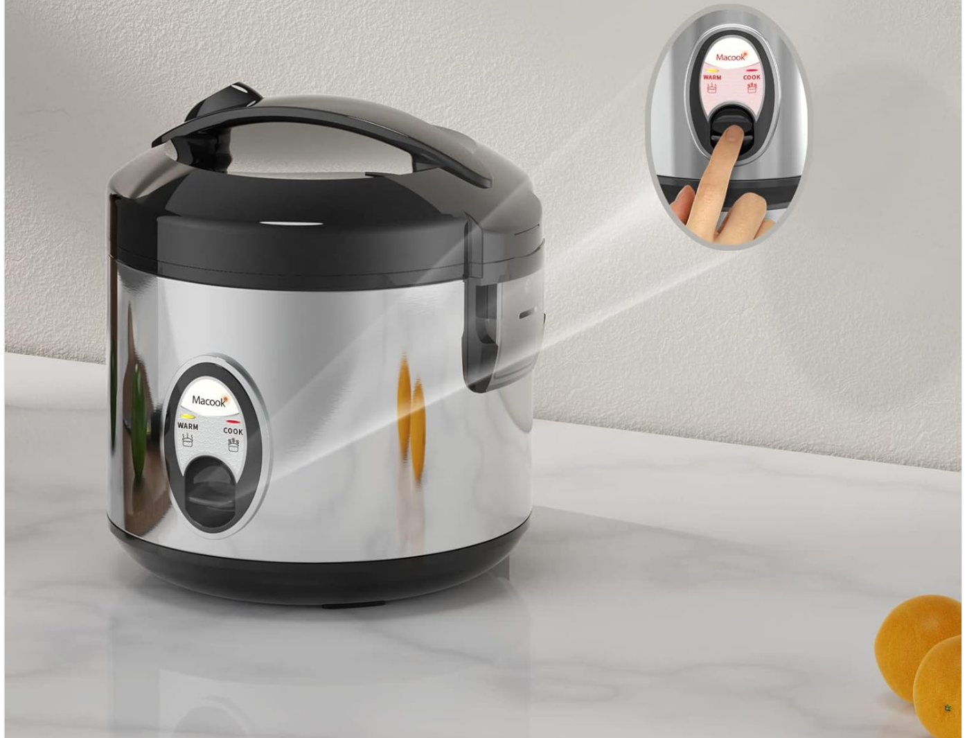
Figure 5.1: Automatic Keep Warm Function

From breakfast to dinner Full rice flavour Perfect consistency and nutrient