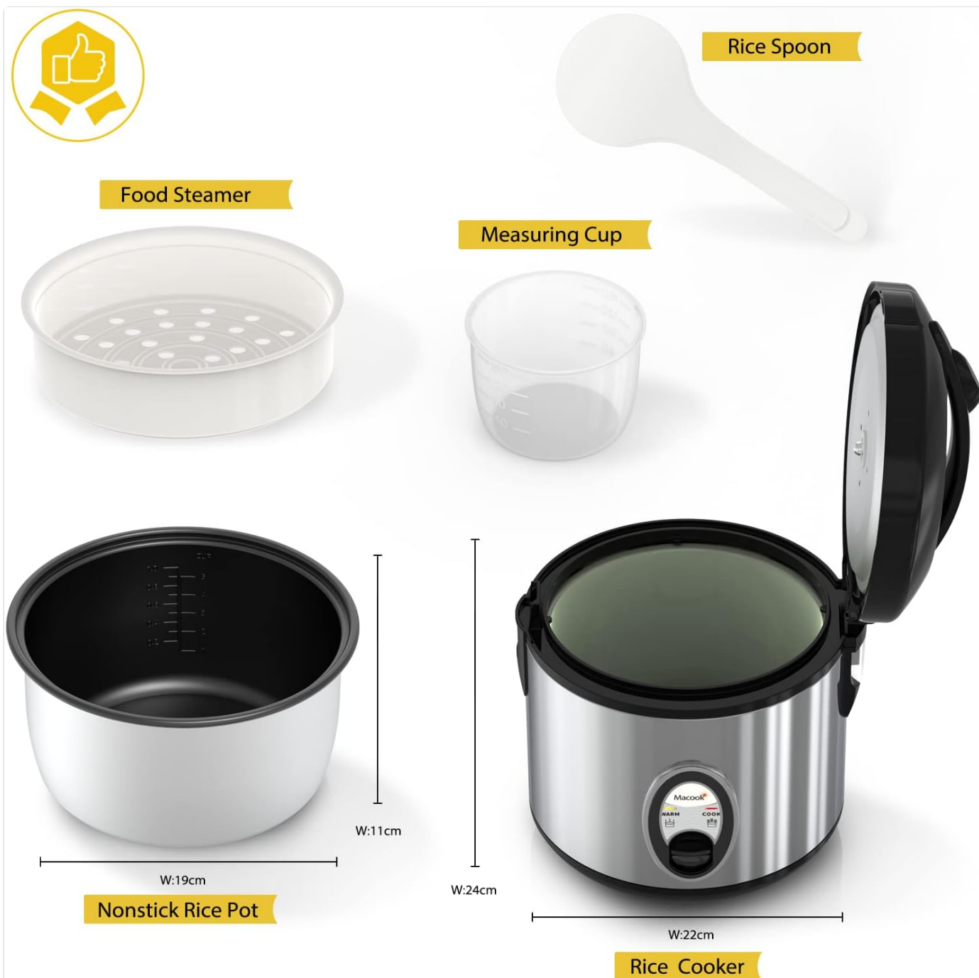
Figure 3.1: Included Components