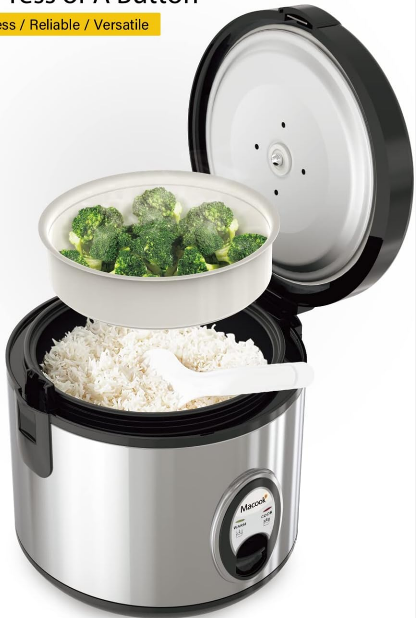
Figure 5.2: Steaming Function