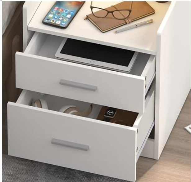
Figure 3: Integrated Charging Station