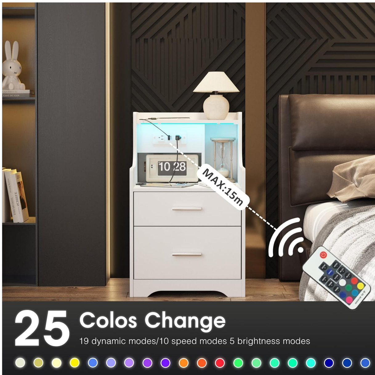
Figure 1: Assembled Vabches Nightstand