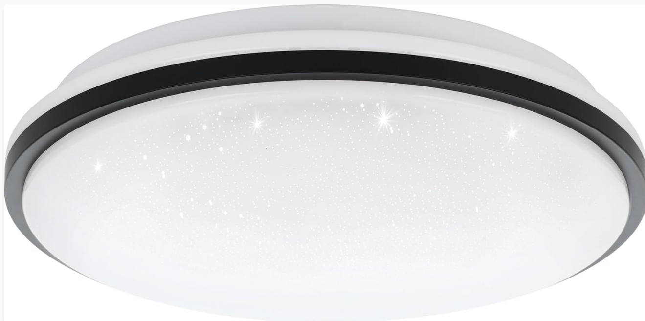
Image 1.1: The EGLO Marunella-S LED Ceiling Light, showcasing its round design with a white and black finish and a sparkling crystal effect on the diffuser.

The EGLO Marunella-S is a round LED ceiling light crafted from steel, aluminum, and plastic, featuring a white and black finish. Its design incorporates a white plastic shade that diffuses light broadly and pleasantly, creating a sparkling crystal effect. This fixture is suitable for various indoor spaces such as kitchens, offices, living rooms, bedrooms, children's rooms, and hallways.