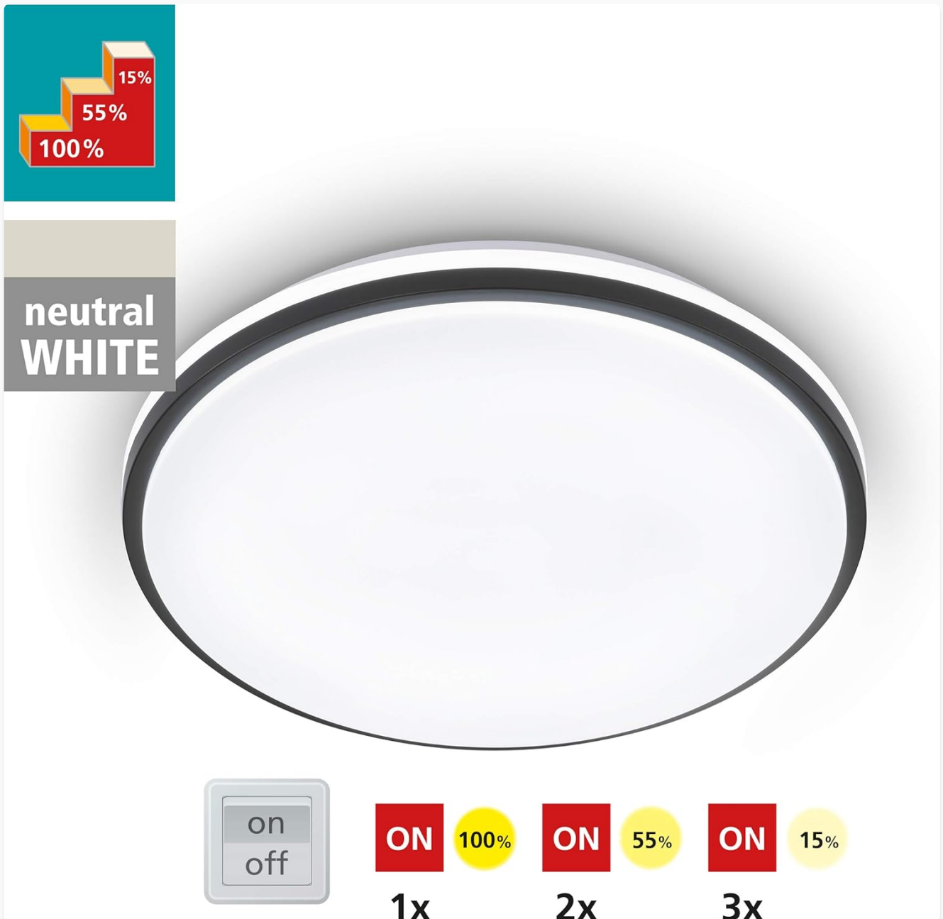
Image 4.1: Visual representation of the step-dimming feature, illustrating how successive toggles of a standard wall switch adjust the light output to 100%, 55%, and 15% brightness levels.