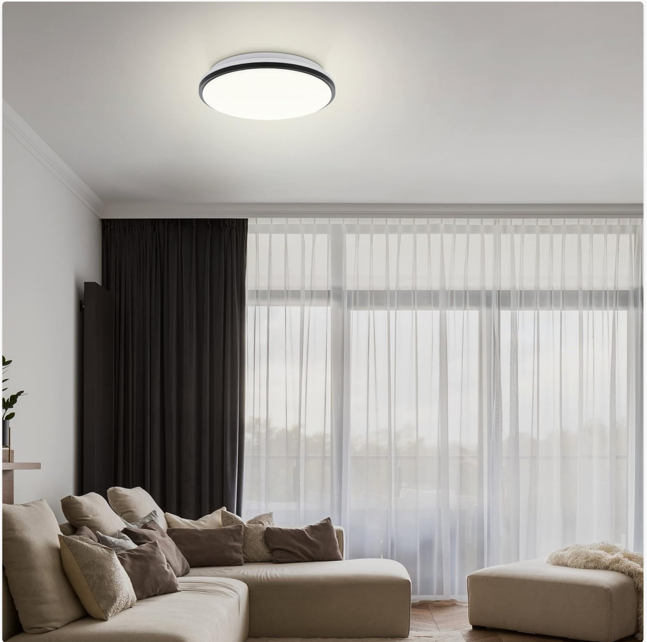
Image 3.2: The EGLO Marunella-S LED Ceiling Light seamlessly integrated into a modern living room setting, demonstrating its aesthetic appeal once installed.