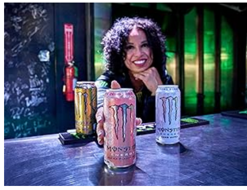
Image 6: Monster Energy Zero Ultra can. A generic image of a Monster Energy Zero Ultra can, representing the broader sugar-free Ultra line.