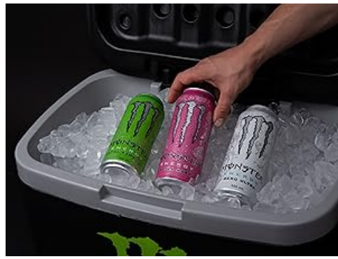
Image 7: Monster Energy Ultra Cooler. An image showing various Monster Ultra cans in a cooler with ice, emphasizing the refreshing aspect.