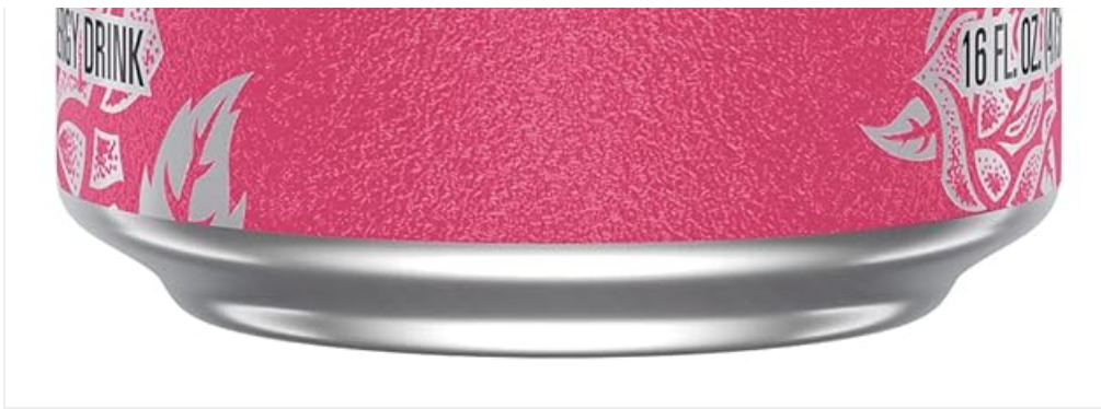
Image 3: Single Monster Energy Ultra Rosa can. A detailed close-up of an individual 16-ounce can, showing the design and product name.