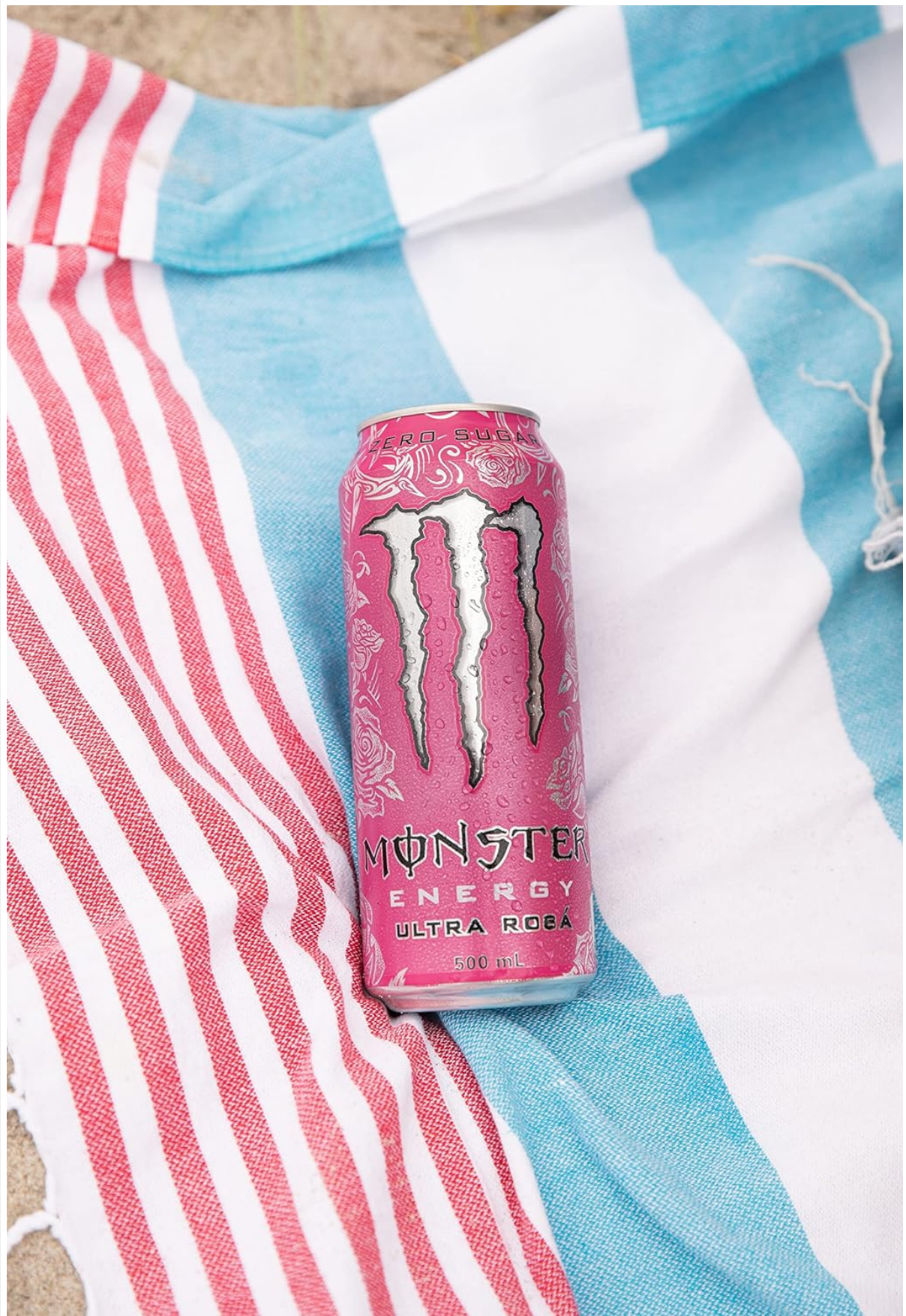
Image 5: Monster Energy Ultra Rosa can on a striped towel. A lifestyle image showing a single can placed on a colorful striped towel, suggesting refreshment.