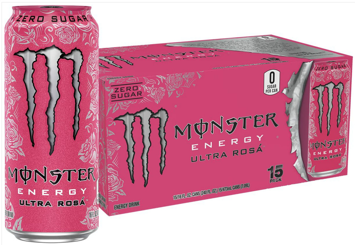
Image 1: Monster Energy Ultra Rosa 15-pack. This image displays the full 15-pack of Monster Energy Ultra Rosa cans, showcasing the vibrant pink packaging and the Monster logo.