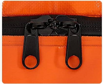
Waterproof Zippers with Lock Holes

Image: Detailed view of the carrier's triple-layer 700D PVC material, extended rain curtain, and waterproof zippers with lock holes, highlighting its robust waterproof design.