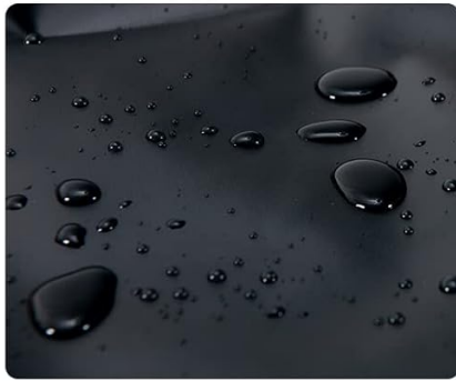
3 Layers 700D Waterproof PVC