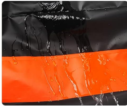
4.3" Extended Rain Curtain