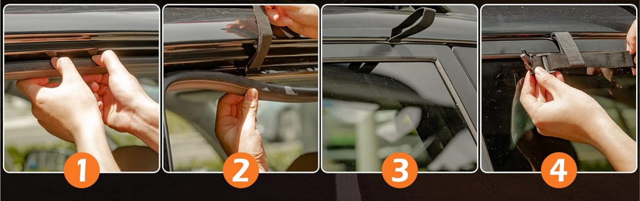
Image: A visual guide demonstrating the four steps for easy installation without a roof rack, showing how to attach the straps and door hooks.