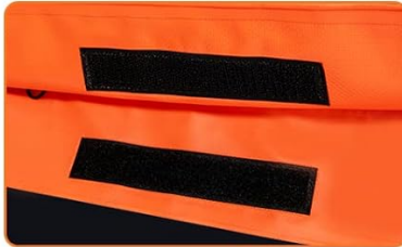
Hook and Loop Fasteners