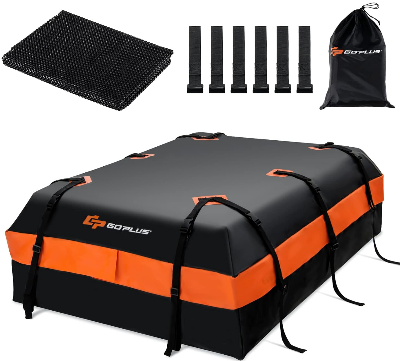
Image: The Goplus Rooftop Cargo Carrier, showcasing the main bag, anti-slip mat, straps, and storage bag.