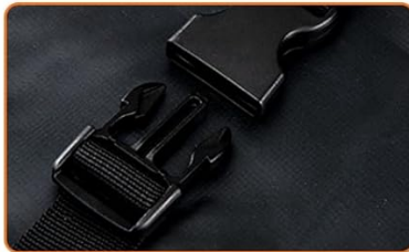
10 Reinforced Adjustable Straps and Buckles