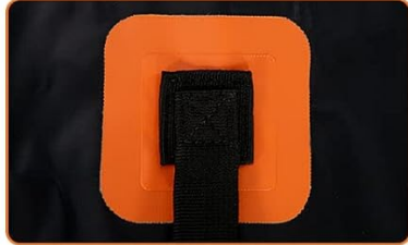
Well-stitched 4-ply Strap Seams