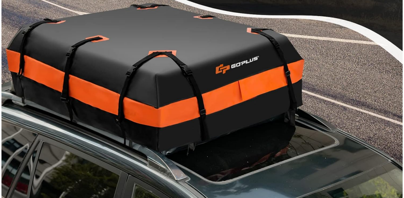
Image: An illustration demonstrating how the cargo carrier fits various vehicle types, including those with and without roof racks, such as pickups, SUVs, sedans, and minivans.