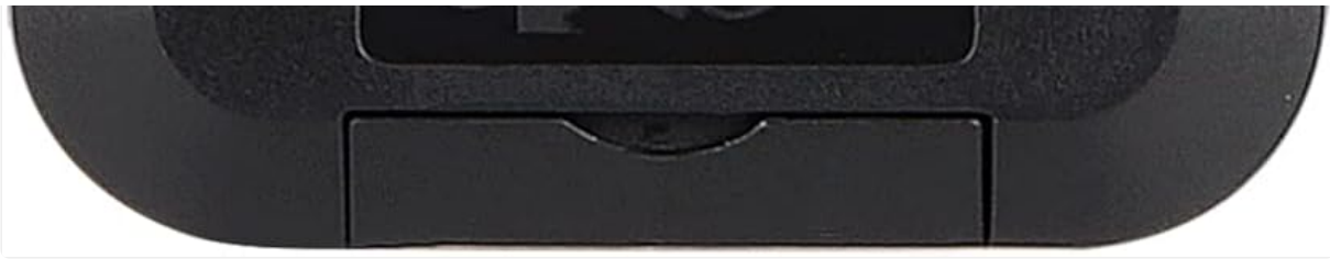
Image 3.1: Back view of the remote control, illustrating the battery compartment and proper battery insertion.