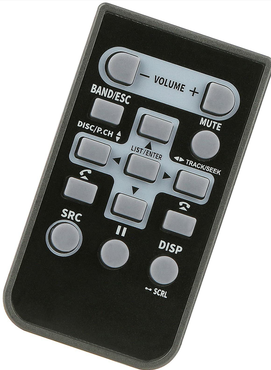
Image 2.1: Front view of the CXE9605 remote control, displaying its button layout.