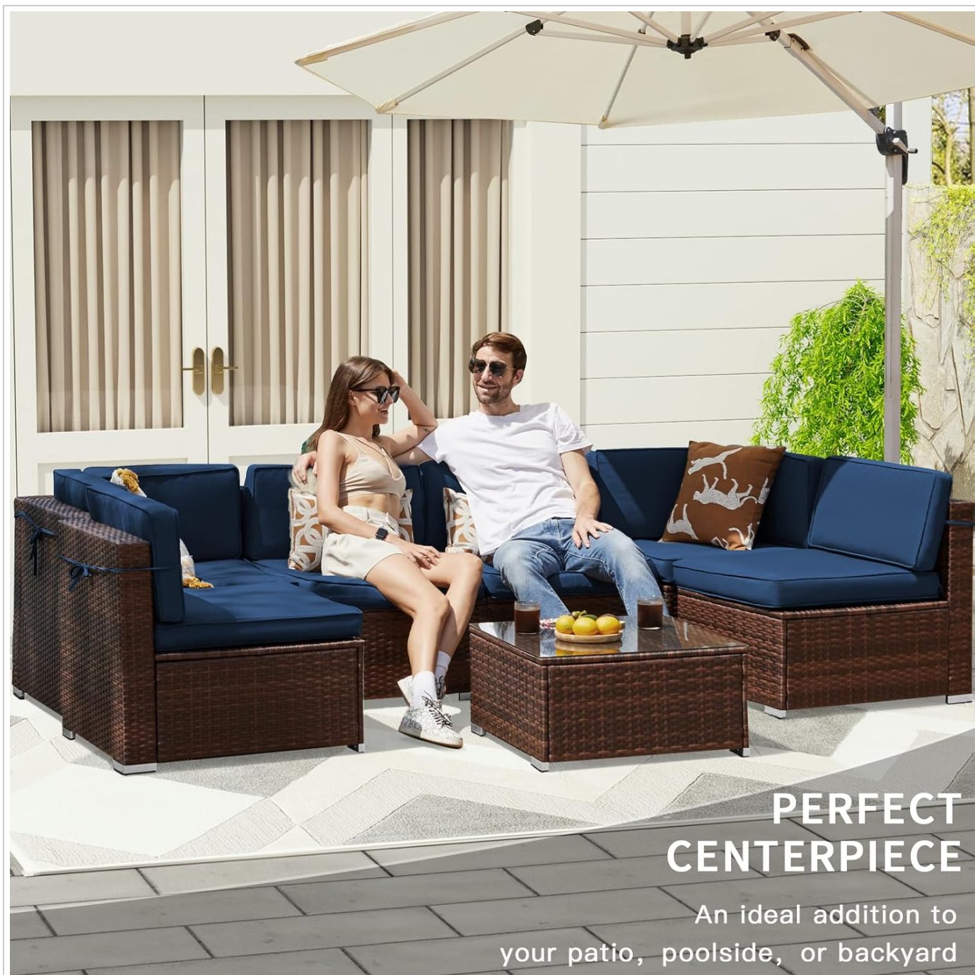
Image: A lifestyle image showing a couple enjoying the comfortable and versatile UDPATIO patio furniture set in an outdoor setting.