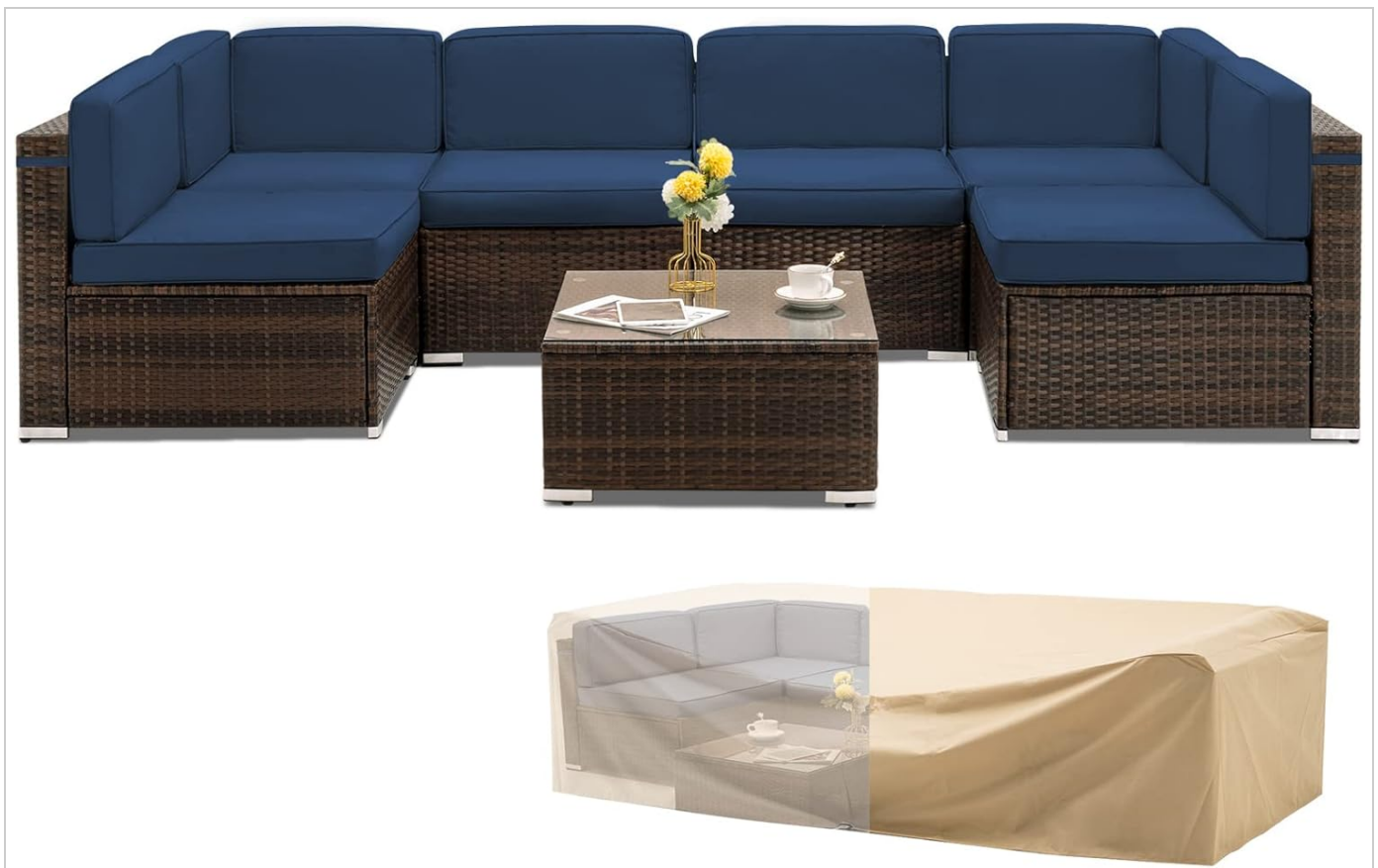
Image: The complete 7-piece outdoor patio furniture set, featuring a sectional couch with navy blue cushions and a matching coffee table.

This manual provides comprehensive instructions for the assembly, operation, maintenance, and troubleshooting of your UDPATIO 7-Piece Outdoor Sectional Couch. Please read this manual thoroughly before assembly and use to ensure proper function and longevity of your furniture set.