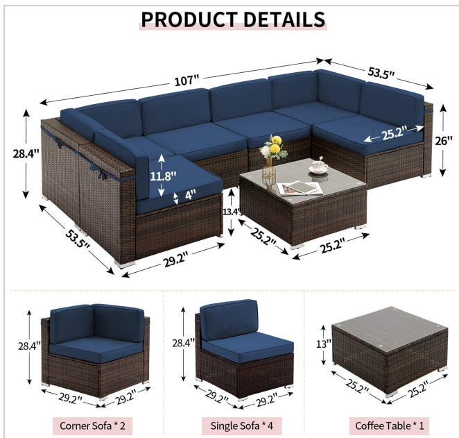
Image: A detailed diagram illustrating the dimensions of each component of the patio furniture set, including corner sofas, single sofas, and the coffee table, to aid in planning and arrangement.