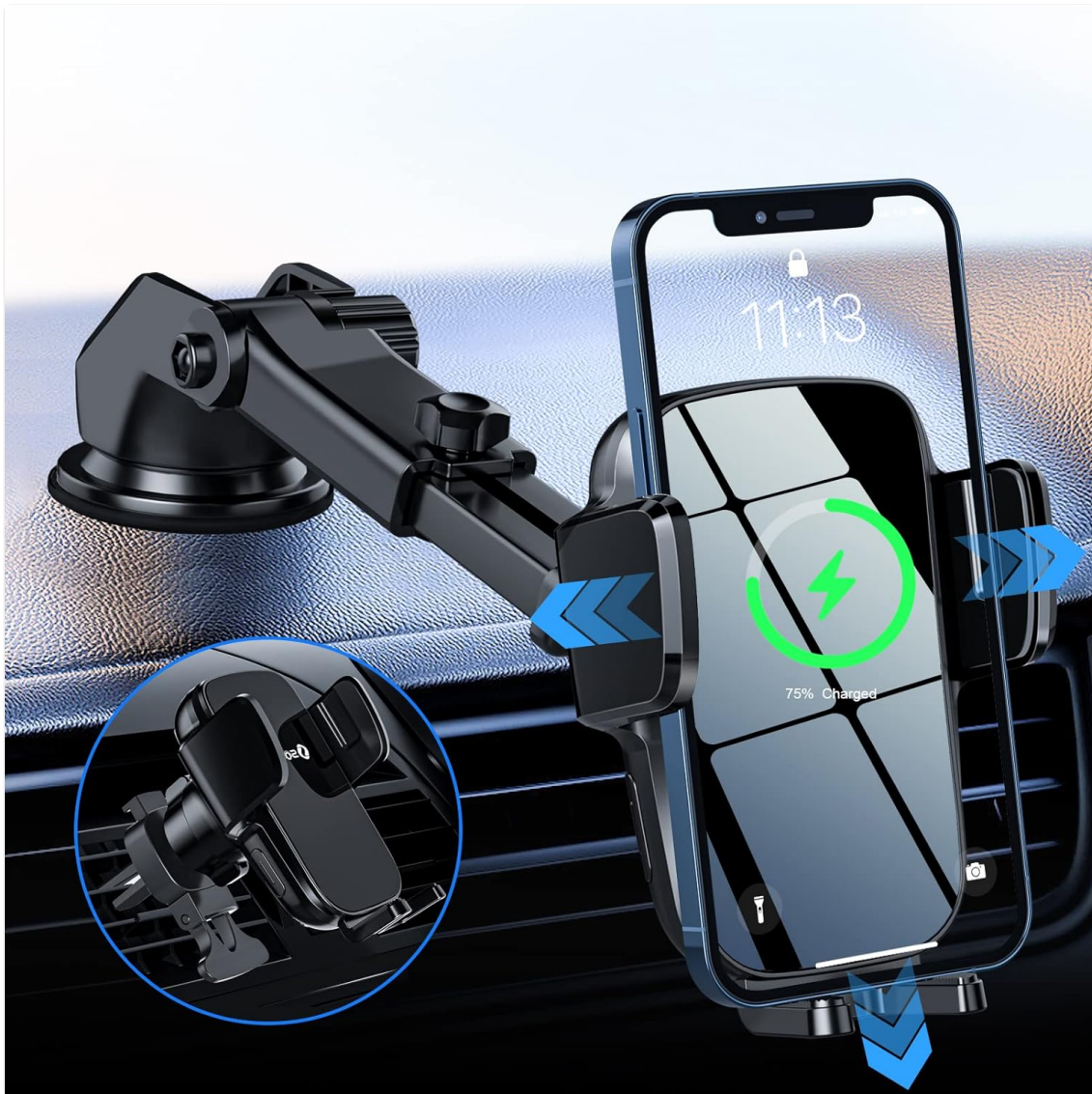
Image 4.1: Overview of the SONRU Wireless Car Charger Mount, showing both the suction cup and air vent mounting options.

The SONRU WP20-C features an intelligent auto-clamping mechanism and 15W fast wireless charging. It includes an extendable and rotatable arm for flexible positioning.