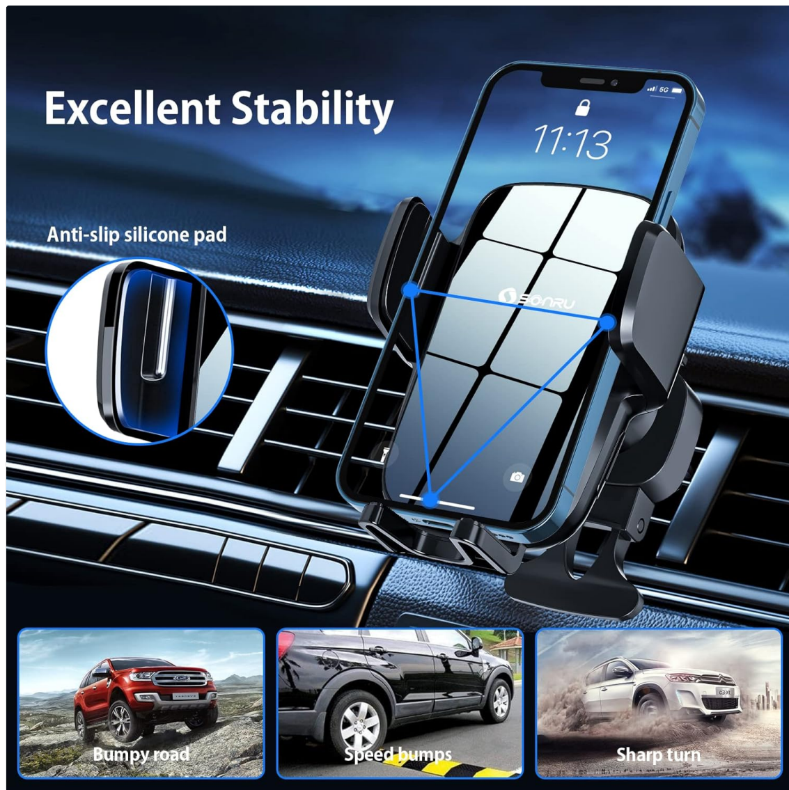
Image 5.3: The air vent mount provides excellent stability for the phone holder, even during vehicle movements like bumpy roads or sharp turns.