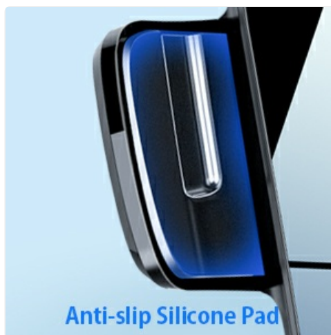
Image 7.1: The anti-slip silicone pads on the clamping arms help secure the phone and prevent scratches.