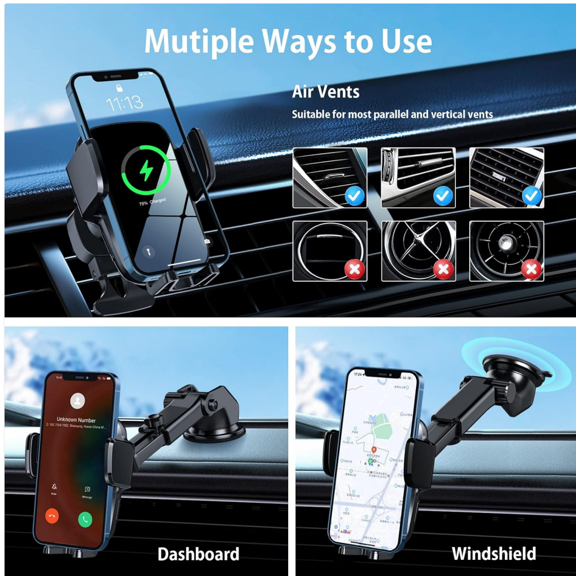
Image 5.1: Various mounting options including air vent, dashboard, and windshield.

a clear view of your phone without obstructing your driving view or vehicle controls.