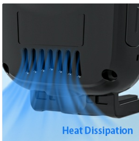
Image 7.2: The charger features heat dissipation vents to maintain optimal operating temperature during charging.