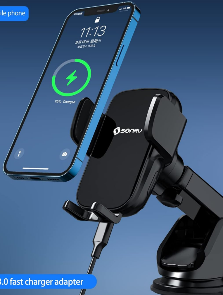
Image 6.2: Wireless charging compatibility and power output for various phone models (e.g., 15W for Huawei/LG, 10W for Samsung, 7.5W for iPhone, 5W for other Qi-enabled phones).

Note: Please use QC 3.0 fast charger adapter