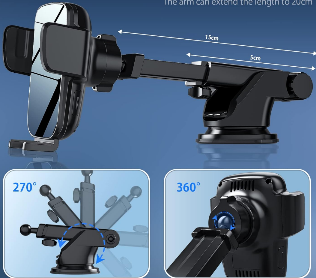
Image 6.4: The mount's arm can extend up to 20cm and features a 360° rotatable ball joint for versatile positioning.