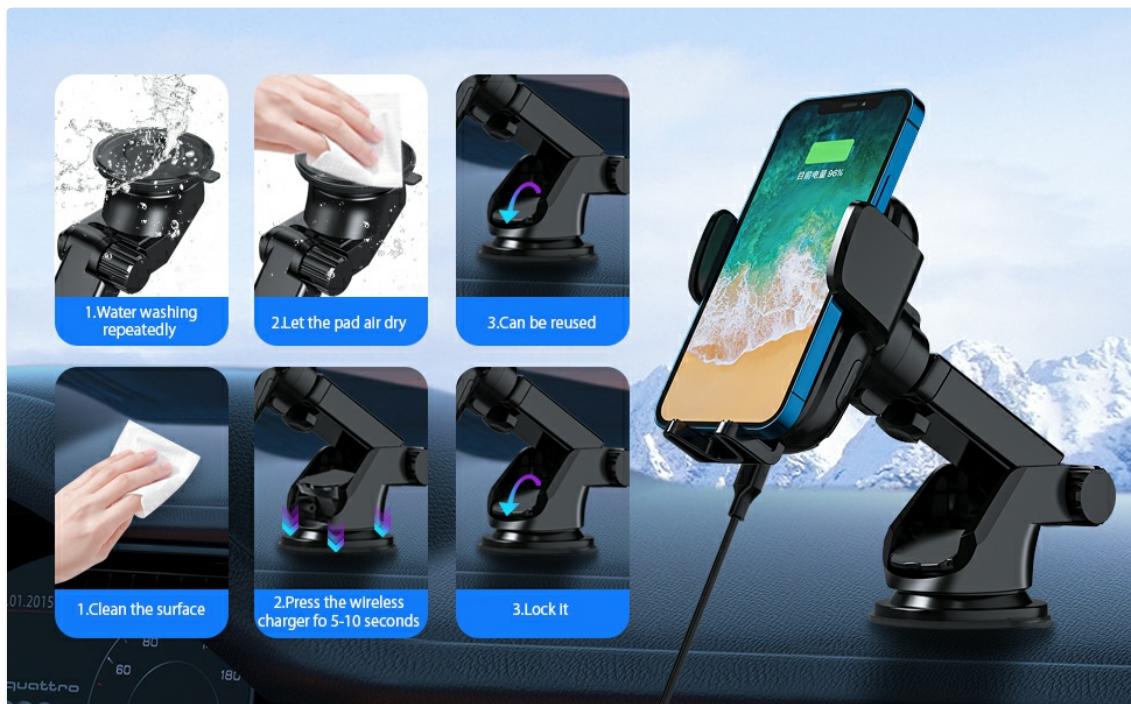
Image 5.2: Detailed steps for installing the suction cup mount, including cleaning the surface and locking the suction mechanism. The suction cup can be washed and reused.