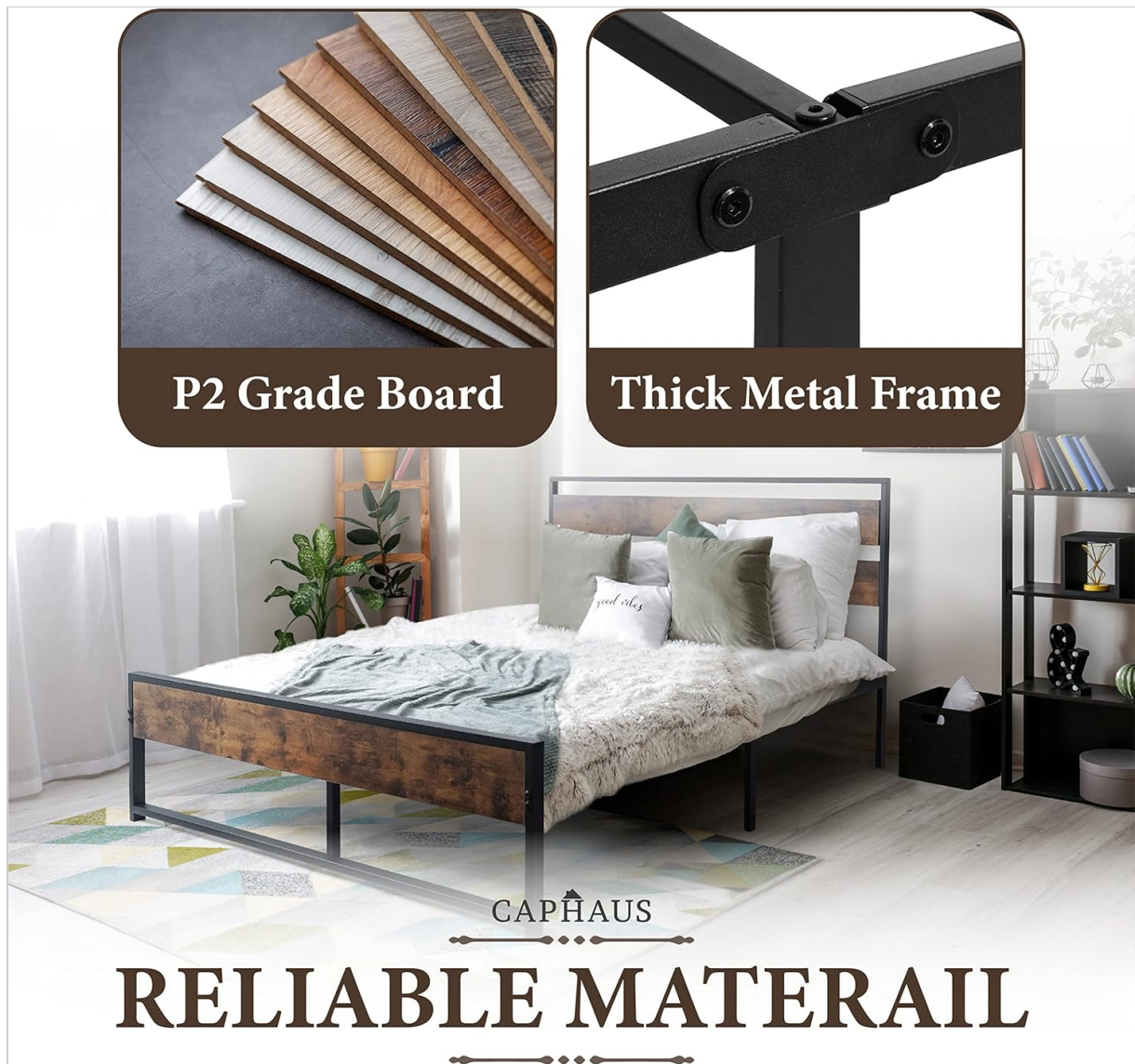
Image 2.1: Components include P2 Grade Board and Thick Metal Frame for durability.