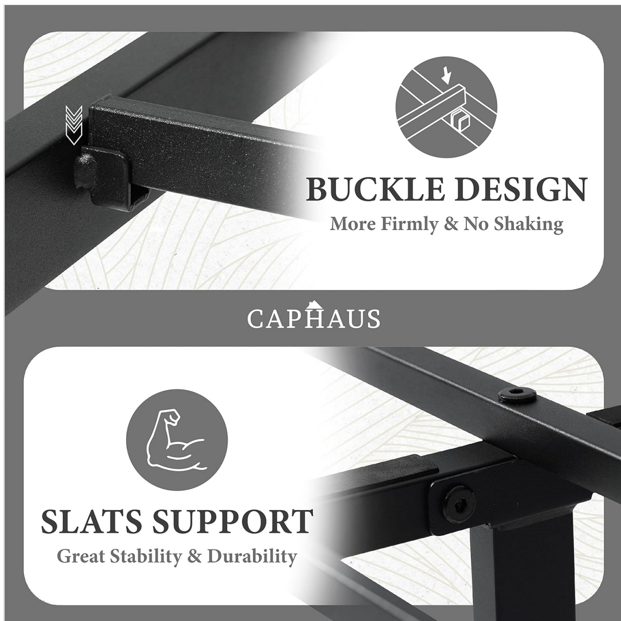
Image 3.1: Detail of the buckle design for firm connections and robust slat support for mattress stability.