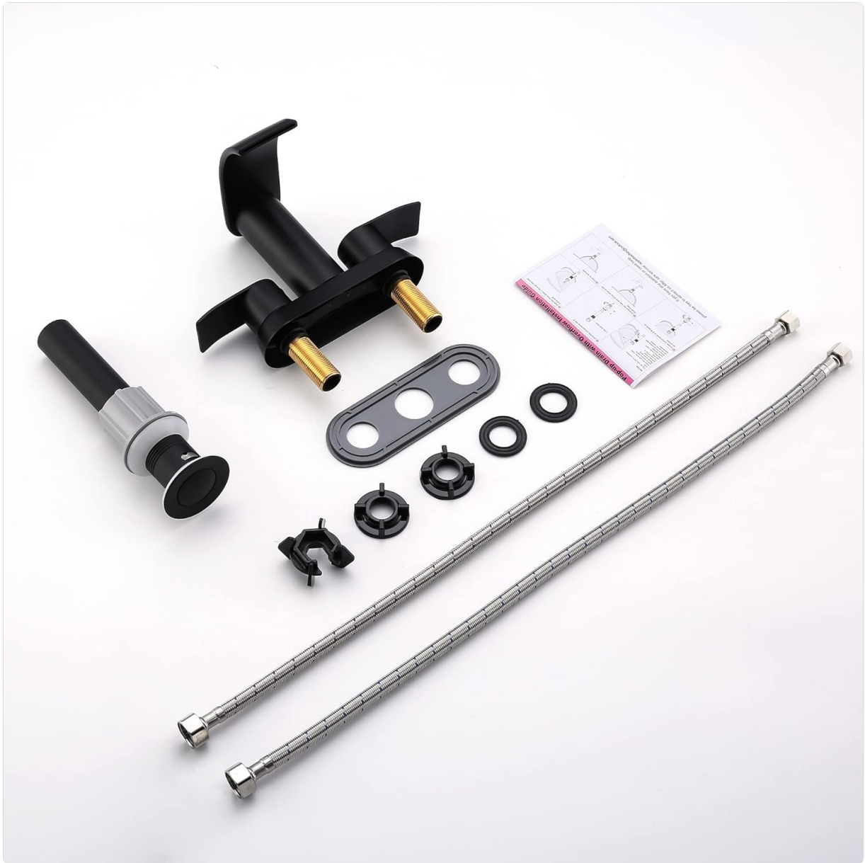
Image: All components included in the package, including the faucet body, handles, pop-up drain, and supply lines.