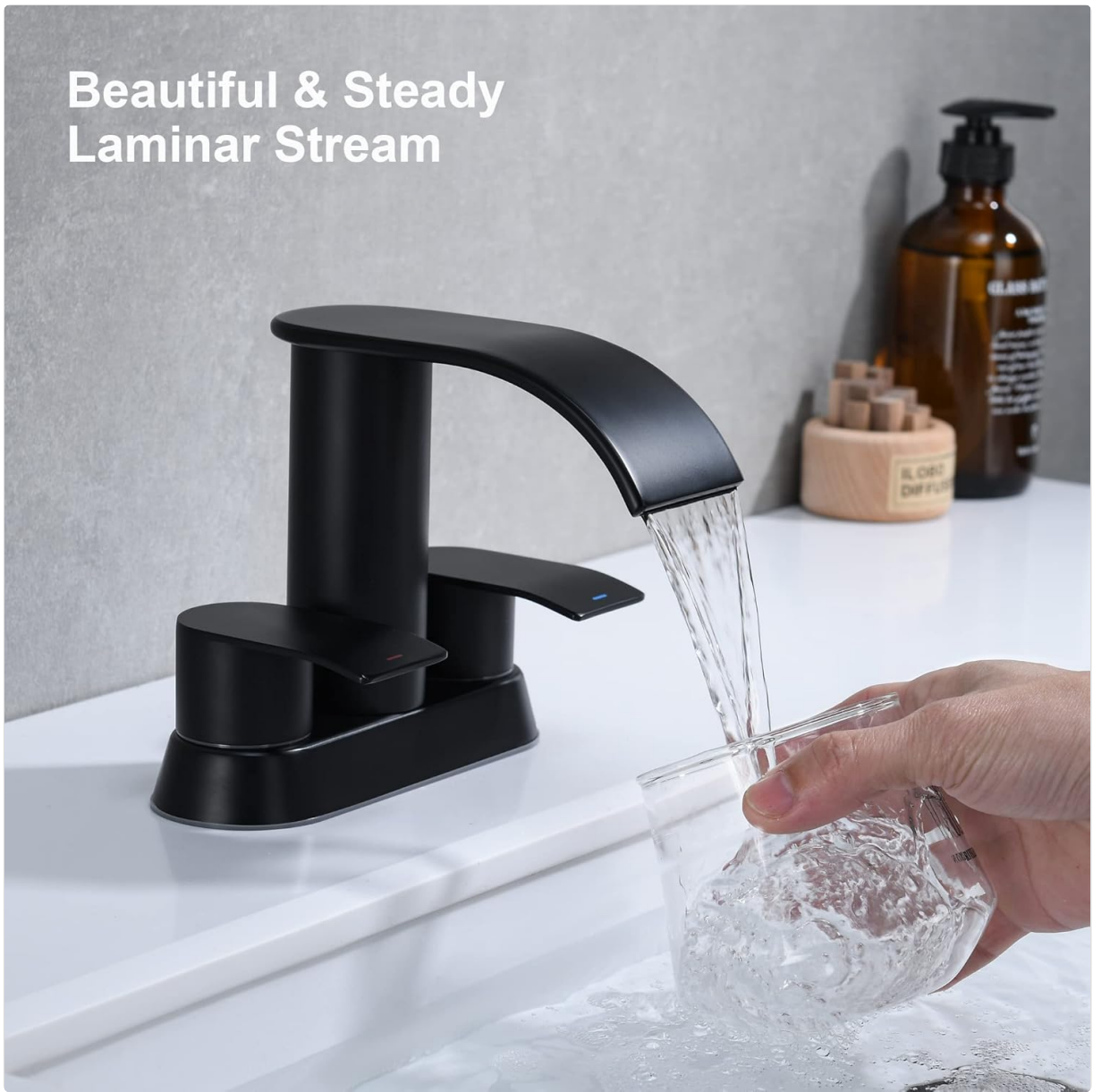
Image: The faucet delivering a beautiful and steady laminar stream of water into a glass.