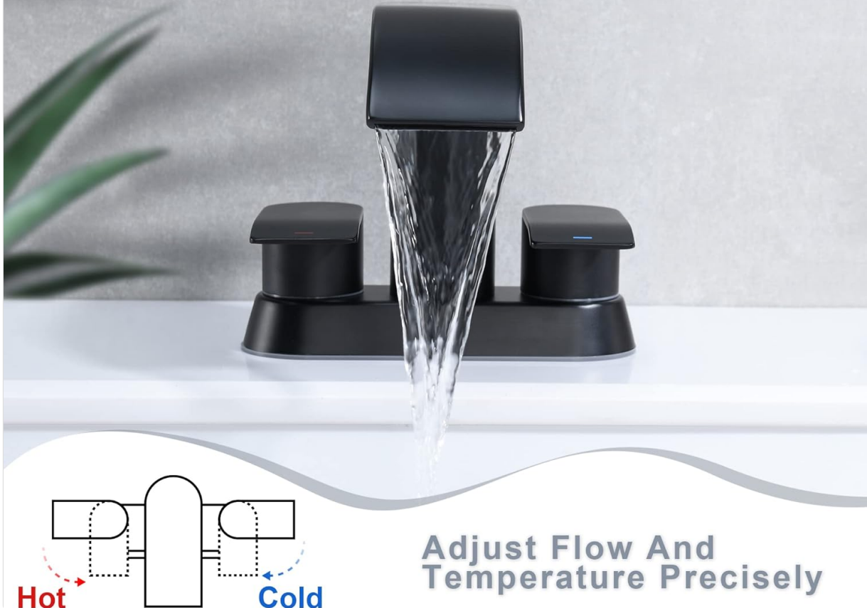
Image: Diagram illustrating how the two lever handles control hot and cold water flow for precise temperature adjustment.