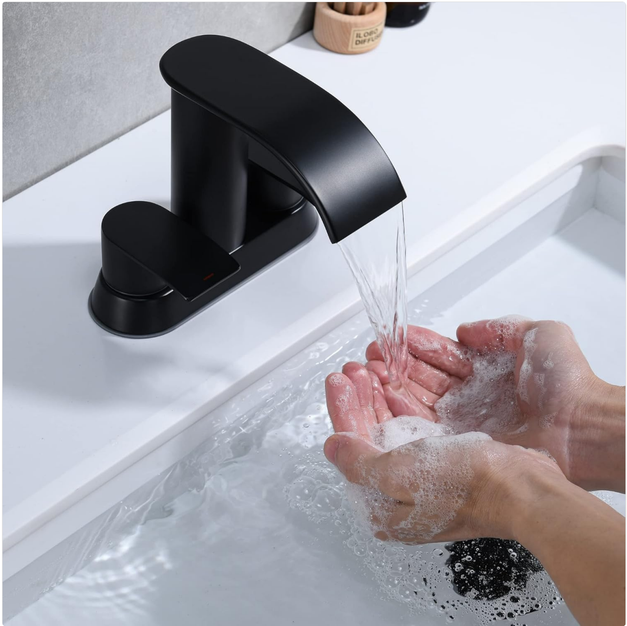
Image: The wide waterfall spout providing ample coverage for hand washing.