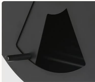
Air inlet passage