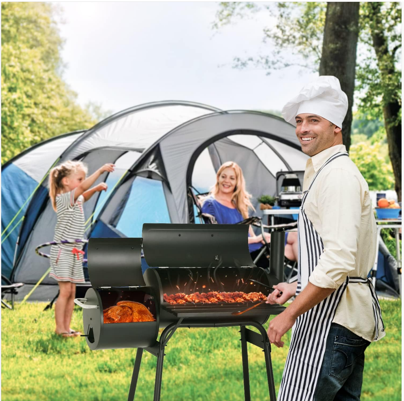
Figure 4.4: An individual operating the Dopinmin charcoal grill, demonstrating its use for cooking various foods.