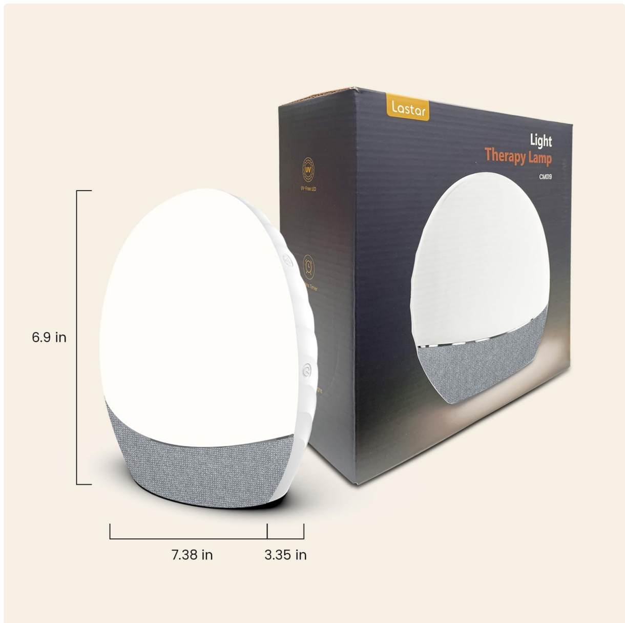
Figure 3.1: LASTAR Light Therapy Lamp, power adapter, and user manual.