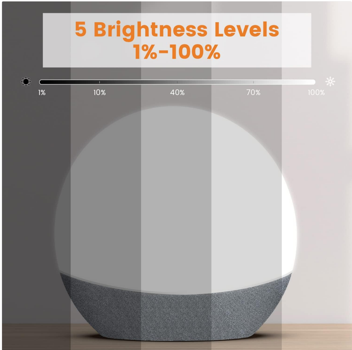
Figure 5.1: Visual representation of the 5 adjustable brightness levels.

The lamp offers 5 brightness levels (1%, 10%, 40%, 70%, 100%). Use the '+' and '-' touch buttons on the back of the lamp to increase or decrease the brightness. Each tap cycles through the available levels.