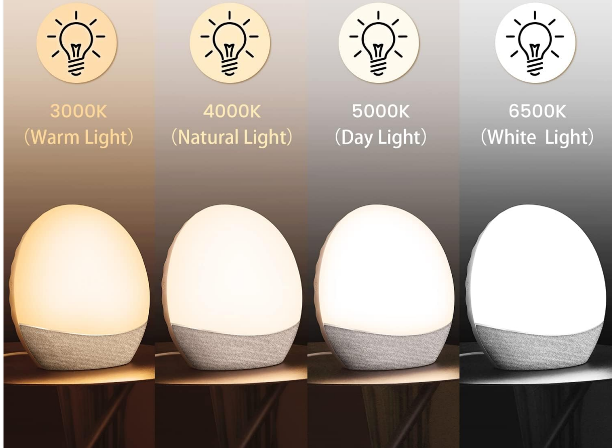
Figure 5.2: Illustration of the four available color temperature options.