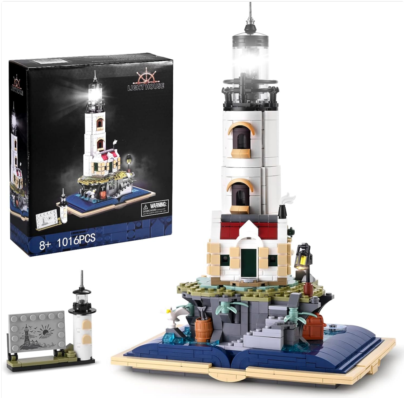
Image: The IKUPER Lighthouse Building Kit, showing the assembled model alongside its retail packaging.