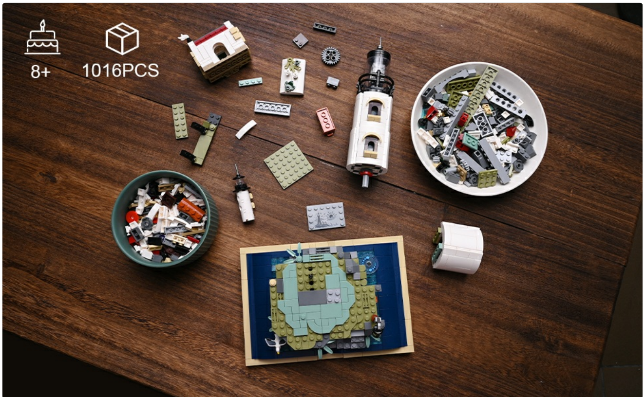
Image: An aerial view of various building blocks and components of the lighthouse kit laid out on a wooden table, ready for assembly.