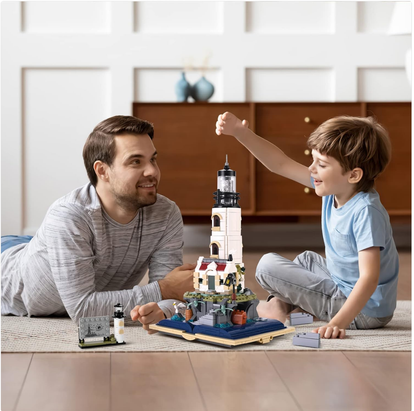
Image: A father and child happily engaged in assembling the lighthouse building kit together on the floor.