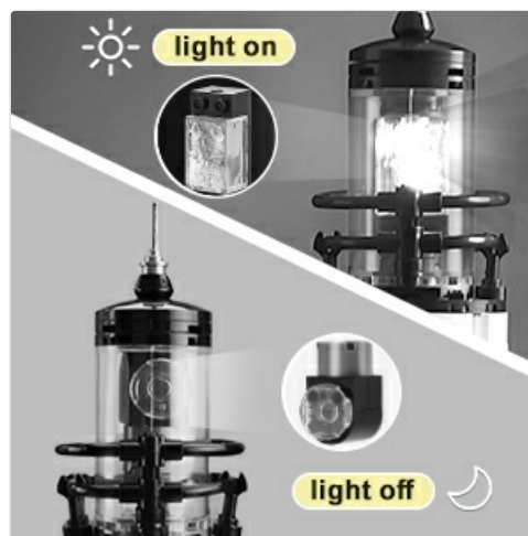
Image: Comparison image showing the lighthouse light in both "light on" and "light off" states, demonstrating its illumination feature.