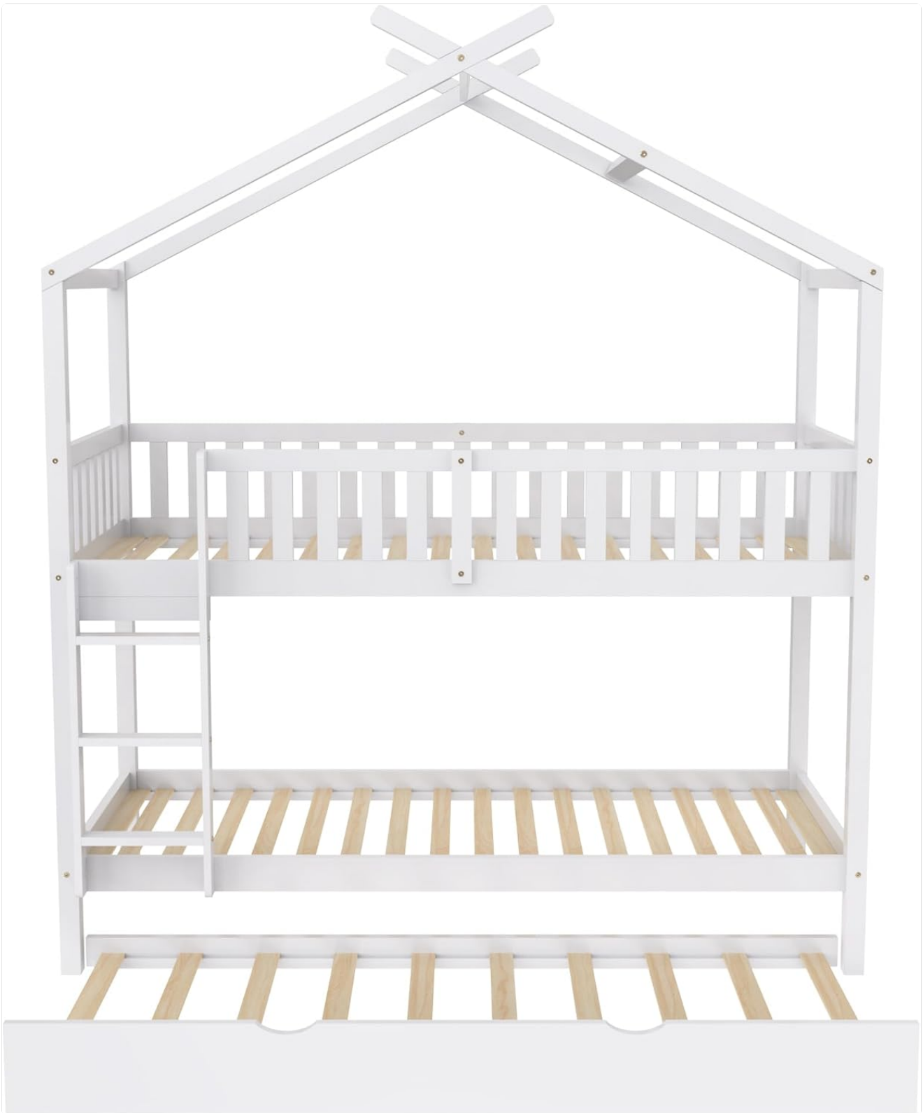
Image: Front view of the Moimhear House Bed, showcasing the bunk bed structure and trundle bed.