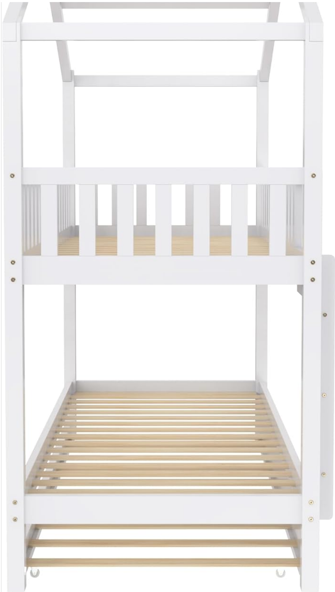
Image: End view of the Moimhear House Bed, highlighting the ladder and overall structure.