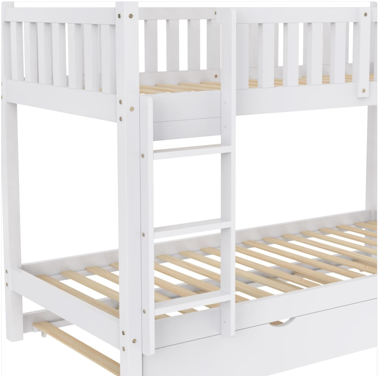
Image: Close-up view of the integrated ladder and the pull-out trundle bed mechanism.