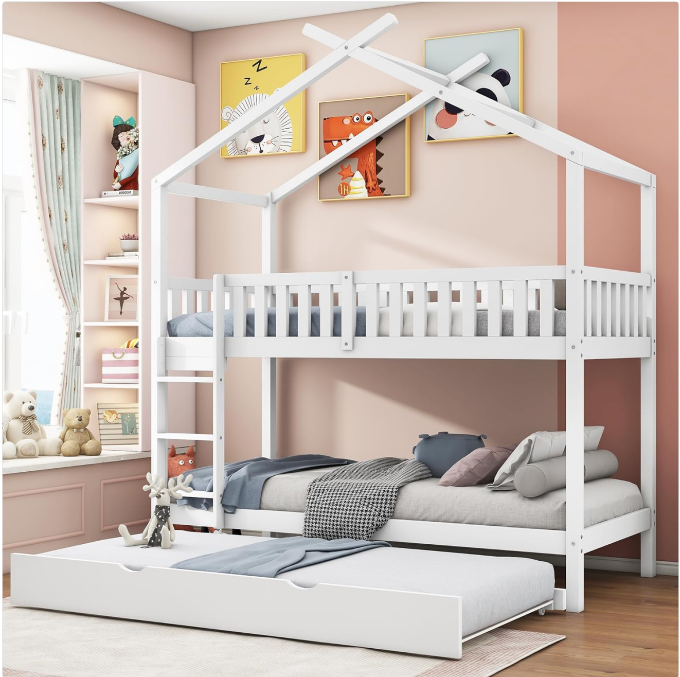
Image: The Moimhear House Bed with trundle bed extended, shown in a decorated child's room.

reassemble the components into three standalone beds. This process typically involves removing the upper bunk from the lower bunk and detaching the trundle bed.