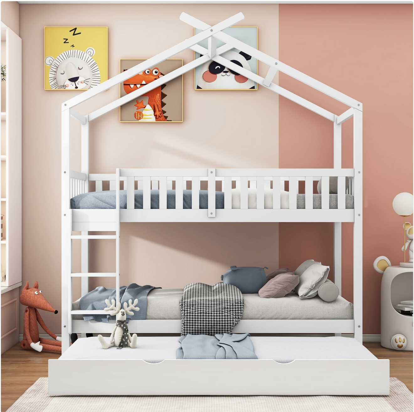
Image: The Moimhear House Bed 90x200cm, featuring a bunk bed design with an integrated pull-out trundle bed.