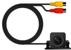
AHD Backup Camera