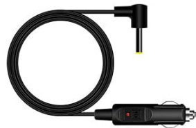
12V Cigarette Lighter Cable