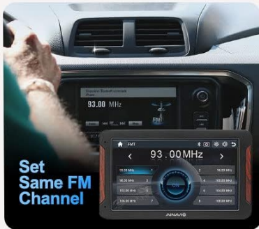
FM transmission ( Sound can be transmitted to the Car Speakers )