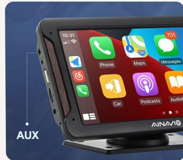
AUX Audio Port ( Support the Wired Headphones )

This image explains the Bluetooth connectivity for hands-free calls and contact synchronization. It also shows various audio output methods: FM transmission to car speakers, built-in speakers, and an AUX audio port for wired headphones.