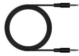
Audio Output Cable