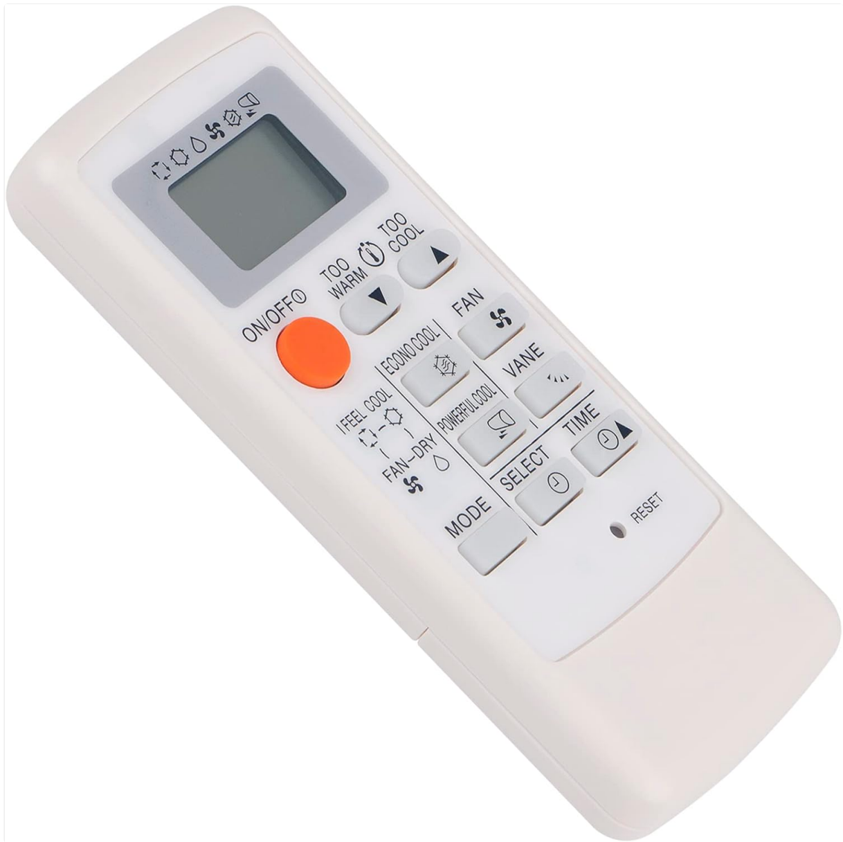
Figure 2: Angled view of the remote control, showing its ergonomic shape.