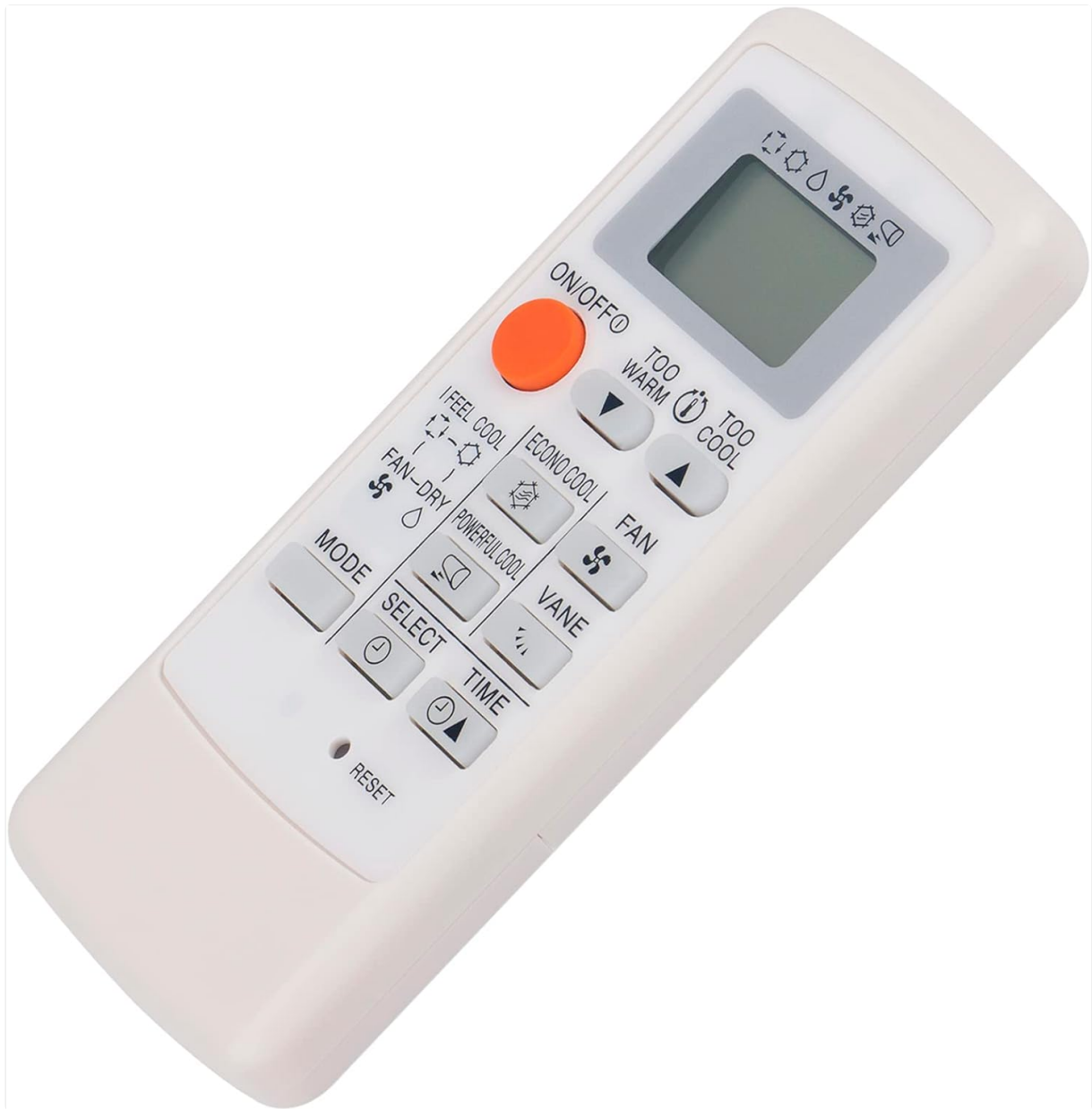
Figure 1: Front view of the remote control, displaying the screen and button layout.