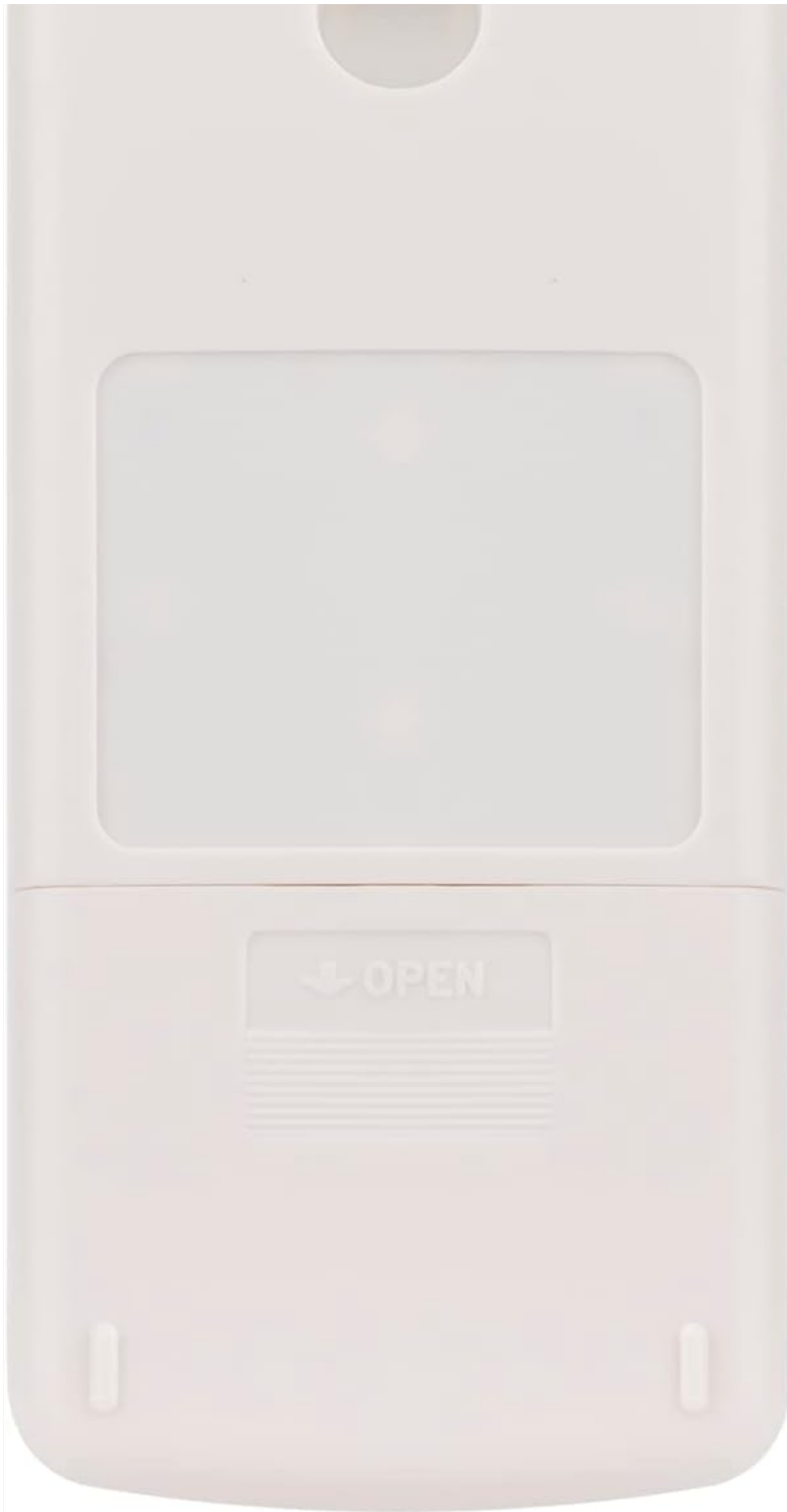
Figure 4: Back of the remote control with the battery cover closed.

The remote control is now ready for use.