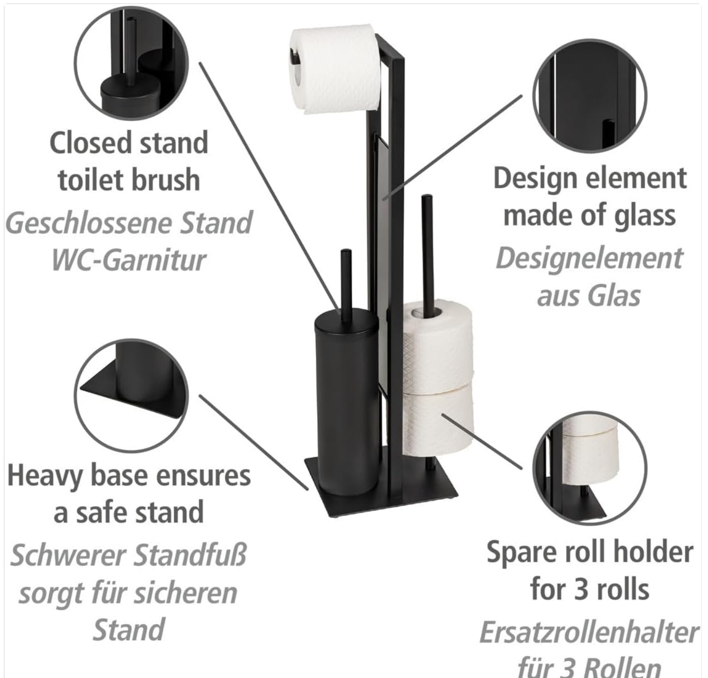
Figure 2: Components of the Rivalta Stand Set, illustrating the main parts for assembly.

The WENKO Rivalta Closed Stand Set requires minimal assembly. Please ensure all components are present before beginning. A rubber mallet may be useful for securing connections.