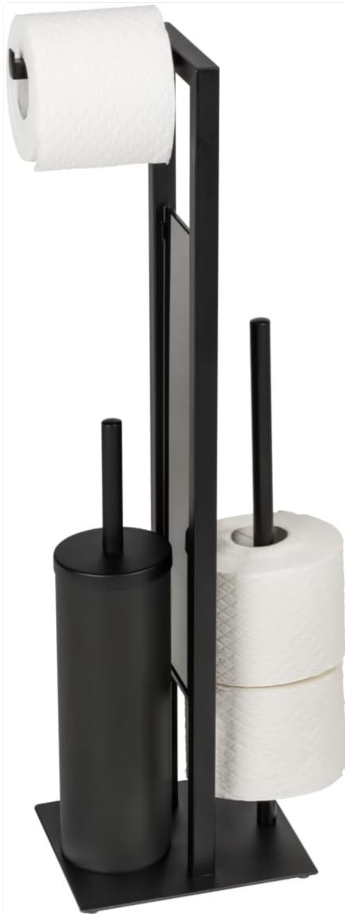
Figure 1: The WENKO Rivalta Closed Stand Set, showcasing its integrated toilet paper holder, toilet brush, and spare roll storage.