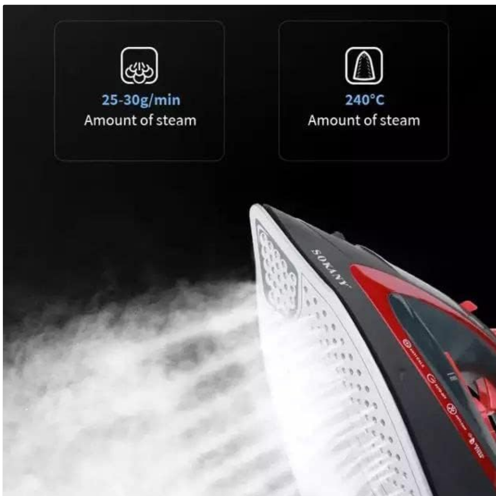
Image: The SOKANY SK-YD-2094 Steam Iron actively producing steam, illustrating its steam function.