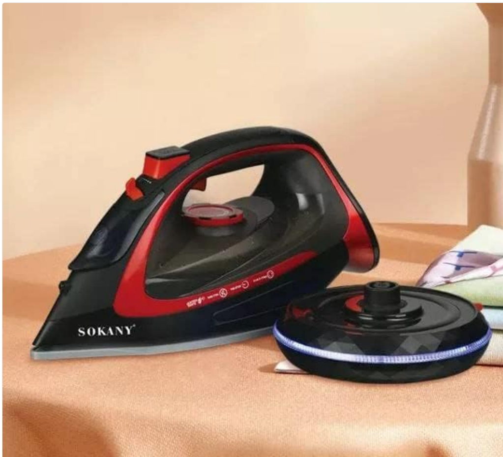
Image: The SOKANY SK-YD-2094 Steam Iron, showcasing its design and separate base.

The SOKANY SK-YD-2094 Steam Iron is designed for efficient garment care, offering dry, steam, and spray functions. Familiarize yourself with its components for optimal use.