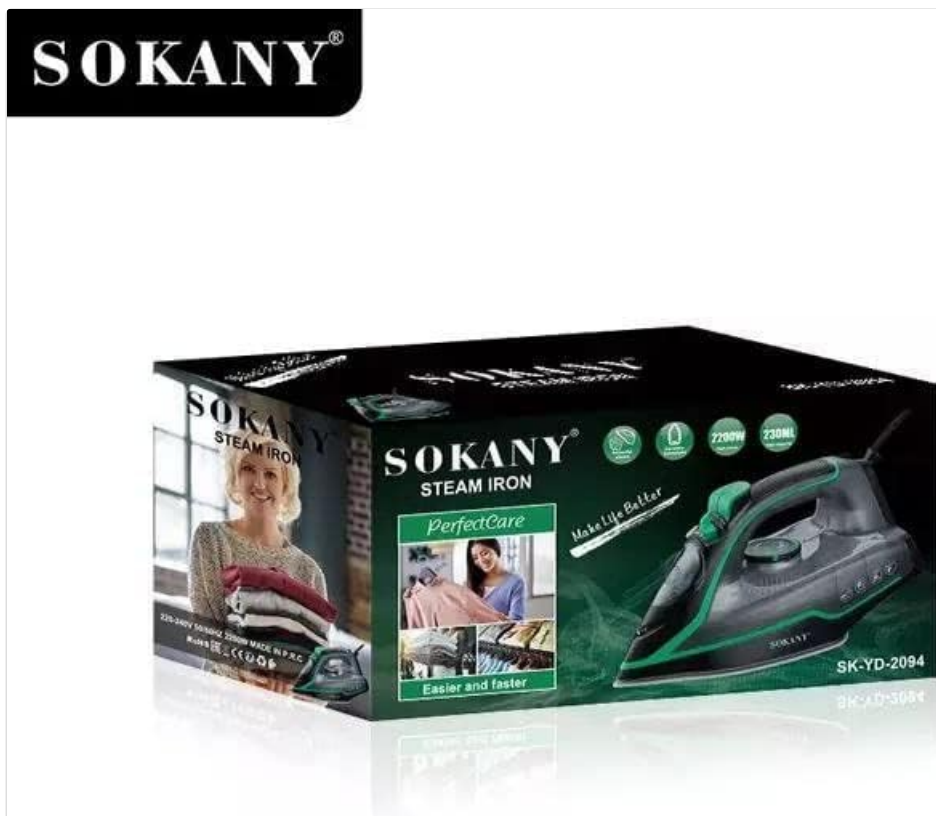
Image: The SOKANY SK-YD-2094 Steam Iron packaging, showing the product and its features.

Thank you for purchasing the SOKANY SK-YD-2094 Steam Iron. This manual provides essential information for the safe and efficient operation, maintenance, and troubleshooting of your new appliance. Please read these instructions carefully before first use and retain them for future reference.