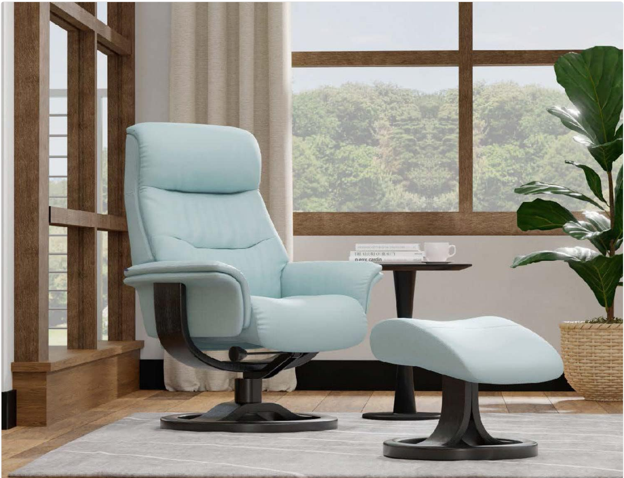
Image: The Fjords Anne R Small Recliner and Ottoman placed in a living room, demonstrating typical setup.