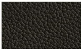
AL 510 Black

It is uncorrected, meaning the surface of the hide has not been sanded smooth to remove imperfections and natural marks. This gives the leather natural variation in grain, and an improved look and feel. This top grain leather has been allowed to shrink at the tannery for a grainier, more varied and NATURAL appearance.