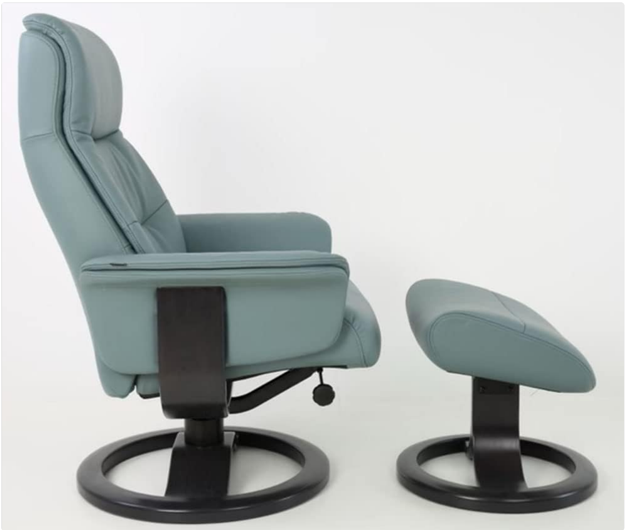
Image: Side view of the Fjords Anne R Small Recliner and Ottoman, illustrating the ergonomic design and potential for recline.