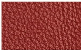
AL 525 Tobasco