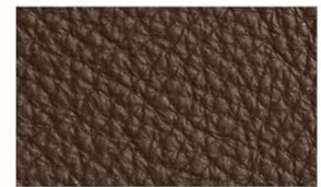
AL 535 Dark Brown