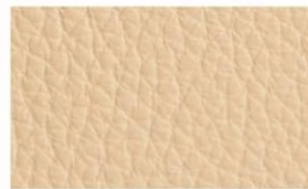
AL 529 Latte