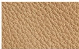
AL 552 Tan