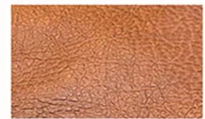
AL 554 Whiskey

Image: Detailed measurements for Fjords Anne R Small and Large models, including footstool dimensions.