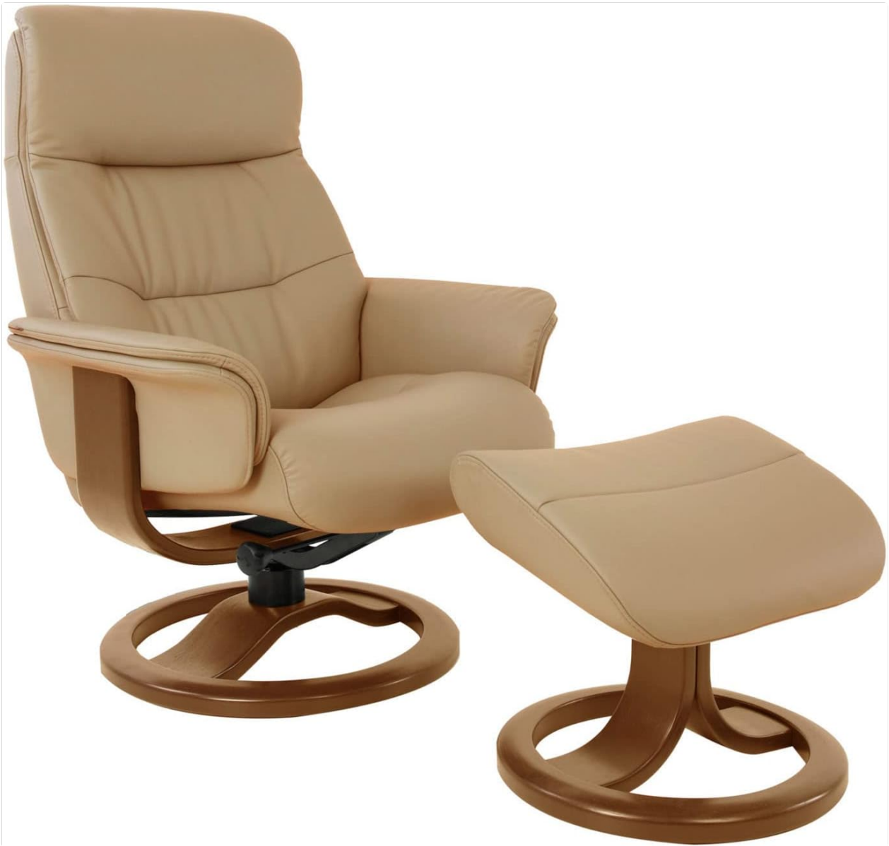
Image: The Fjords Anne R Small Recliner and Ottoman in Cigar Soft Line Leather, showcasing its design.