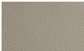
AL 551 Soft Grey