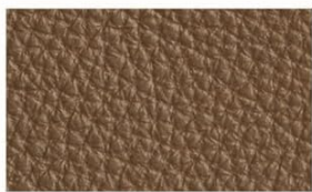
AL 539 Safari