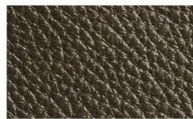
AL 543 Slate