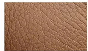
AL 545 Vintage Cognac