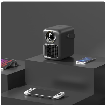
The projector shown alongside a tablet, smartphone, and gaming console, demonstrating its connectivity options.