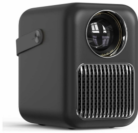
Front view of the WANBO T6R Max Projector, showcasing the lens and ventilation grille.