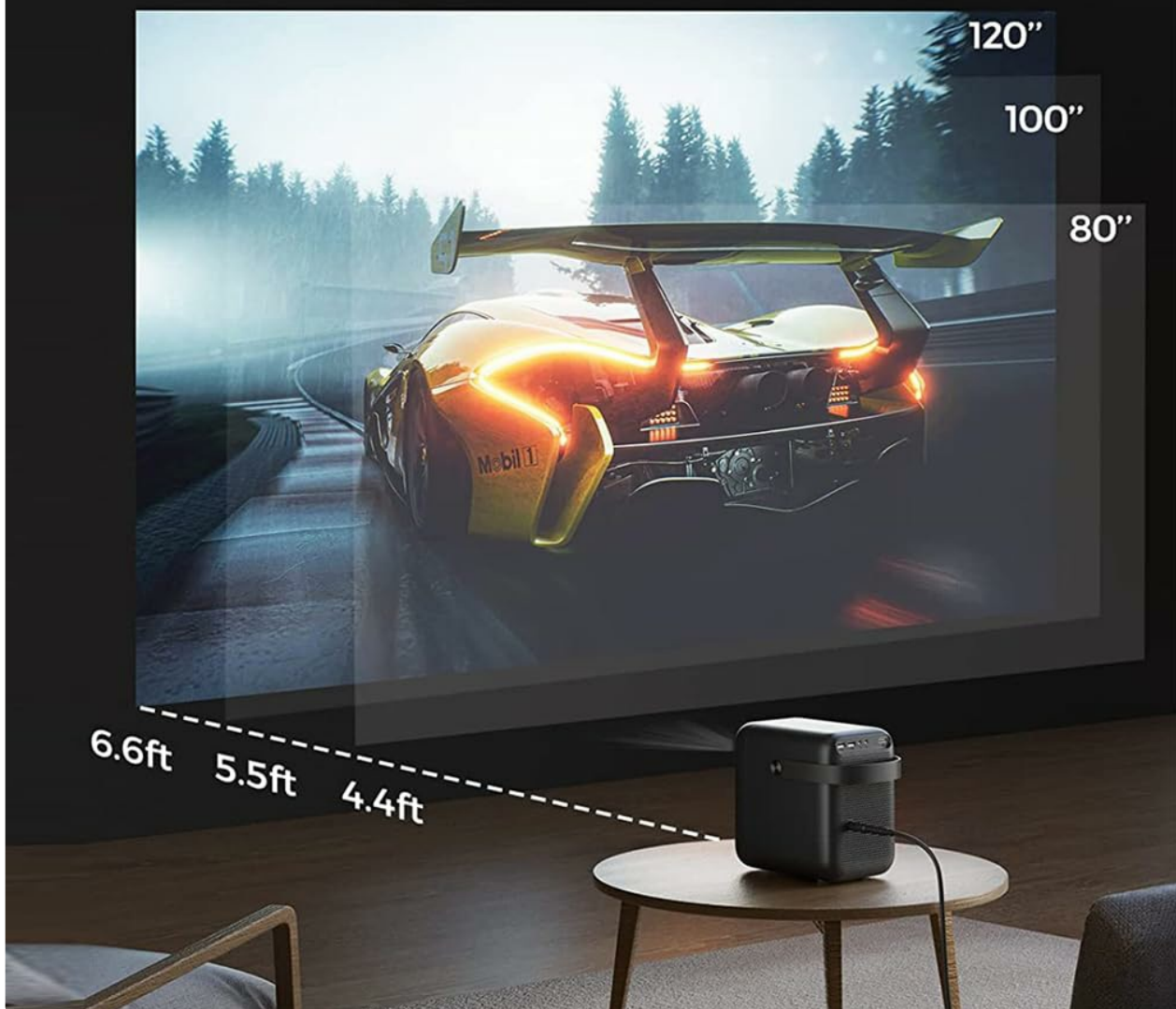
Diagram illustrating recommended projection distances for various screen sizes (e.g., 4.4ft for 80", 5.5ft for 100", 6.6ft for 120").