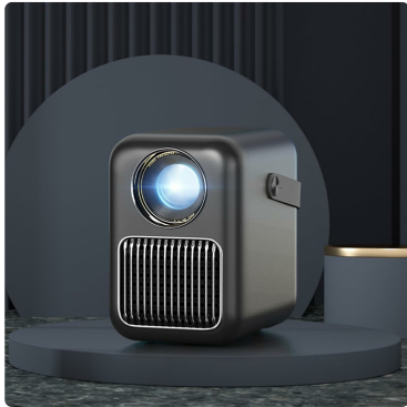
The projector positioned on a stand, illustrating its compact design and illuminated lens during operation.