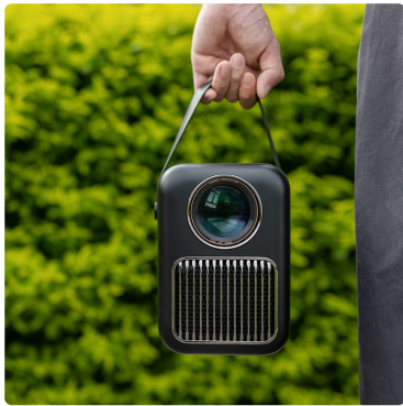
A person holding the projector by its integrated handle, highlighting its portability.