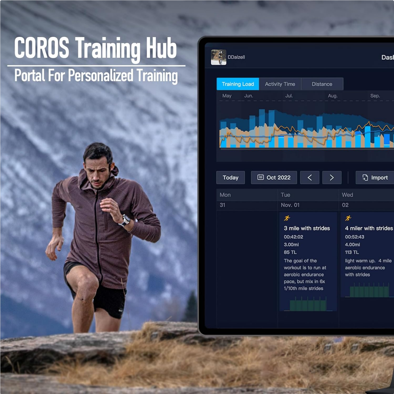
Figure 7: Screenshot of the COROS EvoLab app displaying running fitness and training metrics.