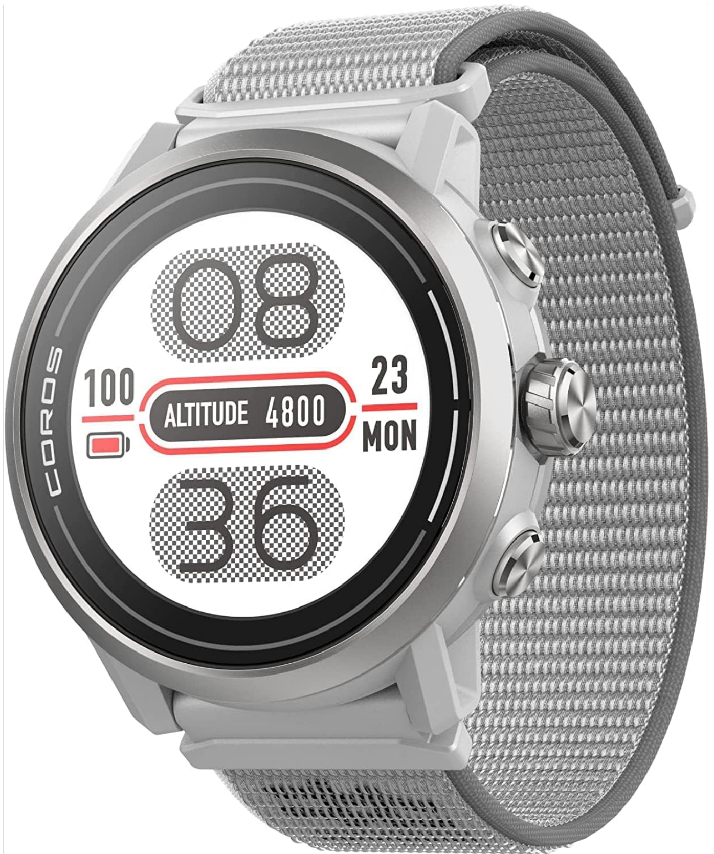
Figure 1: Front view of the COROS APEX 2 GPS Outdoor Watch, showcasing its display and physical buttons.