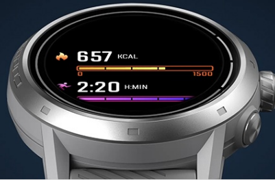
Figure 3: The easy-to-use digital dial and touchscreen interface of the COROS APEX 2.

Our simple button design features a large digital dial, so you can easily change settings on your watch using a few simple clicks even with gloves.