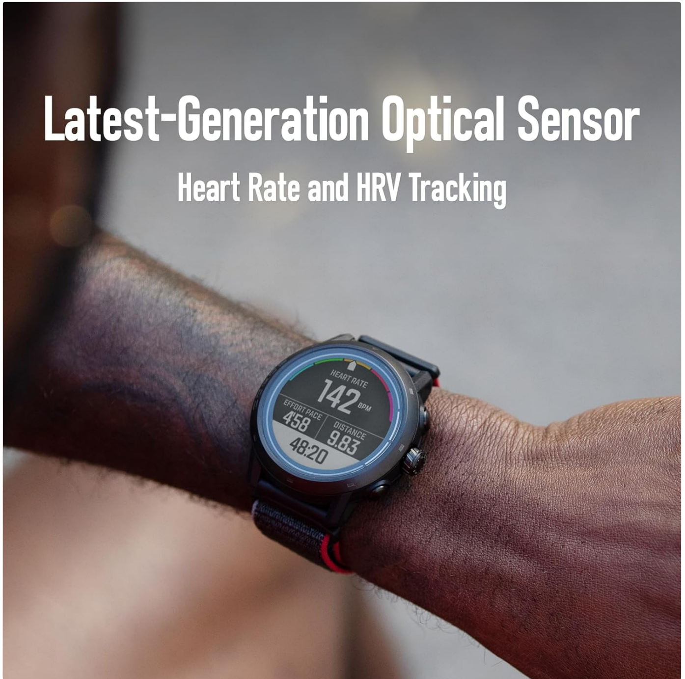
Figure 6: The COROS APEX 2 worn on a wrist, displaying real-time heart rate data.

The watch features a next-generation optical heart rate sensor for continuous heart rate and HRV tracking.