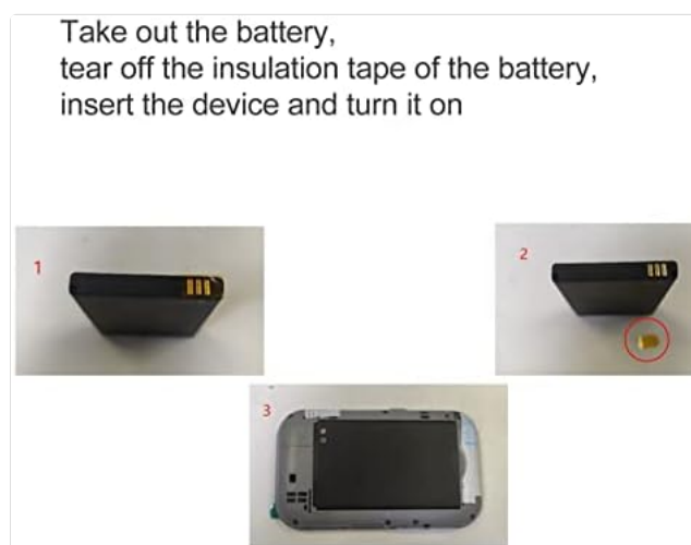
Image 5.1: A visual guide demonstrating the steps to install the battery, including removing the insulation tape, for the ciciglow MF800-2 Mobile Hotspot.