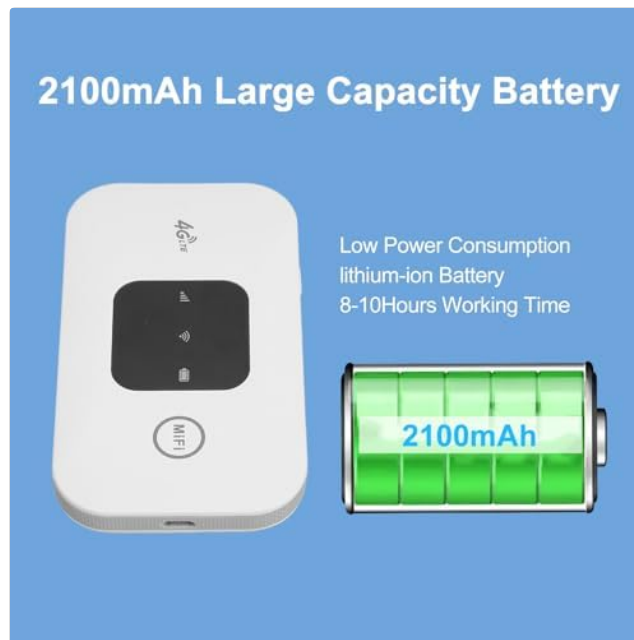
Image 6.2: The ciciglow MF800-2 Mobile Hotspot next to an illustration of a 2100mAh battery, highlighting its large capacity and long working time of 8-10 hours.