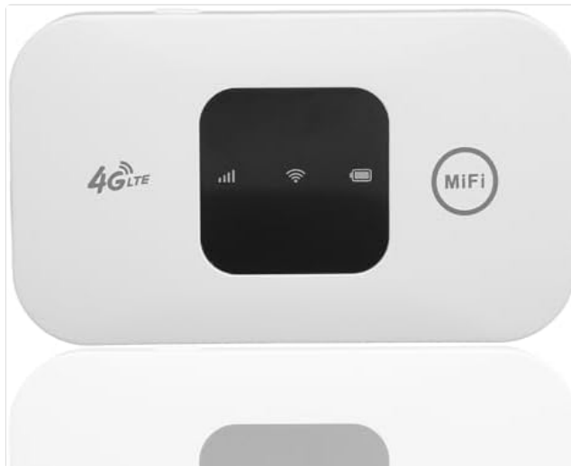
Image 1.1: Front view of the ciciglow MF800-2 Mobile Hotspot, showing the 4G LTE indicator, signal strength, Wi-Fi status, battery icon, and MiFi button.

The ciciglow MF800-2 Mobile Hotspot is a portable 4G LTE router designed to provide high-speed internet access for multiple users. It supports up to 10 simultaneous connections, making it suitable for travel, business, and home use. Equipped with a 2100mAh battery, it offers extended usage time and convenient portability.