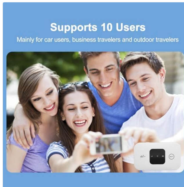
Image 6.1: A group of friends or family members sharing a mobile hotspot connection, demonstrating the device's capability to support multiple users for various activities like browsing and social media.

The ciciglow MF800-2 supports up to 10 users simultaneously. For optimal performance, monitor the number of connected devices and ensure sufficient bandwidth for all users.