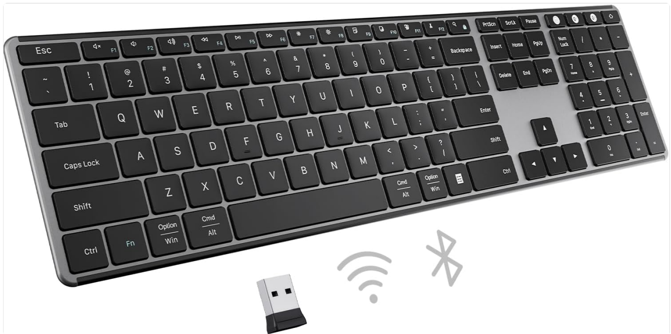
Image: The AUSDOM keyboard displayed with its 2.4G USB receiver and Bluetooth icons, indicating its dual connectivity options.