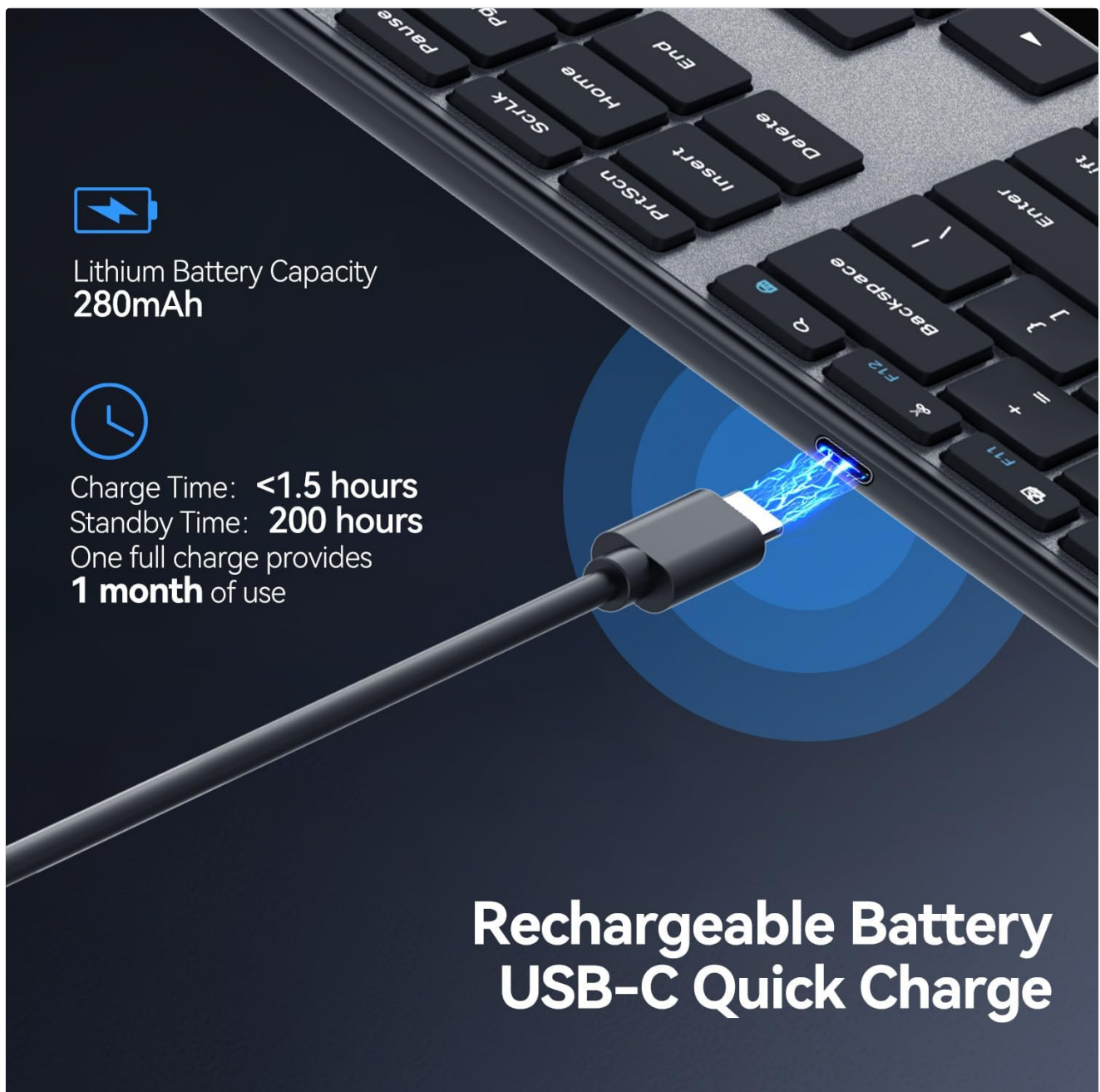
Image: The AUSDOM keyboard connected to a USB-C charging cable, illustrating the charging process. The image highlights the USB-C port and the charging indicator.

Before first use, fully charge the keyboard using the provided USB cable. Connect the USB-C end to the keyboard's charging port and the USB-A end to a power source (e.g., computer USB port, USB wall adapter).