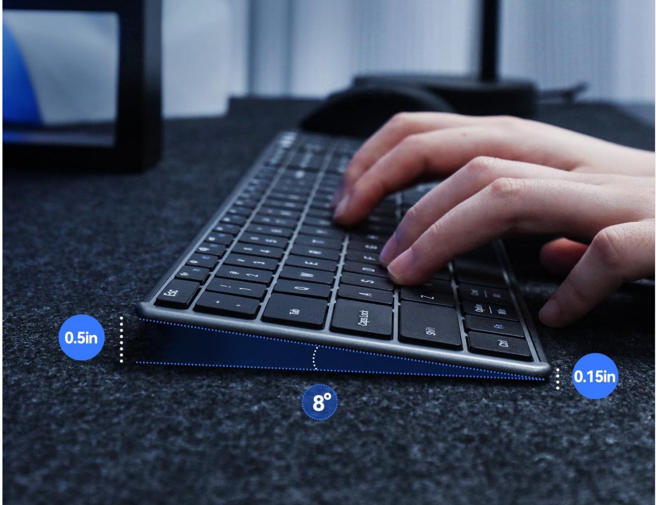
Image: A side view of the AUSDOM keyboard, showcasing its ultra-slim design and integrated typing angle for ergonomic comfort.

Thinner than a penny, only 0.15 inch thin with an integrated typing angle.