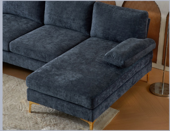
Image: Step 2 - Connecting the main sofa sections.