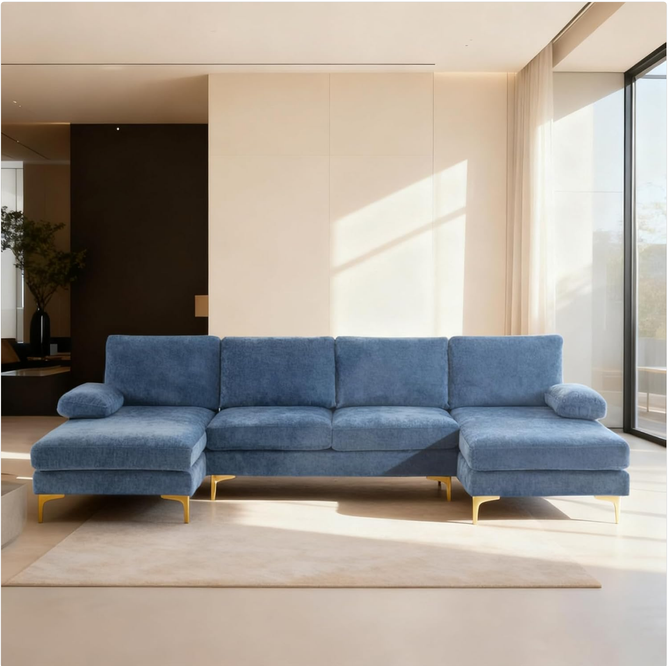
Image: The assembled U-Shape Sectional Sofa, ready for use.