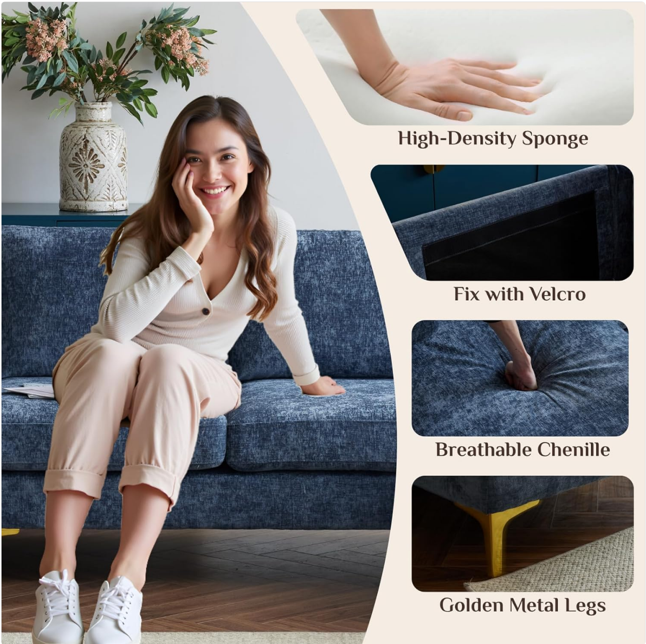
Image: High-density sponge cushions covered in breathable chenille fabric.

Your browser does not support the video tag.