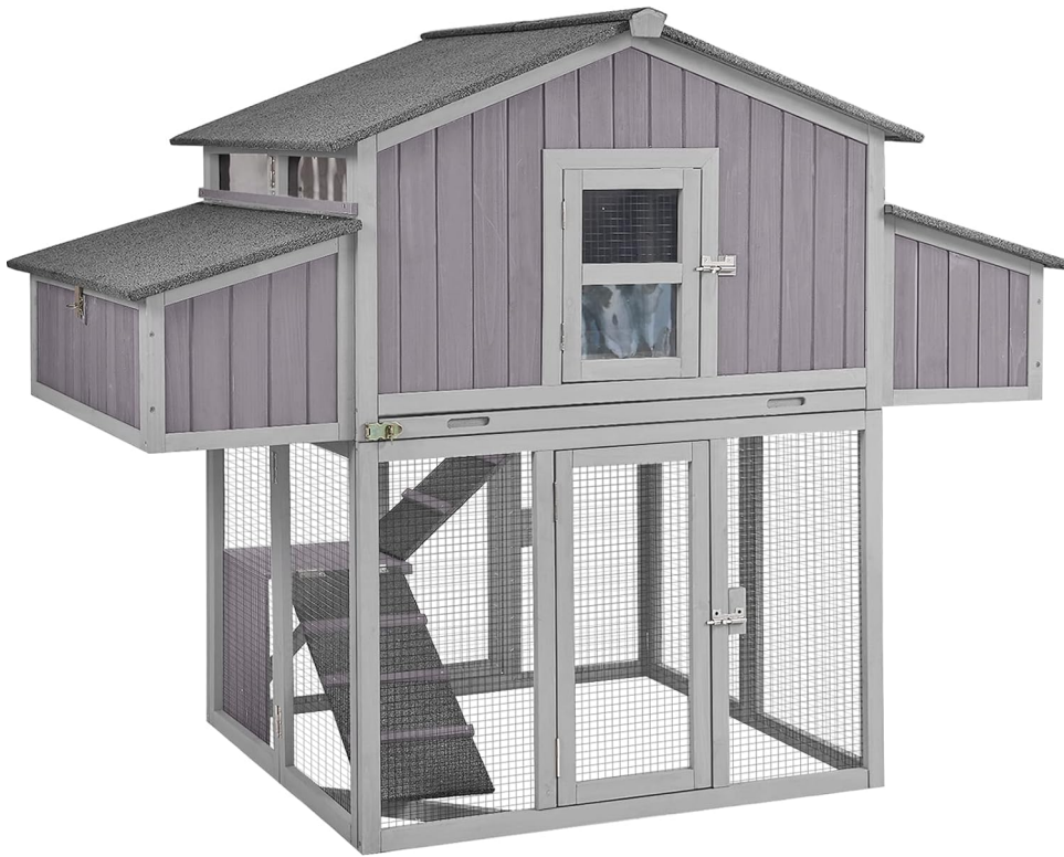
Image: The fully assembled Aivituvin AIR66 Portable Wooden Chicken Coop, showcasing its two-level design with a raised house and ground-level run, nesting boxes, and ramp.