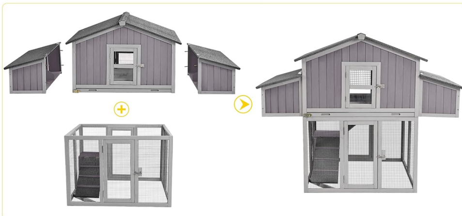
Image: Visual guide demonstrating the folding assembly process for the chicken coop, showing panels unfolding and connecting to form the structure.