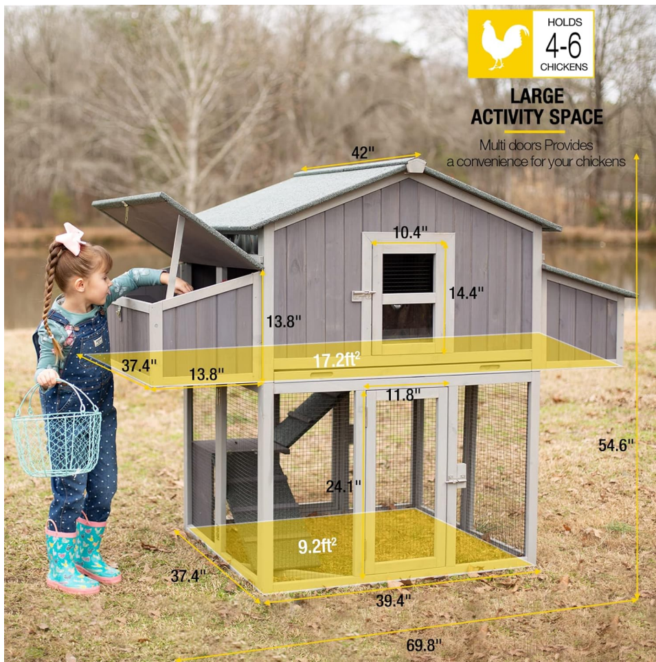
Image: An annotated diagram illustrating the dimensions (69.8"L x 42"W x 54.6"H) and activity space (26 sq ft) of the chicken coop, indicating its capacity for 4-6 chickens.