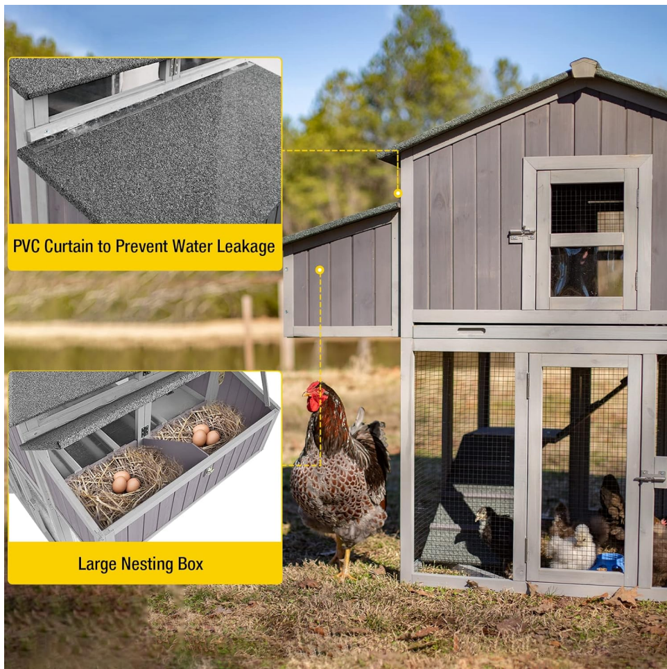
Image: A detailed view of the large, two-sided nesting box, showing eggs inside and a PVC cover designed to prevent water leakage at the connection point.