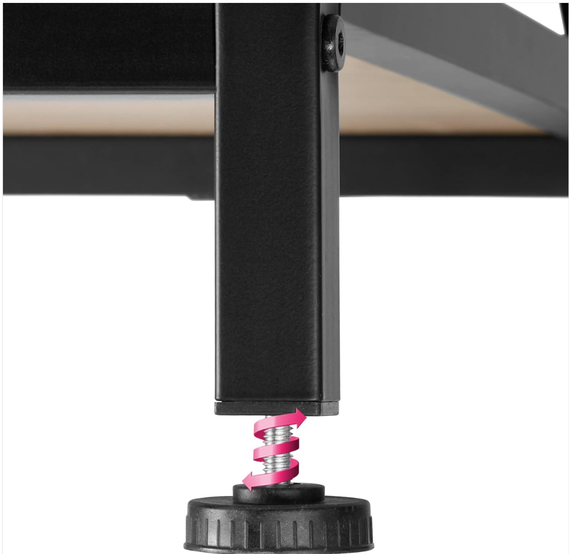
Image: Adjustable foot for leveling the storage box.