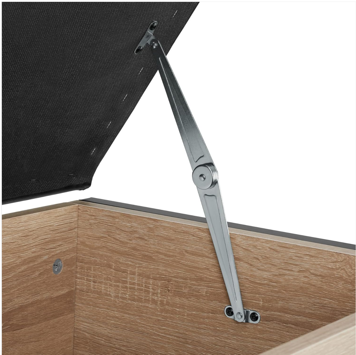
Image: Detail of the lid hinge mechanism, ensuring smooth opening and closing.