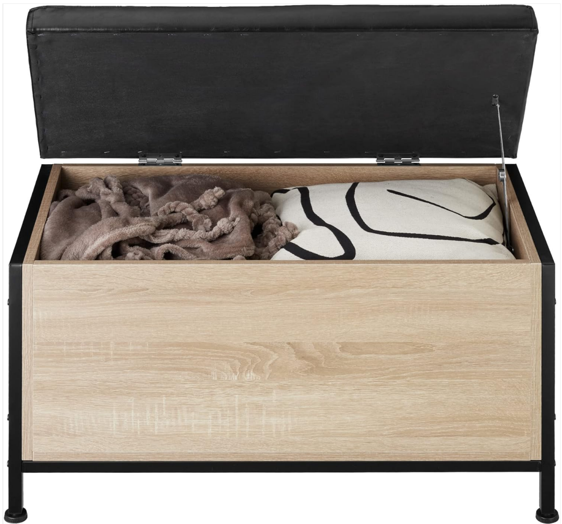
Image: The storage box with its lid open, showcasing its ample internal storage capacity for items like blankets.