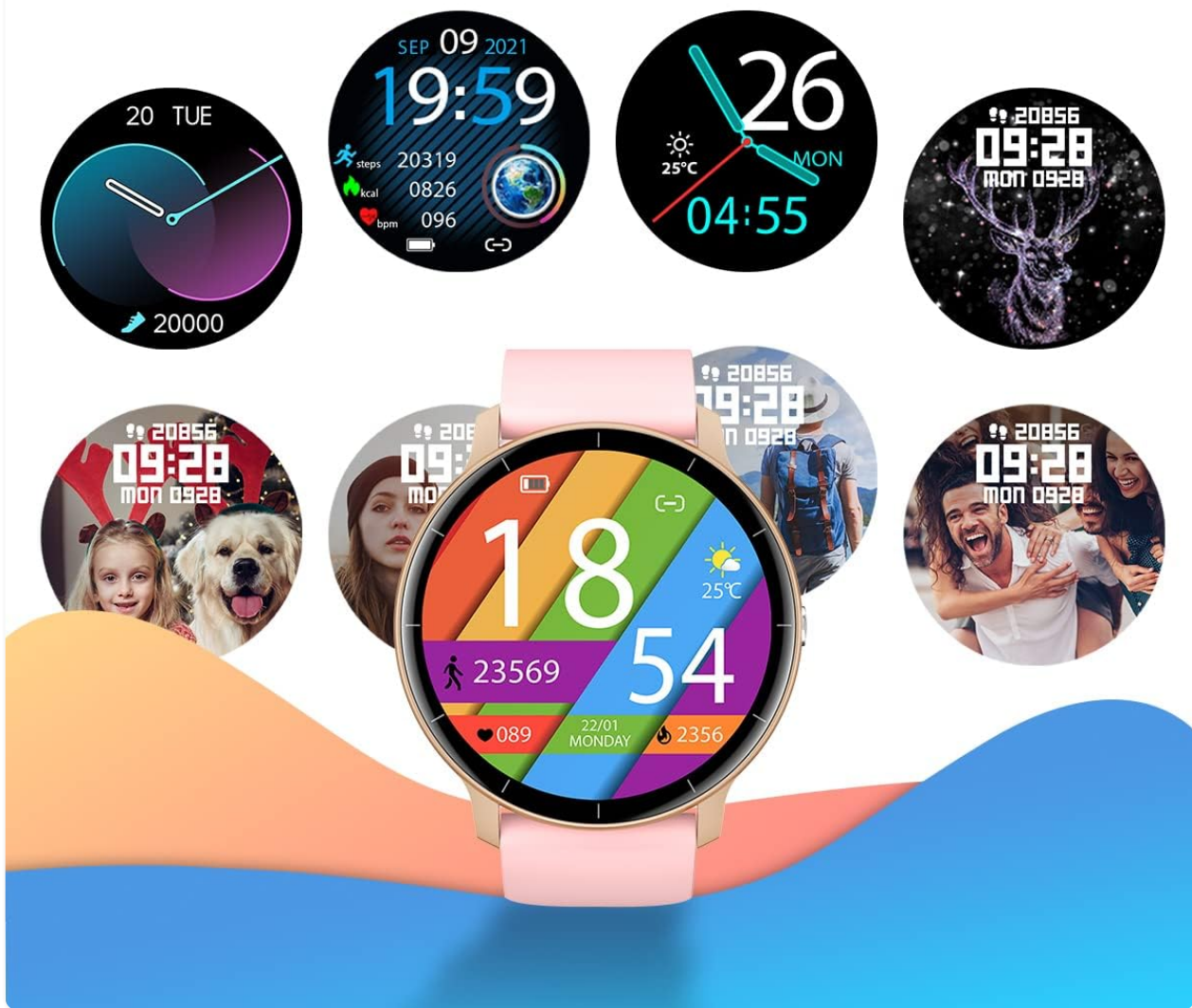
Figure 4.5: A variety of customizable watch face designs available for the smartwatch.