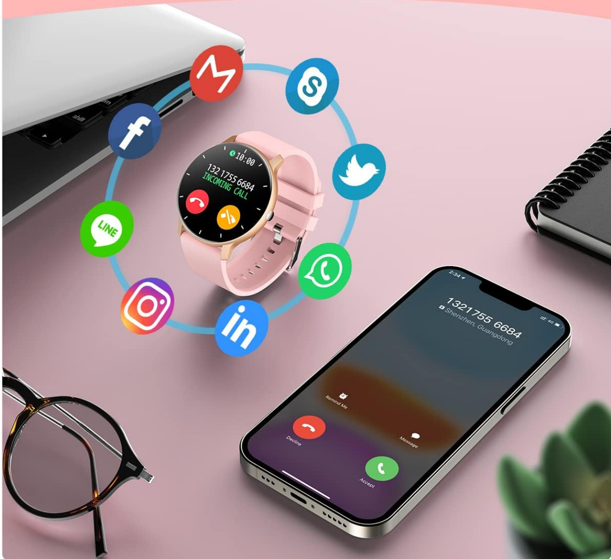
Figure 4.3: The smartwatch displaying an incoming call and icons for various messaging apps.