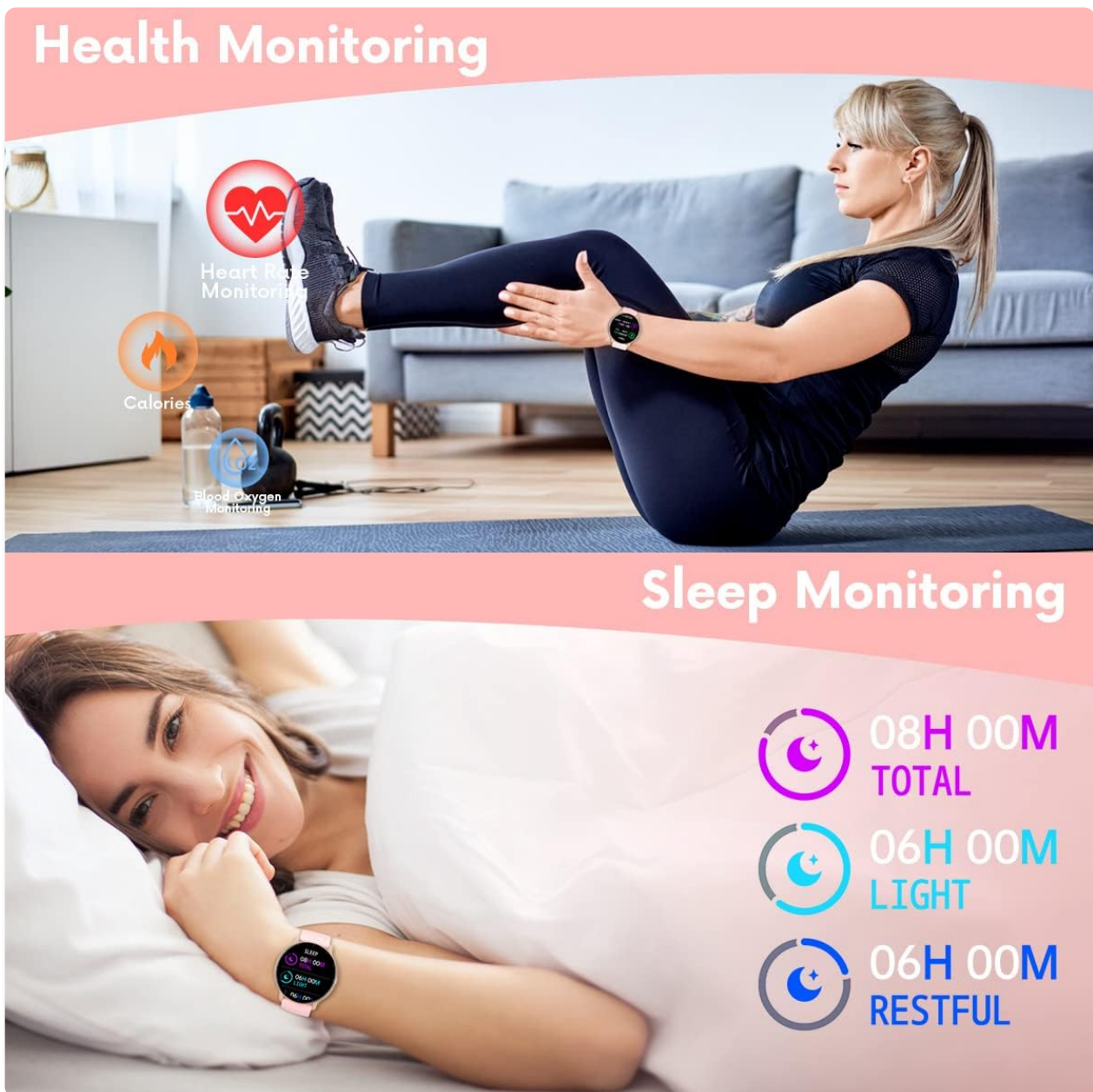
Figure 4.1: Health monitoring features including heart rate, calories, blood oxygen, and detailed sleep tracking.