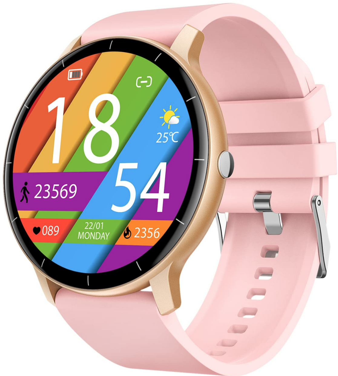
Figure 2.1: A close-up view of the TAOPON Smartwatch, showcasing its round display and sleek design.