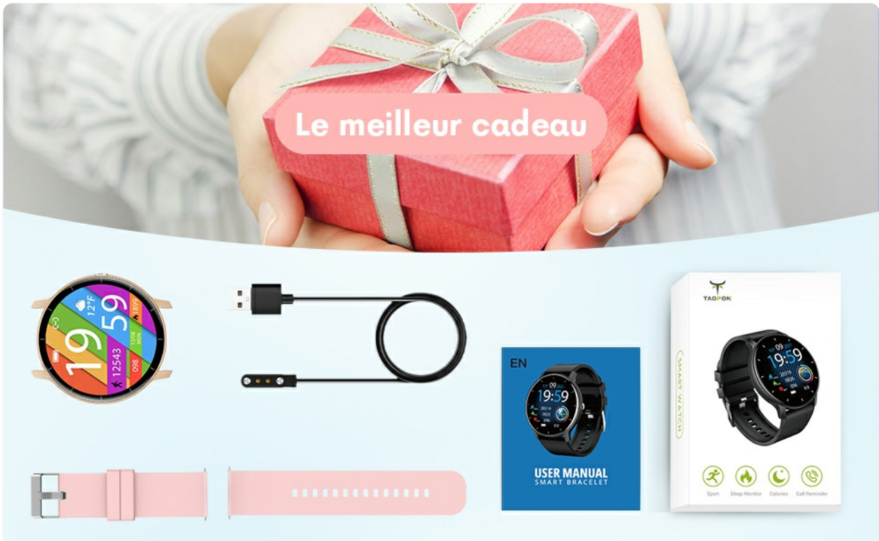
Figure 2.2: The smartwatch package contents, including the watch, charging cable, and user manual.