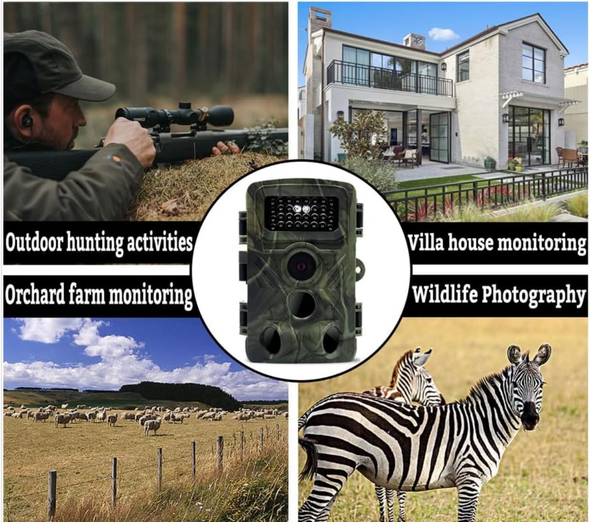
Figure 4.4: Suitable for Many Occasions. This collage illustrates the diverse uses of the trail camera, from security monitoring to wildlife observation.

Make your life more secure and convenient