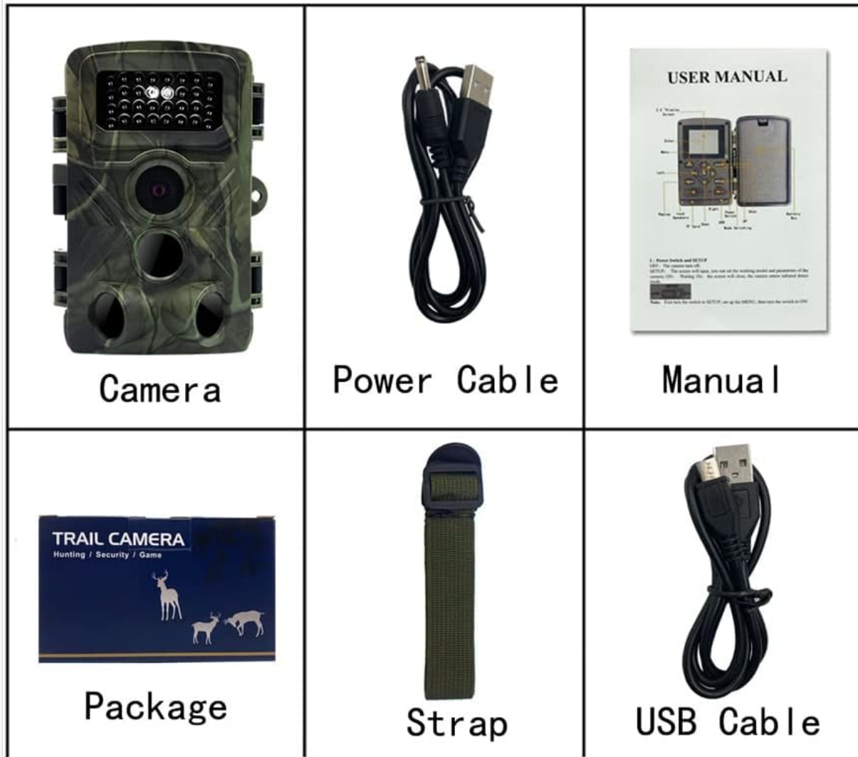
Figure 2.2: Package Contents. The box includes the ZEYUAN PR3000 camera, a power cable, this user manual, mounting straps, and a USB cable for data transfer.