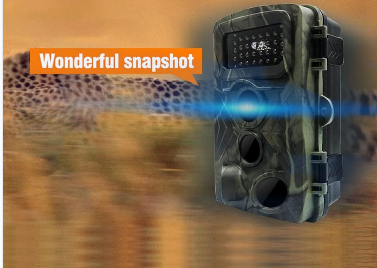
Figure 4.1: Short Trigger Time. The camera's quick response ensures that no interesting moments are missed, capturing images or videos within 0.2 to 0.6 seconds of detection.

The trigger time is 0.2~0.6S, quick to take pictures and videos, will not miss every interesting moment.