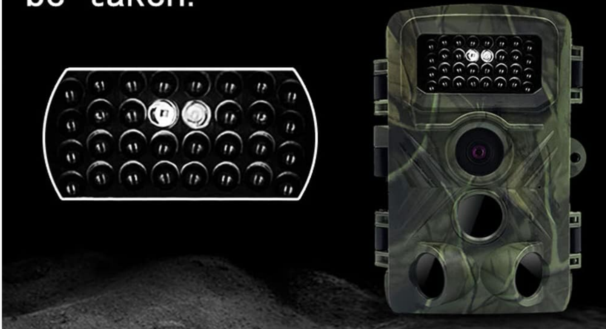
Figure 4.3: 34 IR Lights. The camera's 34 infrared LEDs ensure that clear images can be captured even in environments with no ambient light.

Even in a completely black environment, clear images can be taken.