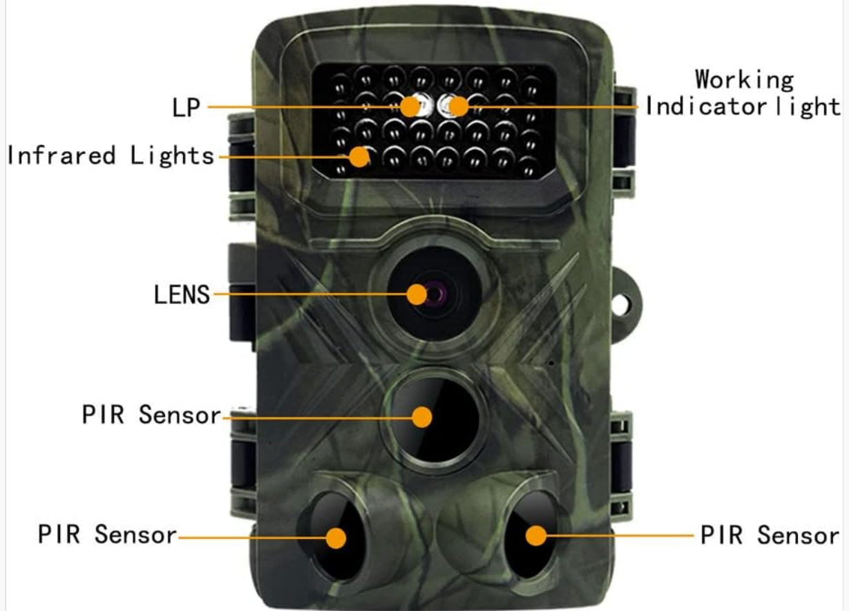
Figure 2.1: Product Component Analysis. This diagram highlights key parts such as the Infrared Lights, Lens, PIR Sensors, and the Working Indicator Light, essential for understanding the camera's functionality.