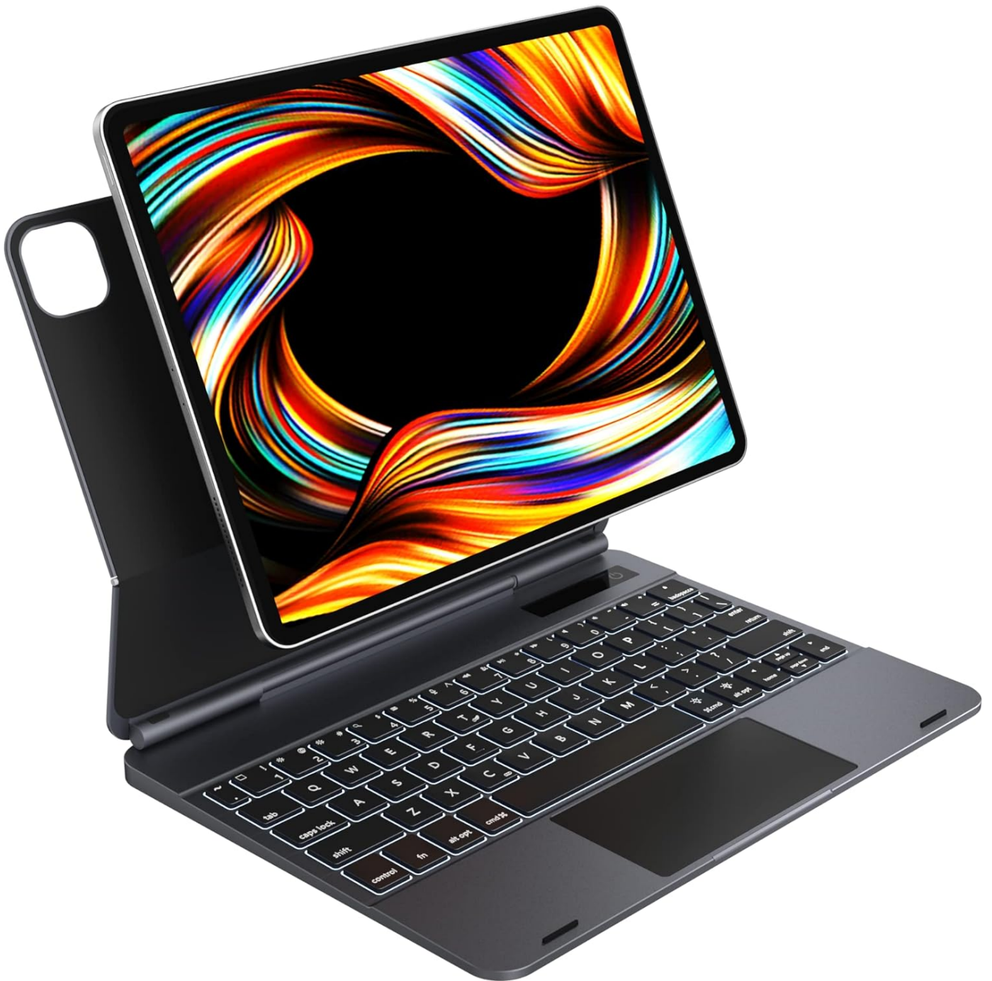
Image: The doqo Keyboard Case with an iPad Pro attached, showcasing its open, laptop-like configuration.