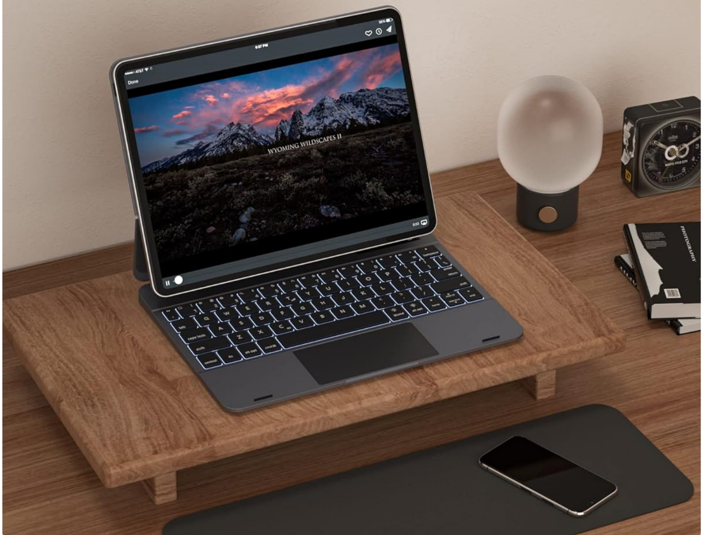
Image: The keyboard case with its backlight illuminated, demonstrating its utility in a dimly lit setting.