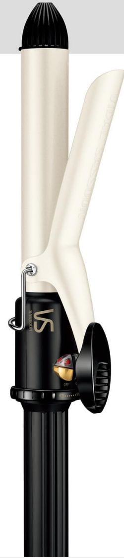
Image: The 25mm pipe diameter, suitable for daily curl styles, demonstrated by a user.