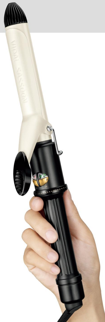
Image: The compact design of the curling iron, highlighting its easy-to-grip handle and 2.5cm diameter.