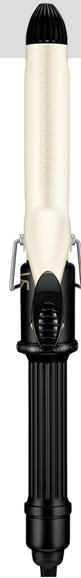
Image: The temperature control dial, allowing adjustment from 100-200°C, and indicating world voltage compatibility.