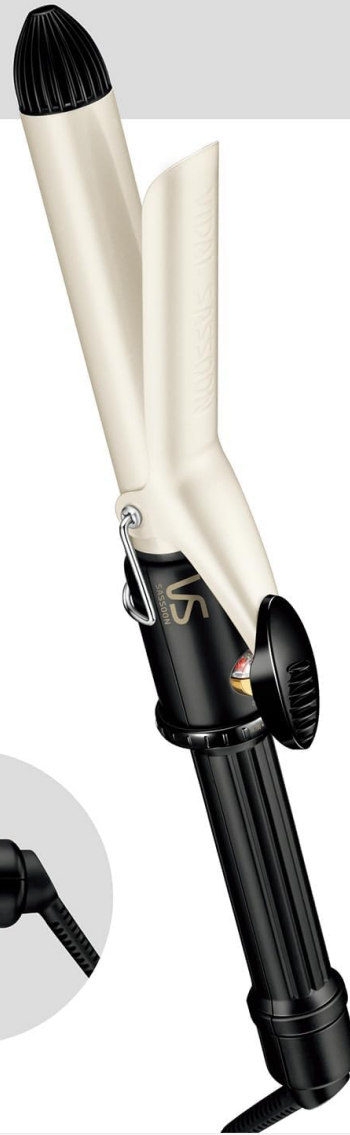
Image: Key features including automatic power-off, smooth ceramic coating, and a tangle-free swivel cord.