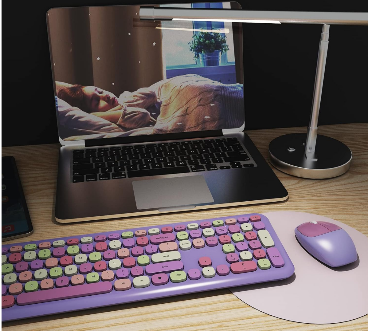
Image 3.3: Close-up of the ergonomic wireless mouse, designed for comfortable handling.