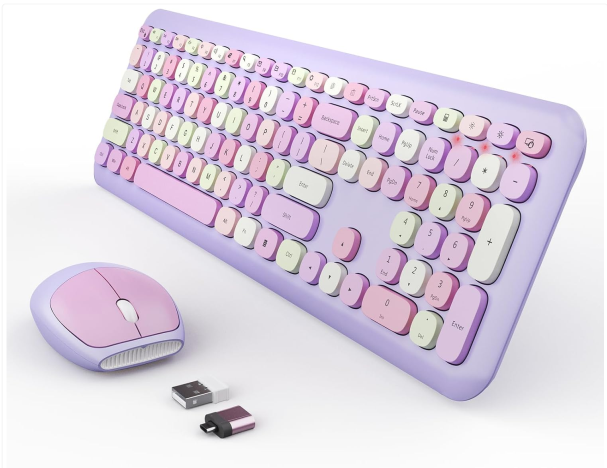
Image 1.1: The SkyGive Retro Wireless Keyboard and Mouse Combo, showcasing the keyboard, mouse, and the two included USB receivers (one standard USB-A, one Type-C adapter).

The SkyGive Retro Wireless Keyboard and Mouse Combo provides a comfortable and efficient input solution for various computing environments. This combo features a full-size keyboard with retro-style round keycaps and a low-noise ergonomic mouse, designed for seamless wireless connectivity.