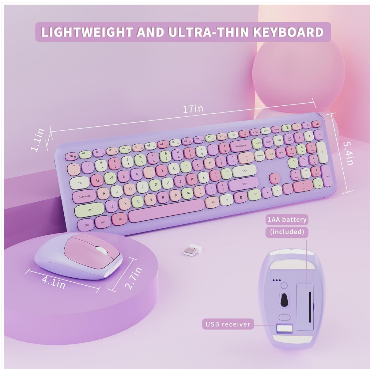
Image 2.1: Illustration of the keyboard and mouse dimensions, highlighting the location of the USB receiver within the mouse's battery compartment.