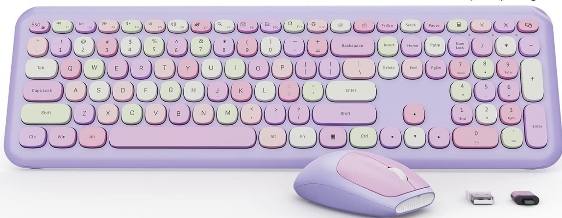
Image 3.2: Detailed view of the keyboard layout, illustrating the 14 multi-functional shortcut keys and their corresponding actions.

calculator Lock screen Power Indicator Number Lock Indicator Caps Lock Indicator