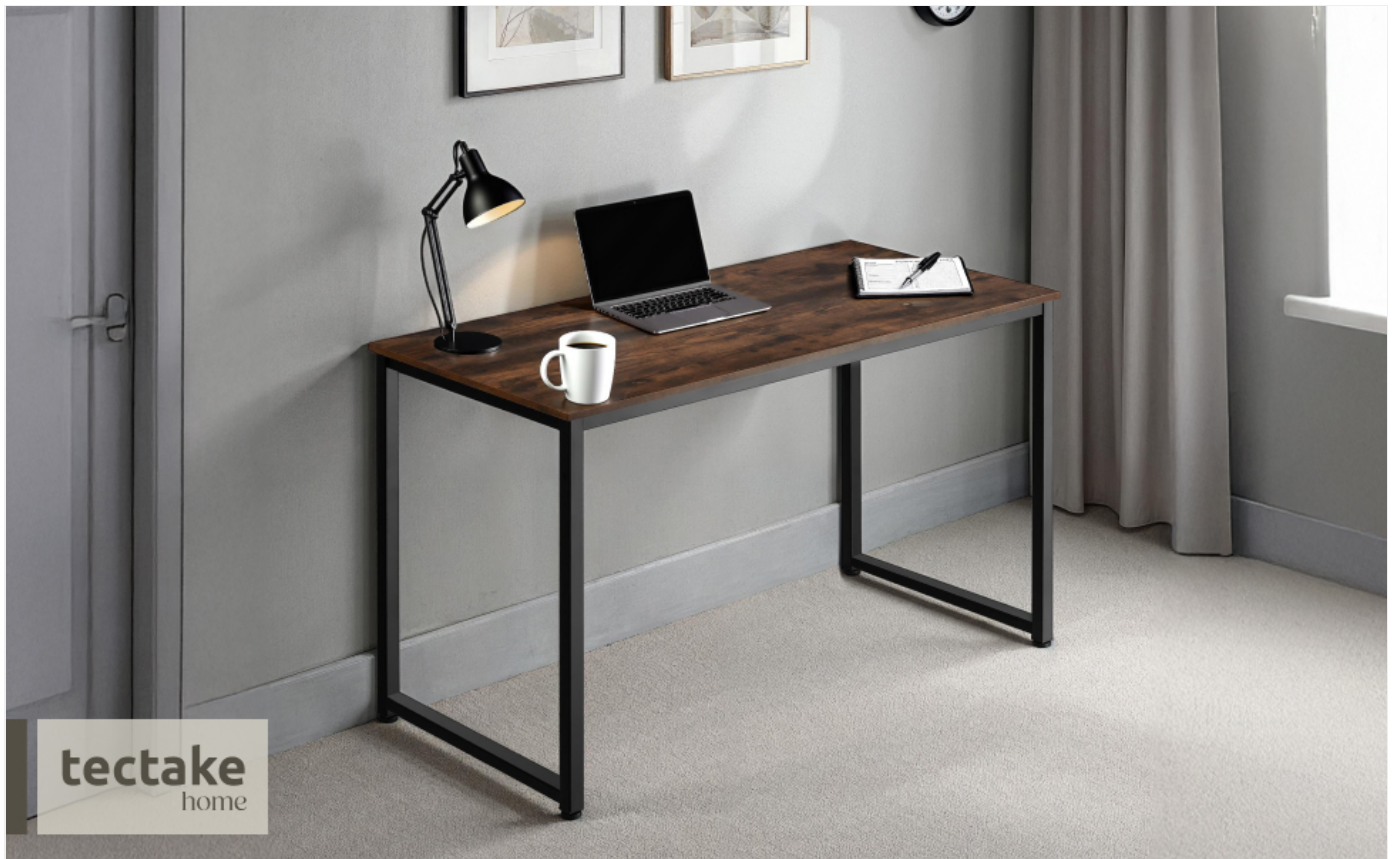
Image: Product details including dimensions, technical data (load capacity 75 kg, approx. weight 14.5 kg, tabletop material, steel structure), and package contents (desk, assembly material, assembly instructions).