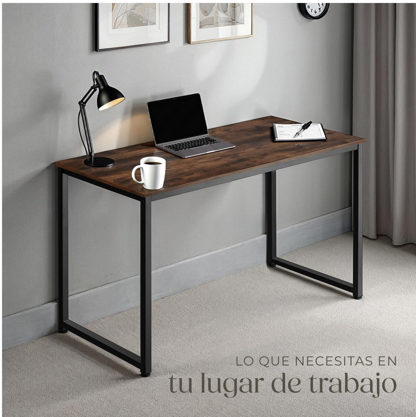
Image: An angled view of the TecTake Flint 120 desk, emphasizing its minimalist industrial design and sturdy construction.