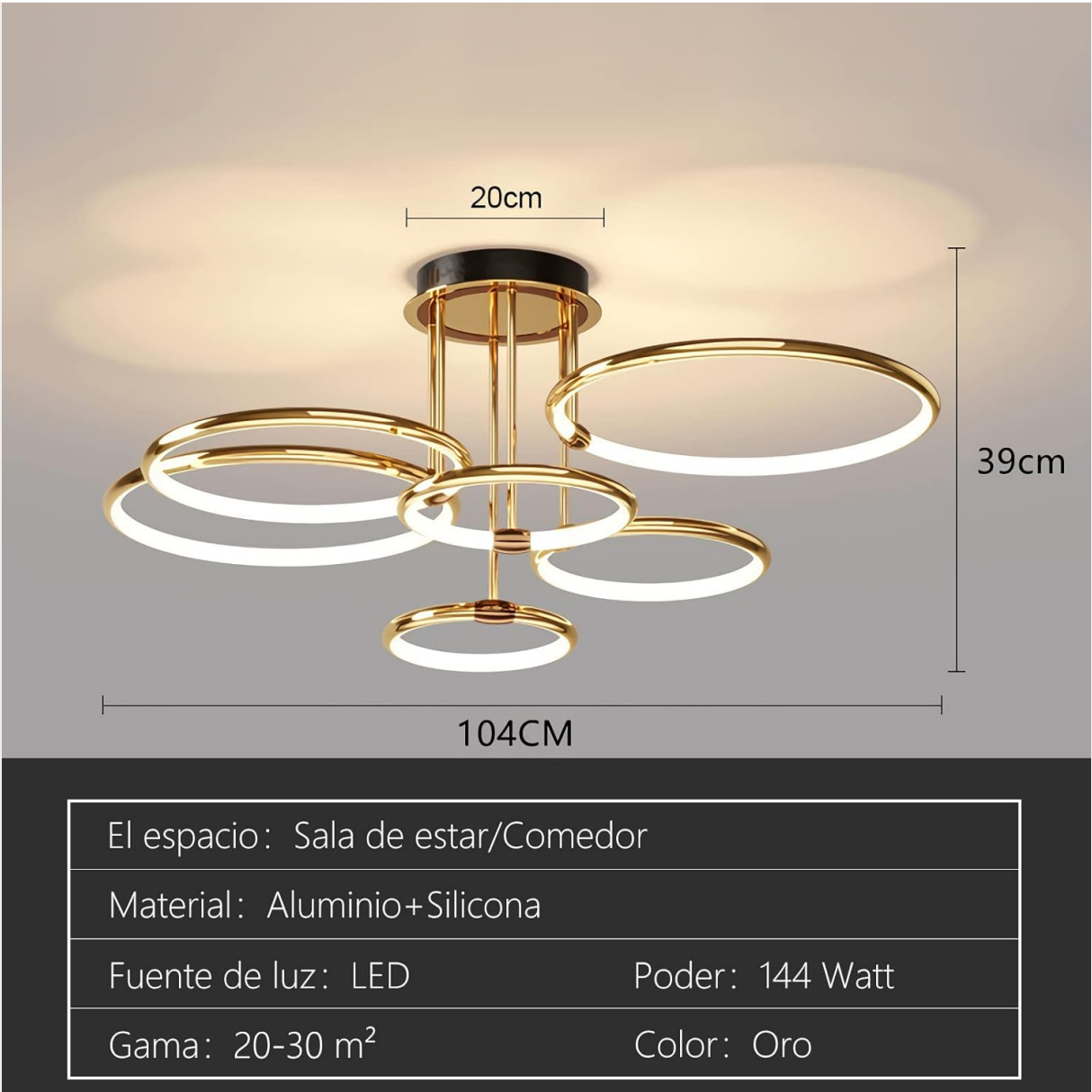
Image: Product dimensions illustrating the overall width (104 cm), height (39 cm), and base diameter (20 cm) of the light fixture.