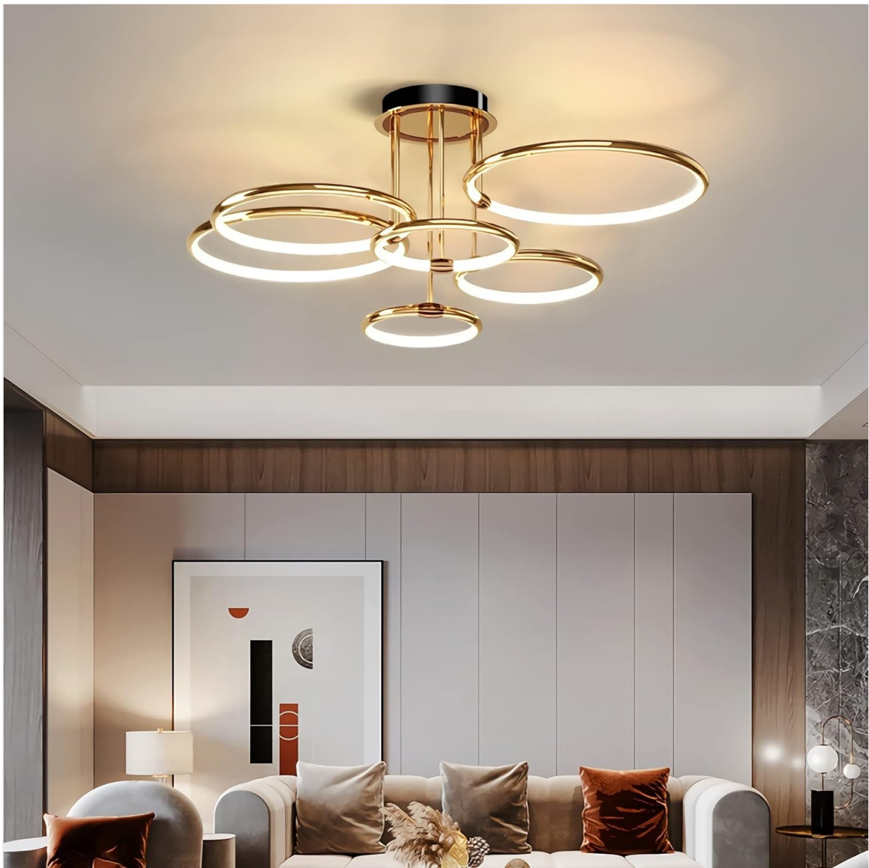
Image: The Huilefu 6-Ring LED Flush Mount Ceiling Light, featuring a gold-plated finish and six illuminated rings, installed in a contemporary living room setting.