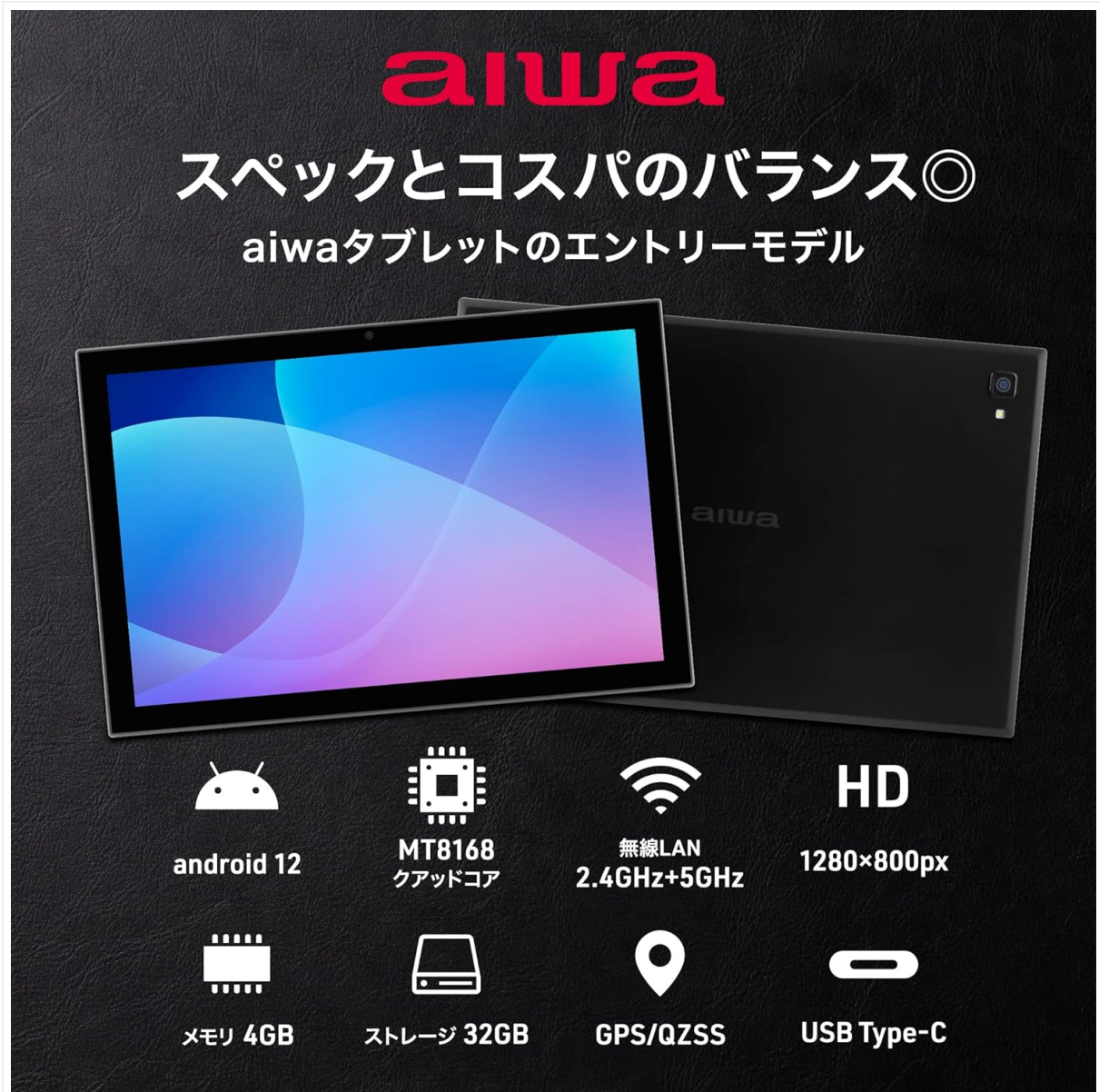
Figure 2.2: Overview of the tablet's core specifications, highlighting Android 12 operating system, MT8168B QuadCore processor, 2.4GHz+5GHz Wi-Fi, HD 1280x800px display, 4GB RAM, 32GB storage, GPS/QZSS support, and a USB Type-C port.