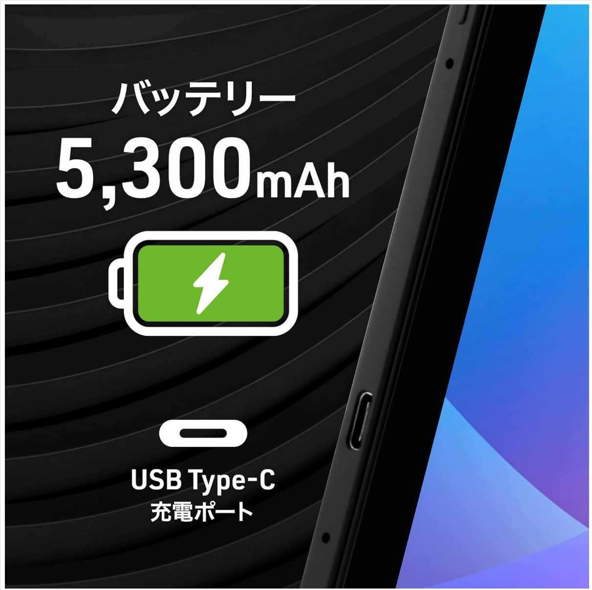
Figure 2.5: Information regarding the tablet's power features, including a 5,300mAh battery and a convenient USB Type-C charging port.