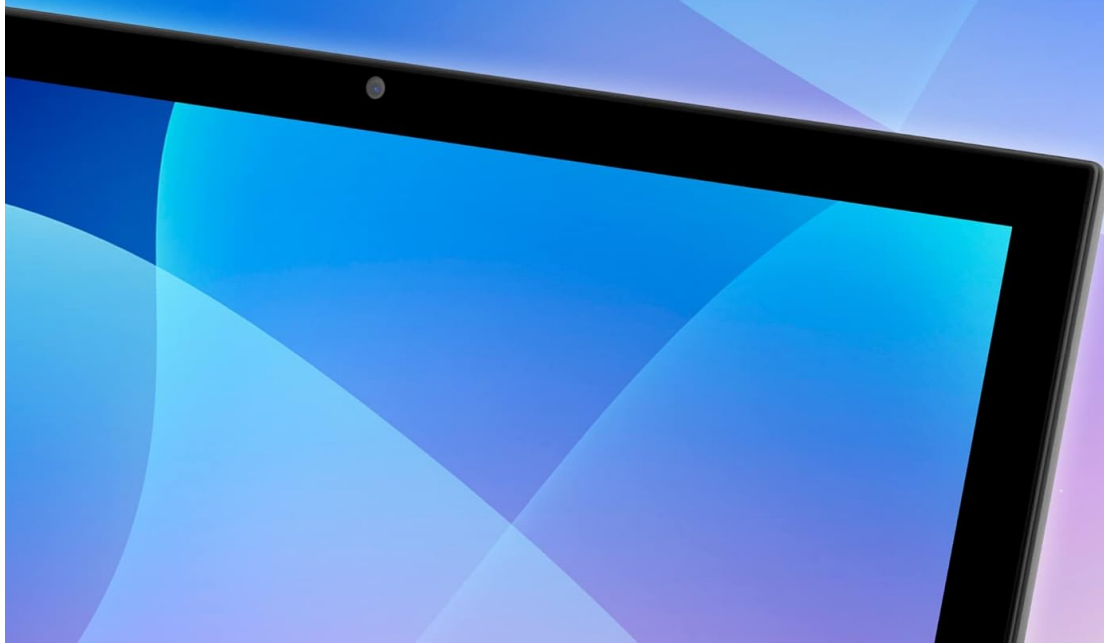
Figure 2.4: Details of the tablet's display, emphasizing its 10.1-inch size, HD 1280x800 pixel resolution, and 10-point multi-touch panel for responsive interaction.