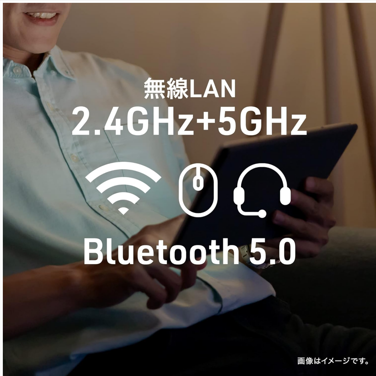
Figure 2.7: Details on the tablet's wireless connectivity, featuring dual-band Wi-Fi (2.4GHz and 5GHz) and Bluetooth 5.0 for seamless connections to networks and peripherals.