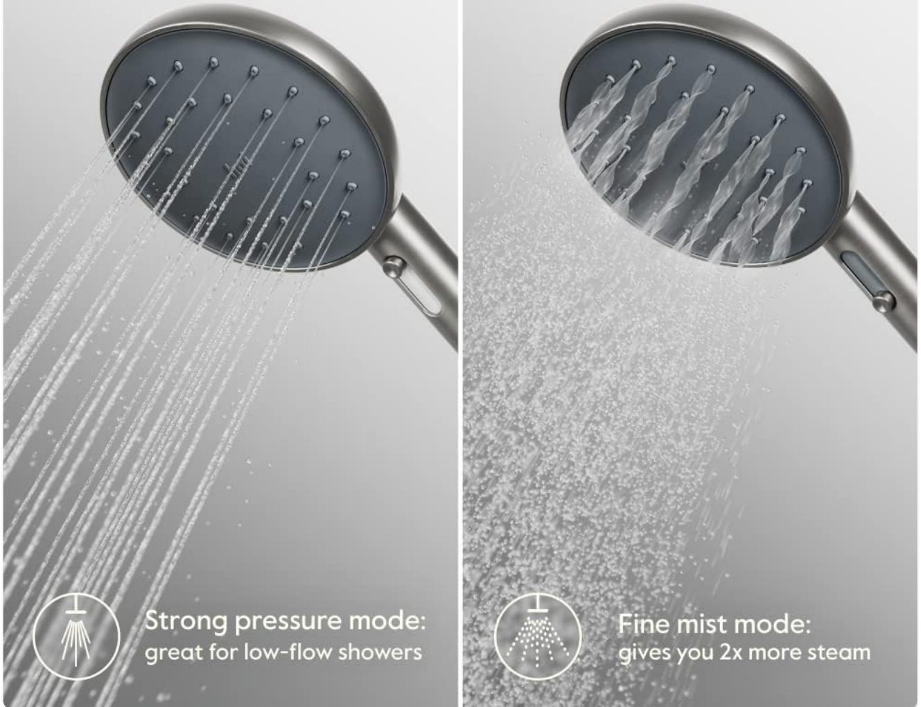
Image: A side-by-side comparison illustrating the strong pressure mode and the fine mist mode of the hai shower head.