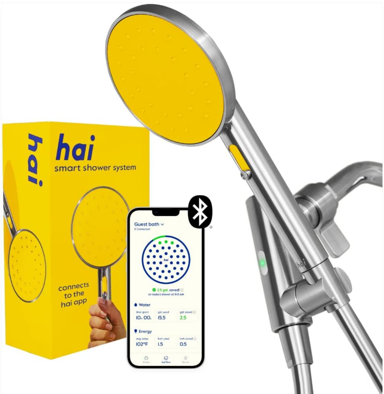
Image: The hai Smart Shower Head, its packaging, and a smartphone displaying the companion app interface.