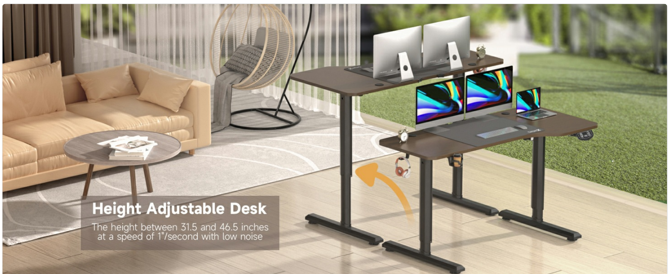
Figure 3.2: The Dripex standing desk in use, demonstrating its ergonomic benefits for both sitting and standing work postures.