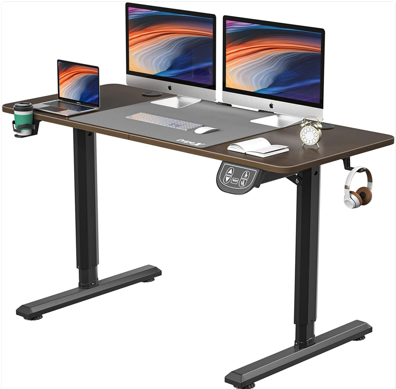
Figure 2.1: Overview of the Dripex Electric Standing Desk, showcasing its spacious desktop, dual monitor setup, laptop, and integrated accessories like a cup holder and headphone hook.