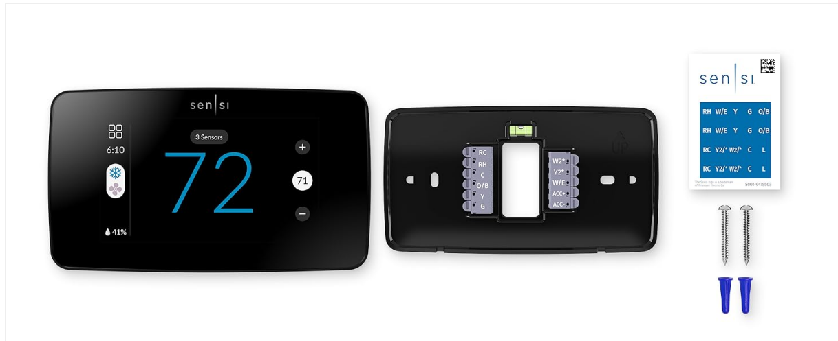
Included components for installation.