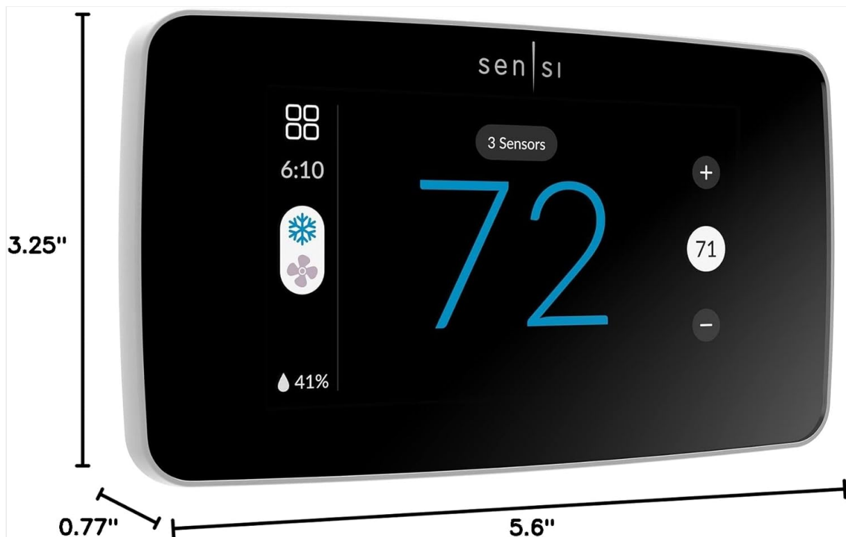
Physical dimensions of the Sensi Touch 2 Smart Thermostat.