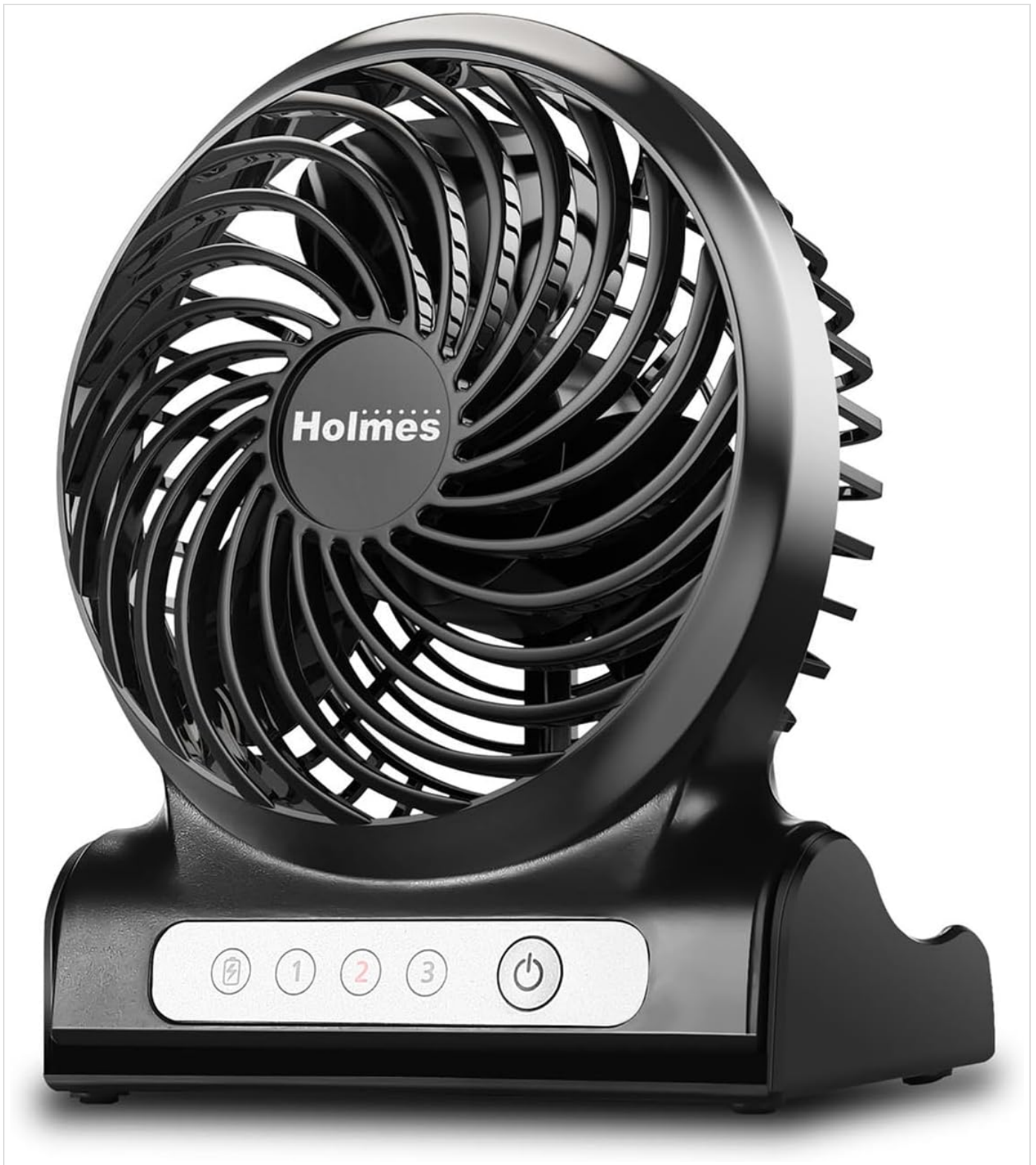
Image: The HOLMES 4-inch Personal Fan, a compact black fan with a circular head and a stable base.