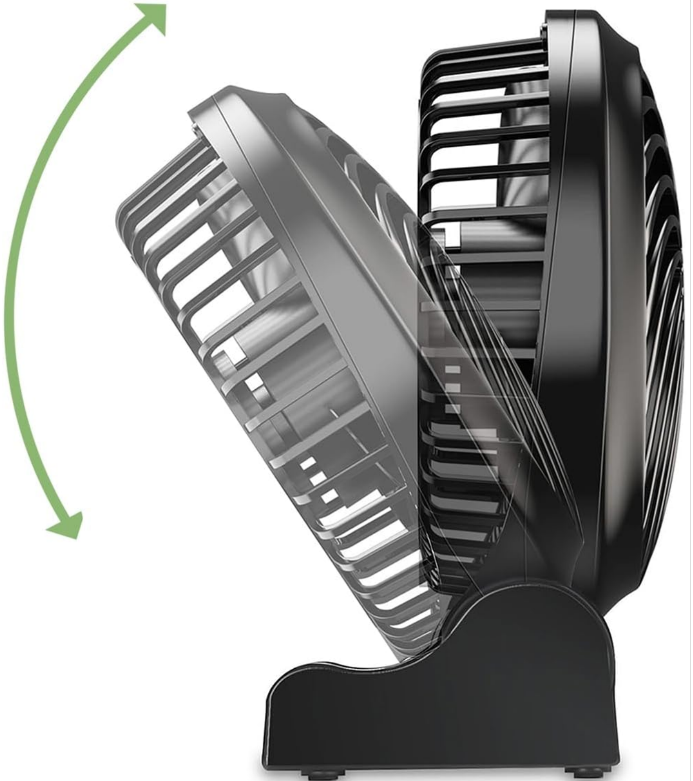
Image: A side view of the HOLMES Personal Fan demonstrating its 90-degree adjustable head tilt feature, indicated by a green arrow.